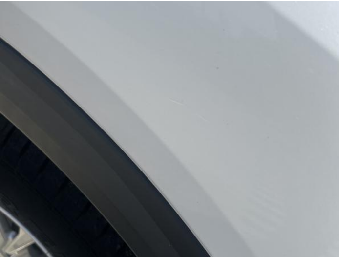
1: Wing osf Scratched UpTo 25mm Thru Paint