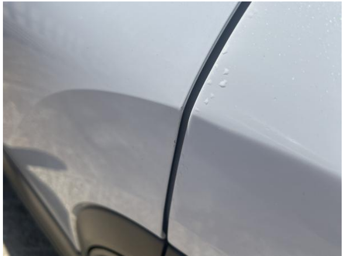
6: Door nsr Chipped Edge Chip