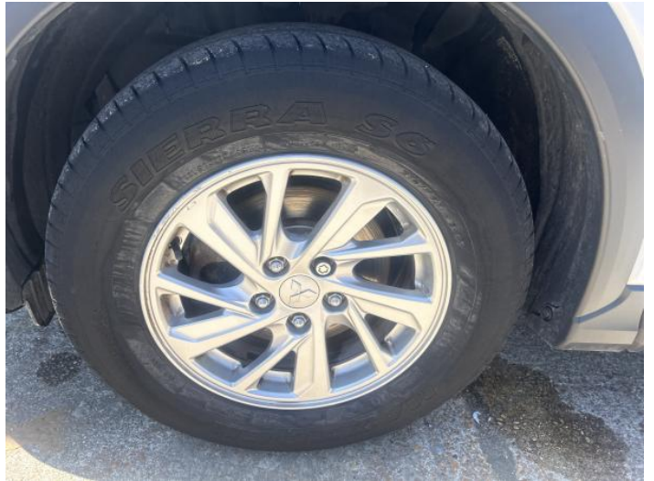
10: Wheel nsf Scratched Over 50mm