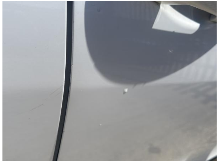
2: Door osf Chipped Edge Chip