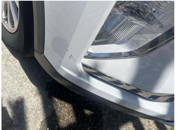
12: Bumper Front Scratched 25 to 100mm Thru Paint