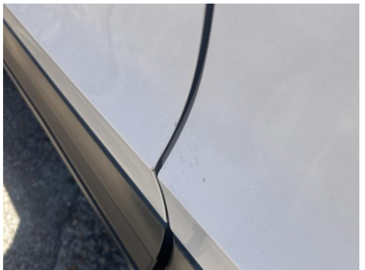
8: Door nsf Chipped Edge Chip