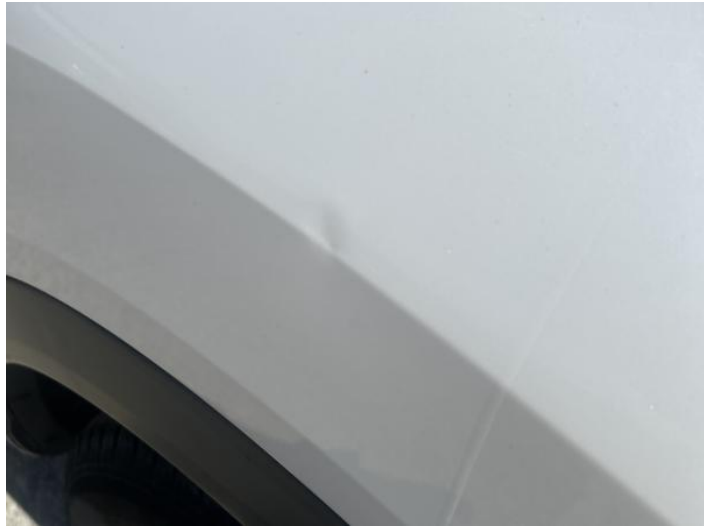
4: Qtr Panel osr Dented Between 10mm + 30mm