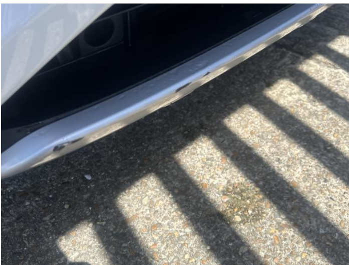
13: Bumper Front Moulding Scratched (Painted) Over 25mm Thru Paint