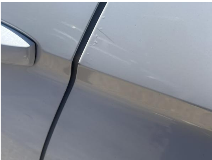
7: Door nsr Chipped 1 To 5