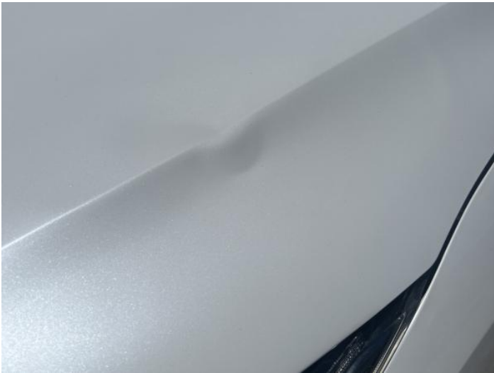
11: Bonnet Dented Over 30mm