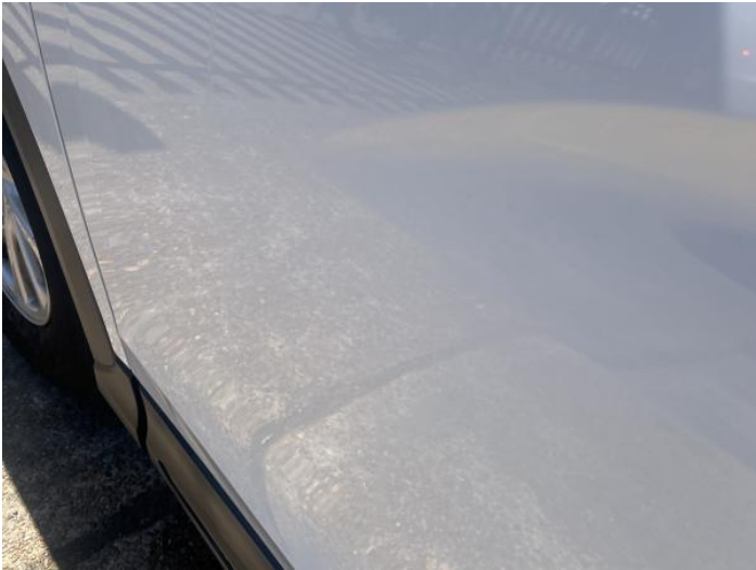
9: Door nsf Dented Between 10mm + 30mm