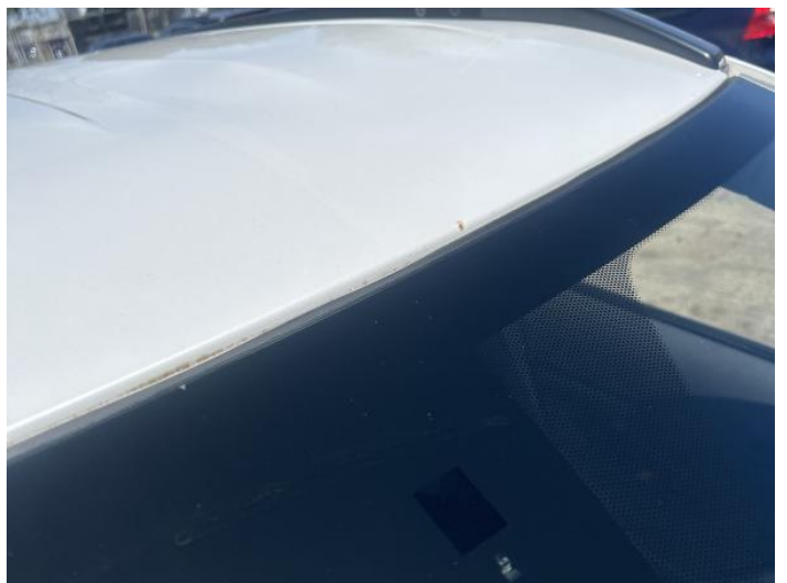
14: Roof Chipped 1 To 5