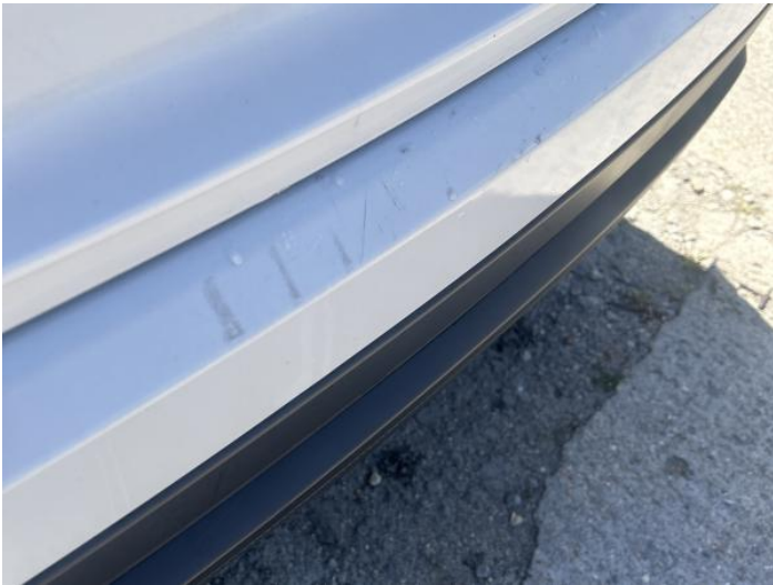
5: Bumper Rear Scratched 25 to 100mm Thru Paint