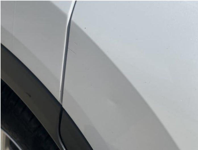
3: Door osr Dented With Paint Damage