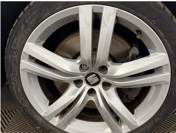
11: Wheel osf Scratched Over 50mm