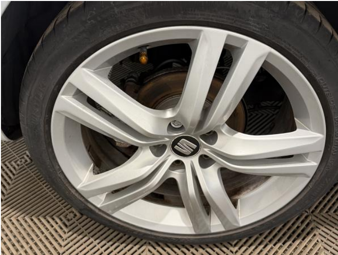
9: Wheel osf Scratched Up To 50mm