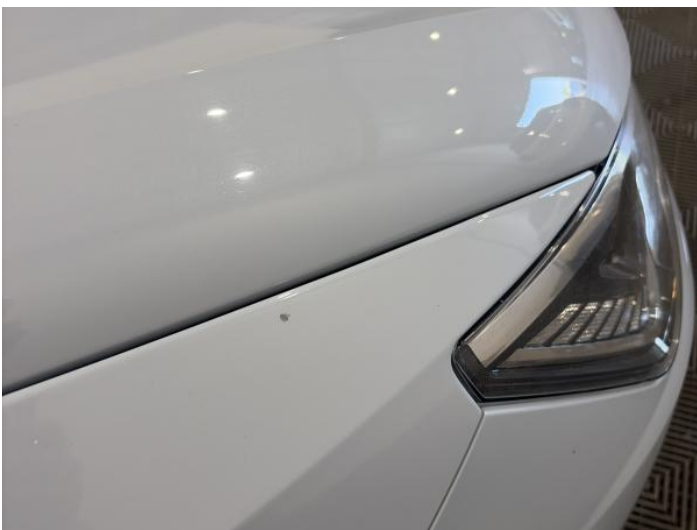
13: Wing osf Chipped 1 To 5