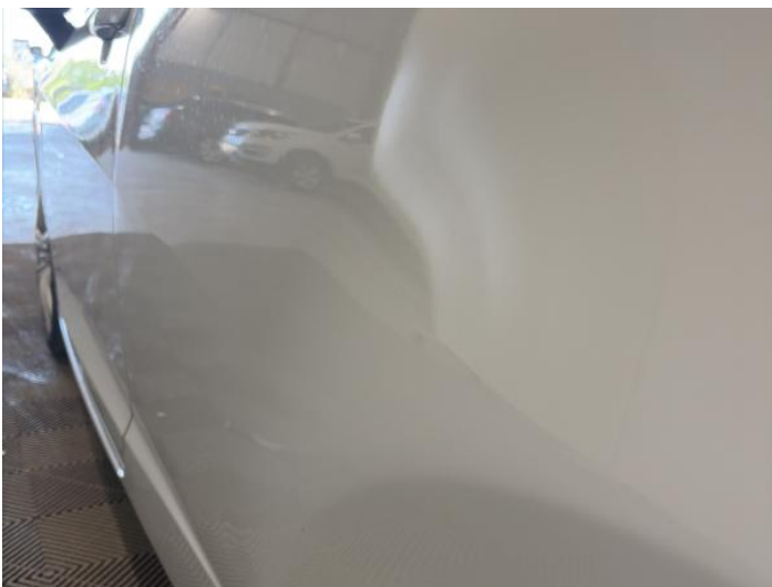
7: Qtr Panel nsr Dented Over 30mm