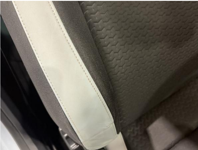
1: Seat Back Cover osf Scuffed Over 25mm