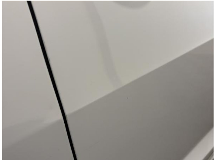
10: Door osf Chipped Edge Chip