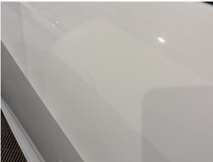
5: Door nsf Chipped 1 To 5