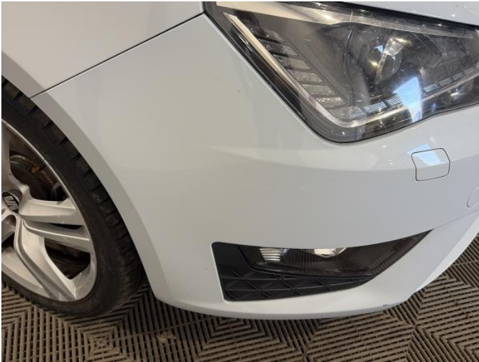
3: Bumper Front Poor Previous Repair Poor Paint