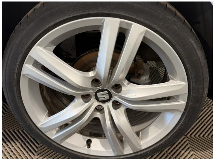
6: Wheel nsr Scratched Up To 50mm