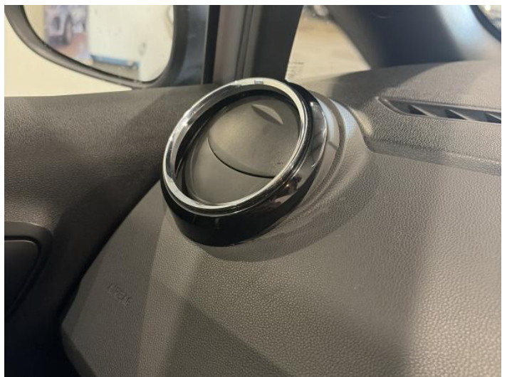
14: Air Vents nsf Damaged Replace