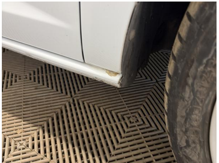
12: Sill os Scratched Over 25mm Thru Paint