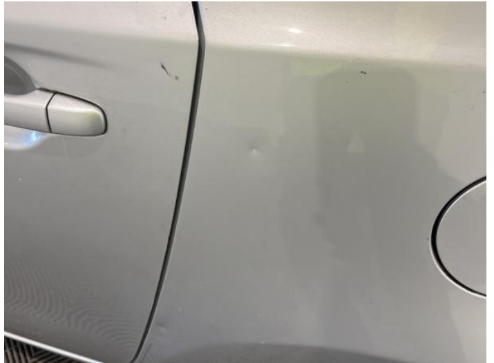
10: Qtr Panel nsr Dented Over 30mm