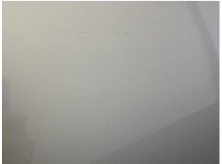
16: Door osf Scratched Over 25mm Thru Paint