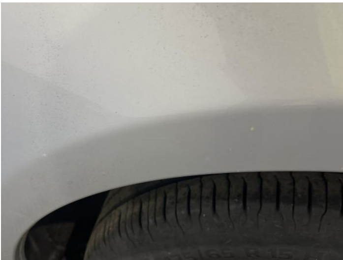
11: Qtr Panel nsr Scratched Over 25mm Thru Paint