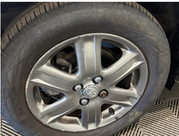
7: Wheel nsf Scratched Over 50mm