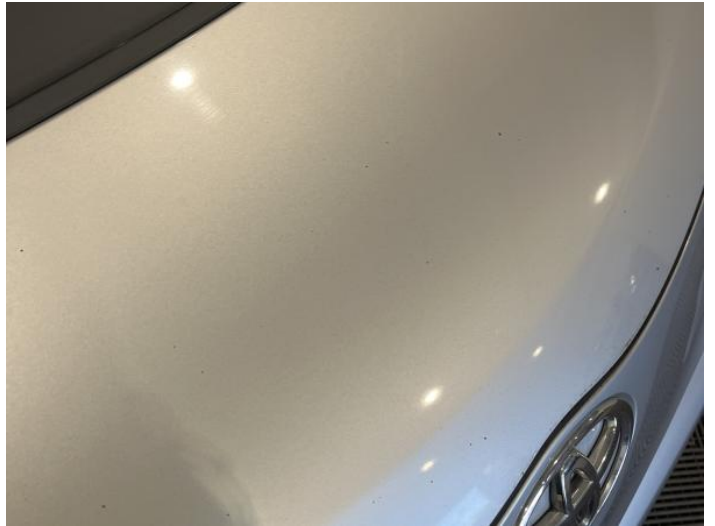
4: Bonnet Chipped Multiple Chips