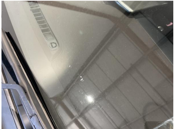
6: Screen Front Chipped Over 10mm