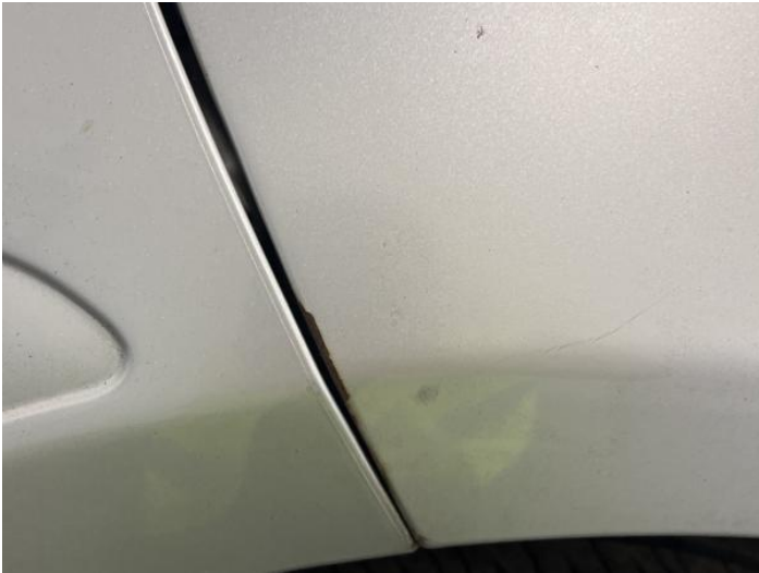
15: Qtr Panel osr Rusted Over 5mm