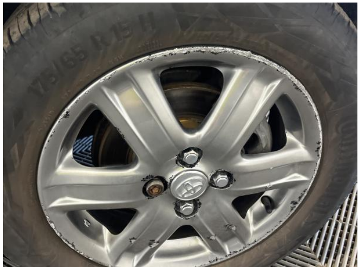
2: Wheel osf Scratched Over 50mm