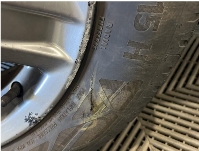
1: Tyre nsf Damaged Replace