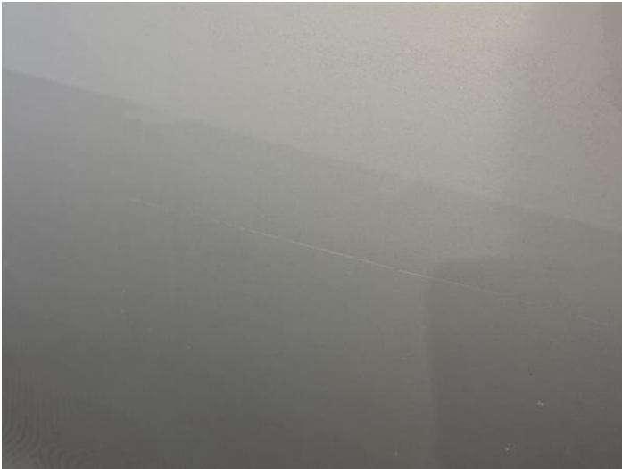
9: Door nsf Scratched Over 25mm Thru Paint