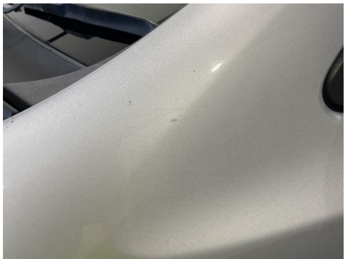
8: Wing nsf Scratched Over 25mm Thru Paint