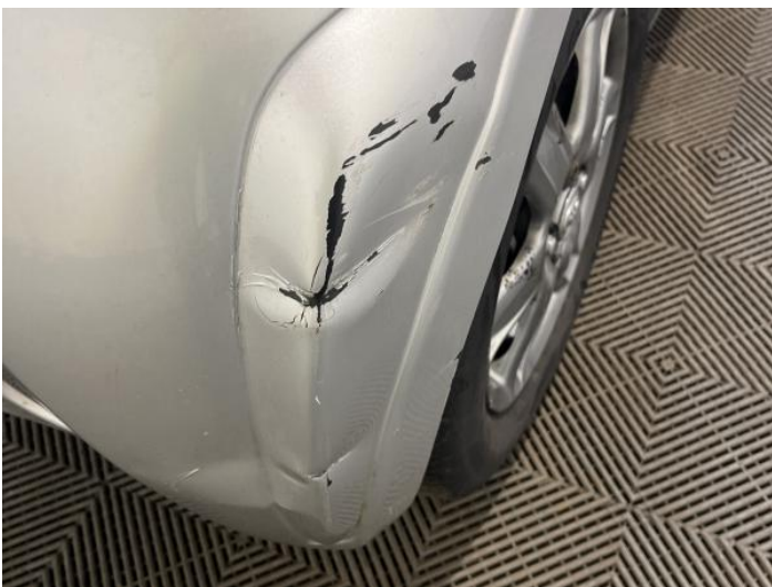
13: Bumper Rear Dented With Paint Damage