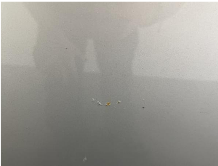
17: Door osf Rusted UpTo 5mm