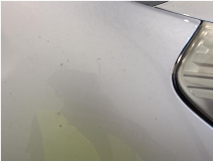
3: Wing osf Scratched UpTo 25mm Thru Paint