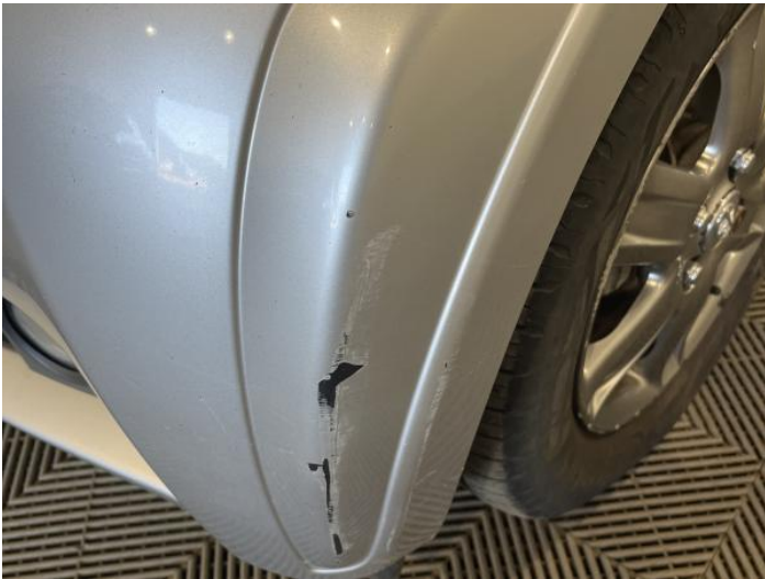
5: Bumper Front Scratched Over 100mm Thru Paint