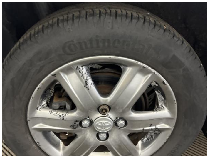
14: Wheel osr Scratched Over 50mm