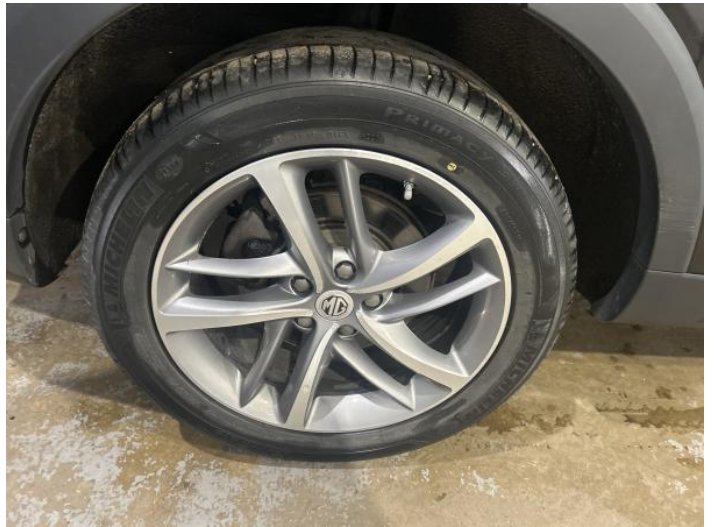
6: Wheel osr Corroded Light