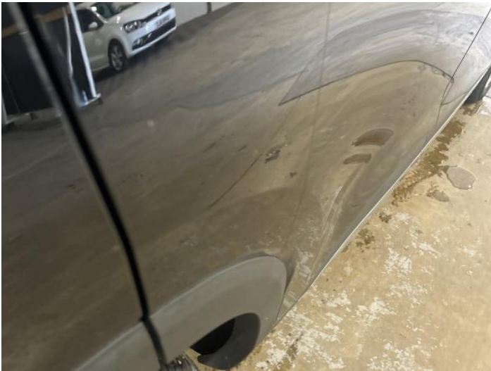
5: Door osr Dented Between 10mm + 30mm