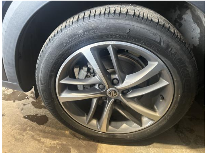
10: Wheel nsf Corroded Light