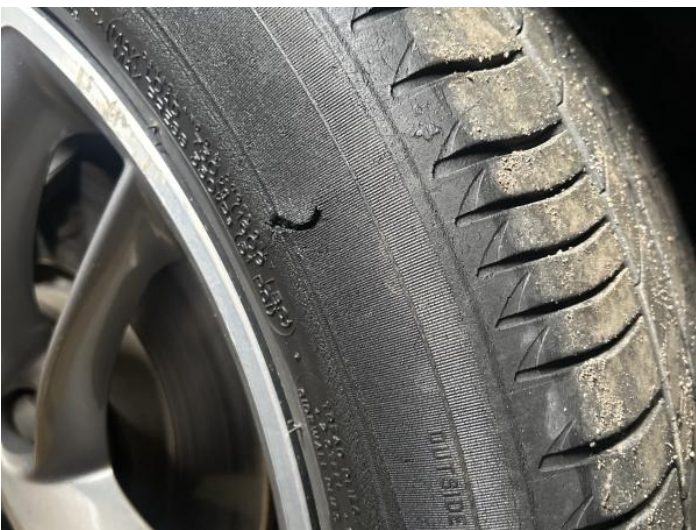
13: Tyre nsf Damaged Replace