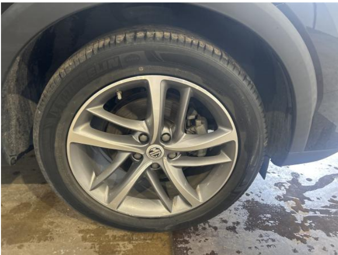
1: Wheel osf Scratched Up To 50mm