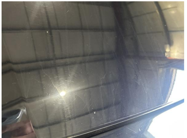
12: Bonnet Chipped 1 To 5