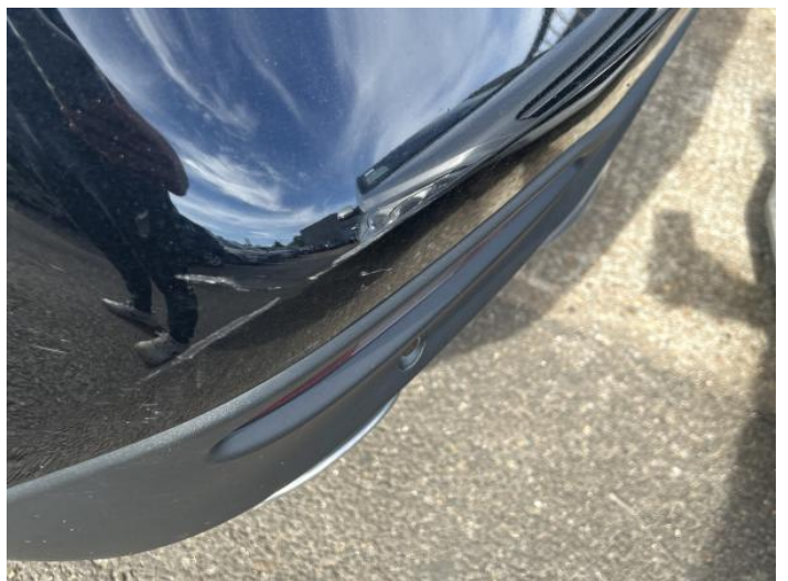
8: Bumper Rear Scratched Over 100mm Thru Paint