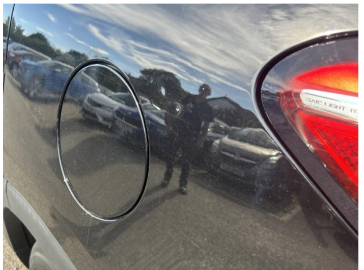
14: Qtr Panel nsr Dented Between 10mm + 30mm