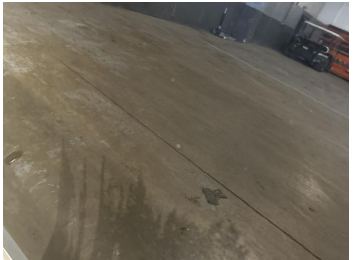
2: Door osf Chipped 1 To 5