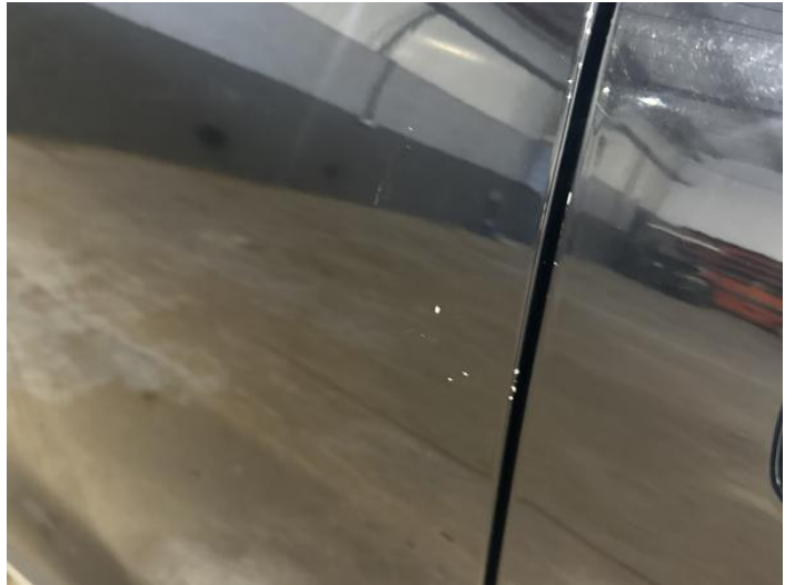
4: Door osr Chipped 1 To 5