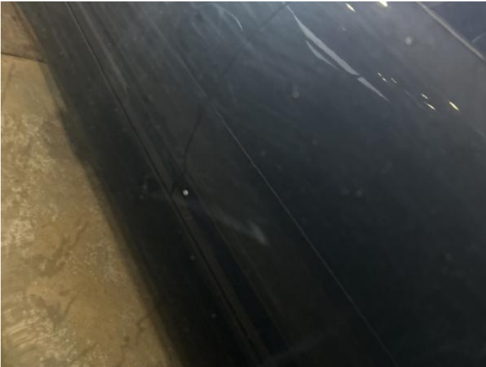
9: Door nsf Chipped 1 To 5