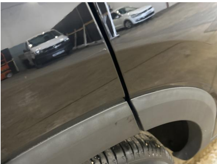
7: Qtr Panel osr Chipped 1 To 5