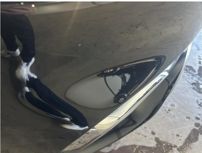
11: Bumper Front Chipped 1 To 5