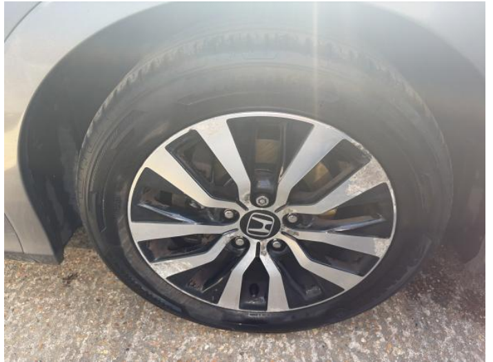
10: Wheel nsf Corroded Light