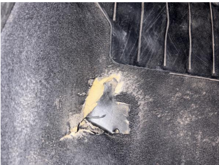
13: Carpets Front Holed Over 3mm