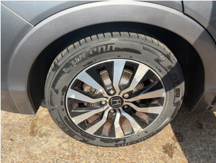
3: Wheel osr Corroded Light