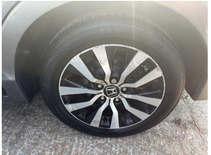
6: Wheel nsr Corroded Light