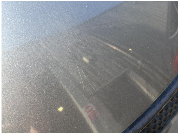
12: Bonnet Scratched Over 25mm Thru Paint