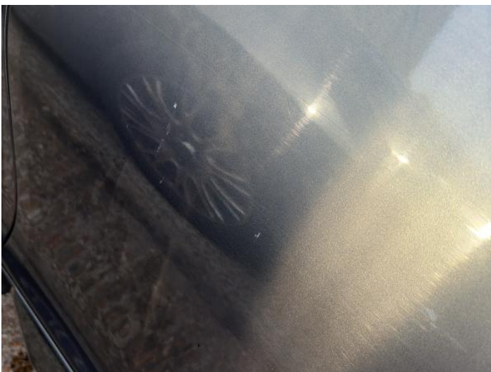
7: Door nsr Chipped 1 To 5