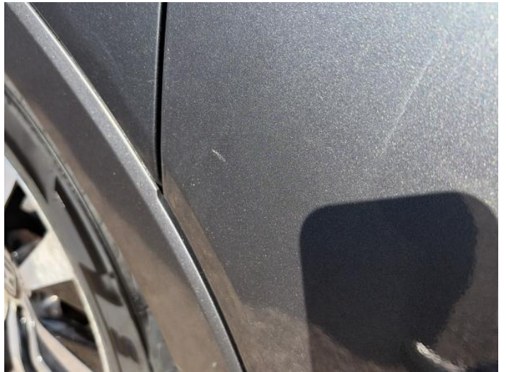
2: Door osr Chipped 1 To 5