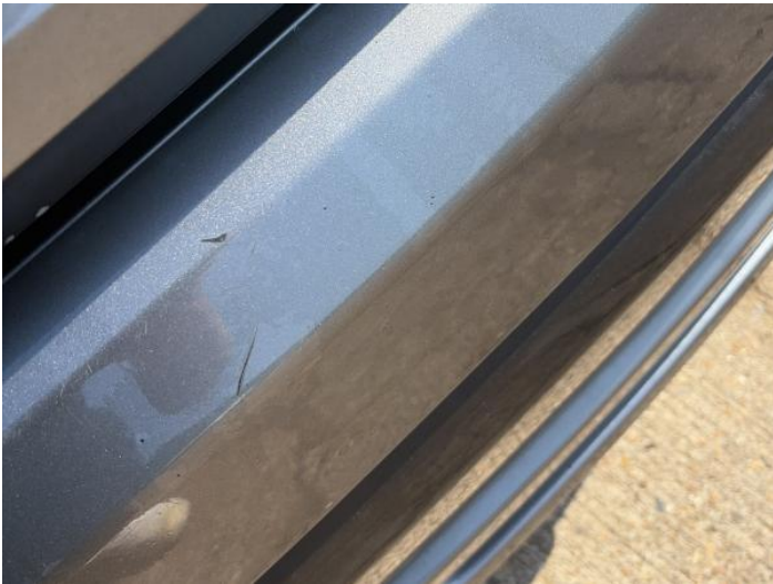
5: Bumper Rear Chipped 1 To 5