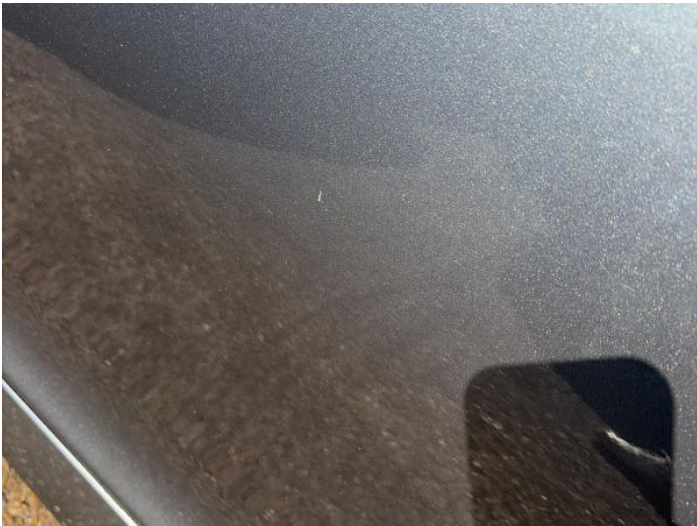
1: Door osf Chipped 1 To 5