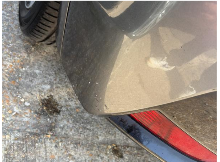
4: Bumper Rear Scratched 25 to 100mm Thru Paint