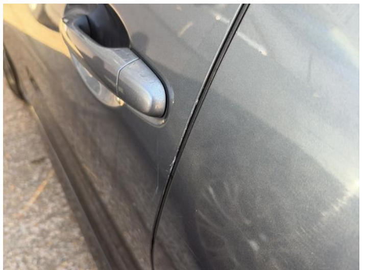
8: Door nsf Chipped Edge Chip