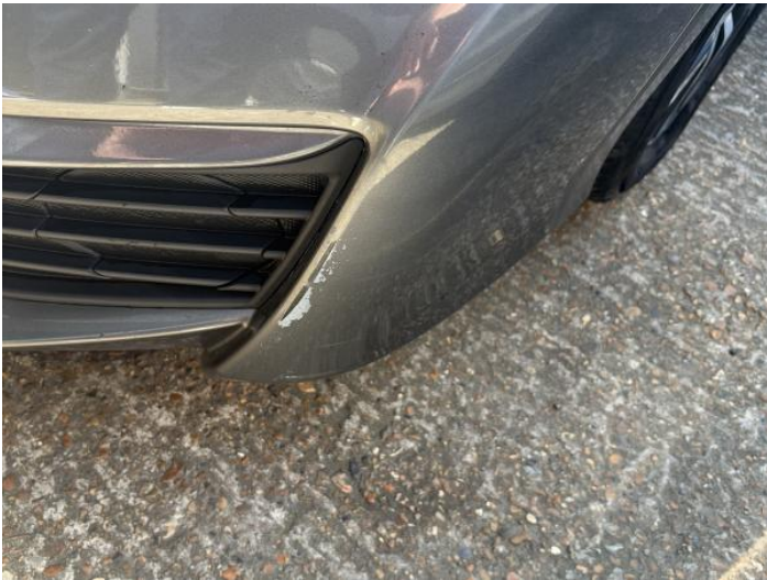
11: Bumper Front Scratched 25 to 100mm Thru Paint