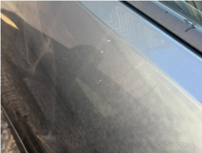
9: Door nsf Chipped 1 To 5