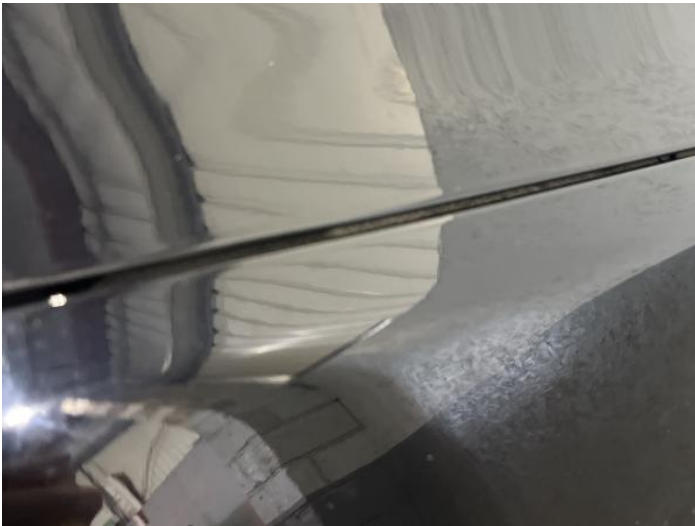
1: Wing of Scratched Over 25mm Thru Paint