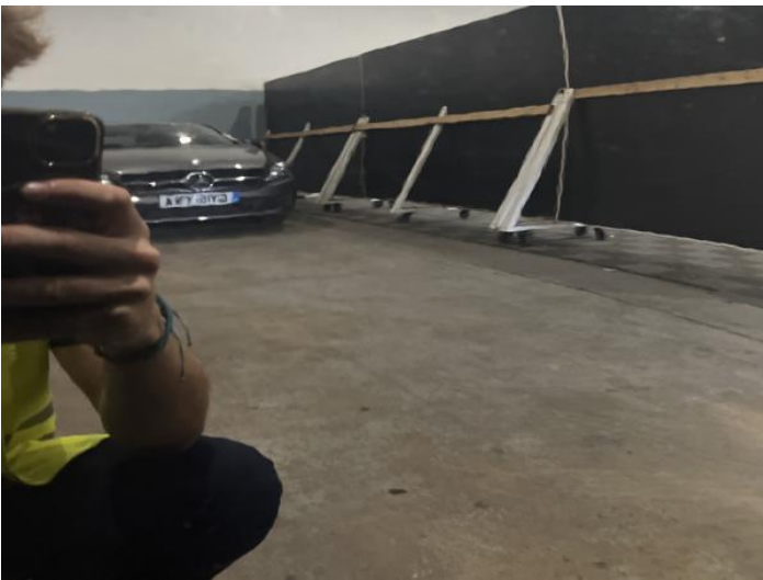
5: Door nsr Scratched Over 25mm Thru Paint