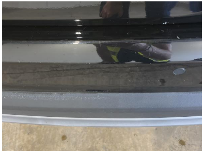
6: Bumper Rear Scratched 25 to 100mm Thru Paint