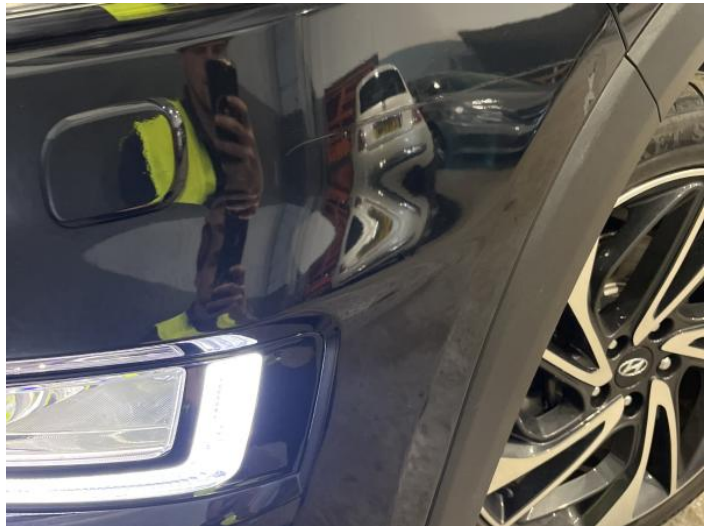
2: Bumper Front Poor Previous Repair Paint Flake