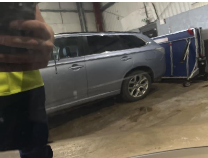
7: Qtr Panel osr Scratched Over 25mm Thru Paint