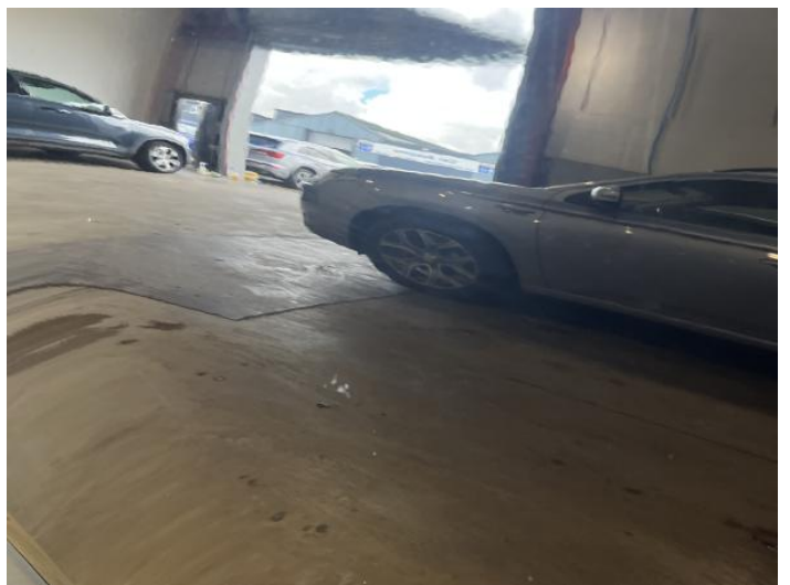
8: Door nsr Scratched Over 25mm Thru Paint