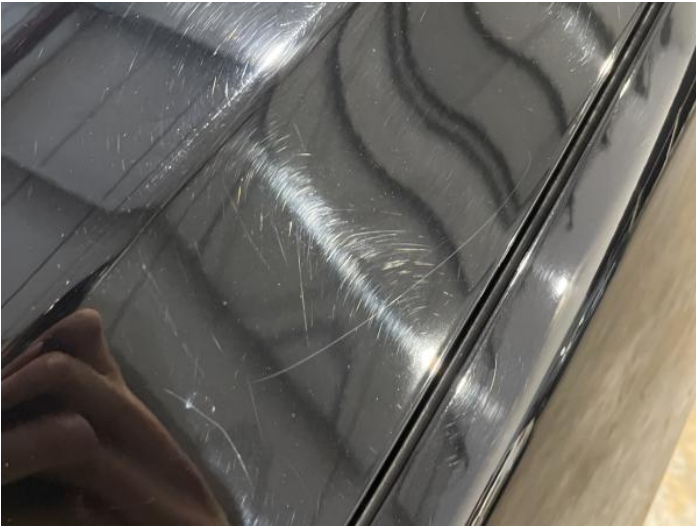
3: Bonnet Scratched Over 25mm Thru Paint