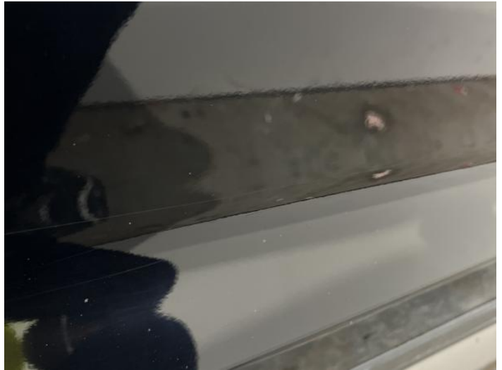
10: Door osf Scratched Over 25mm Thru Paint