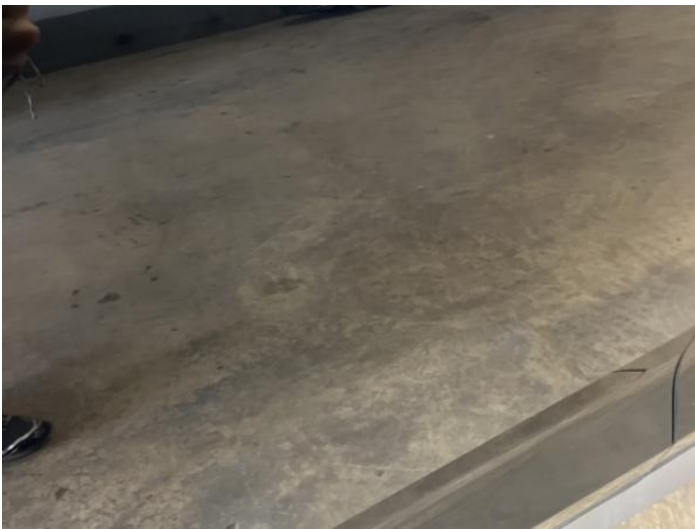
11: Door osf Scratched Over 25mm Thru Paint