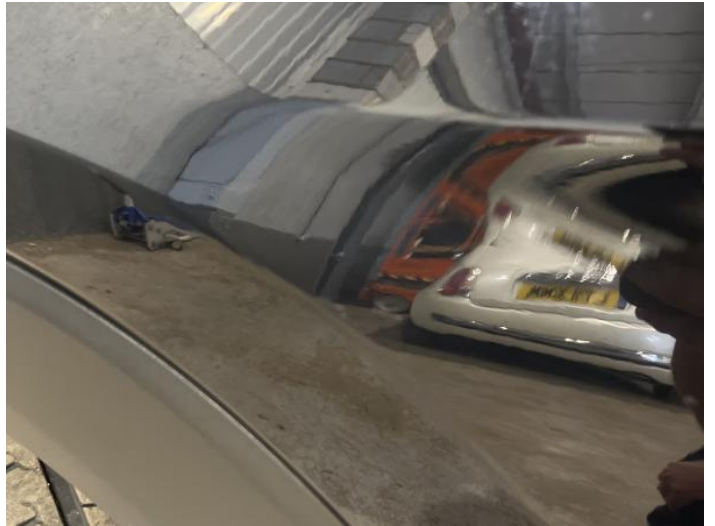
4: Wing nsf Scratched UpTo 25mm Thru Paint