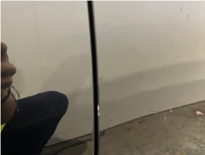
9: Door osf Chipped Edge Chip