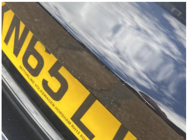
8: Tailgate Chipped Multiple Chips