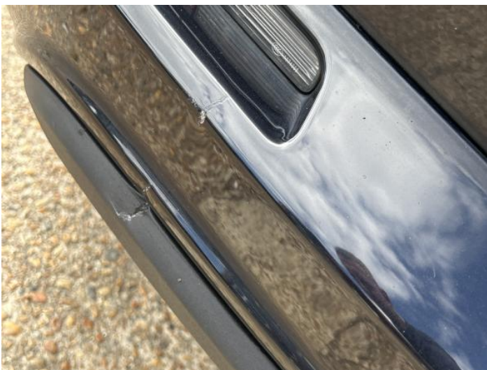
7: Bumper Rear Dented With Paint Damage