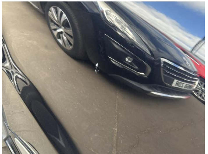
6: Door osr Chipped 1 To 5