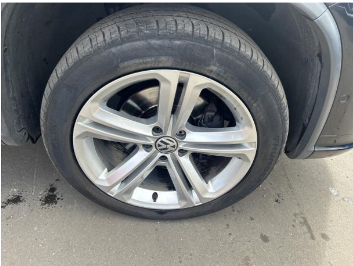
1: Wheel of Scratched Up To 50mm