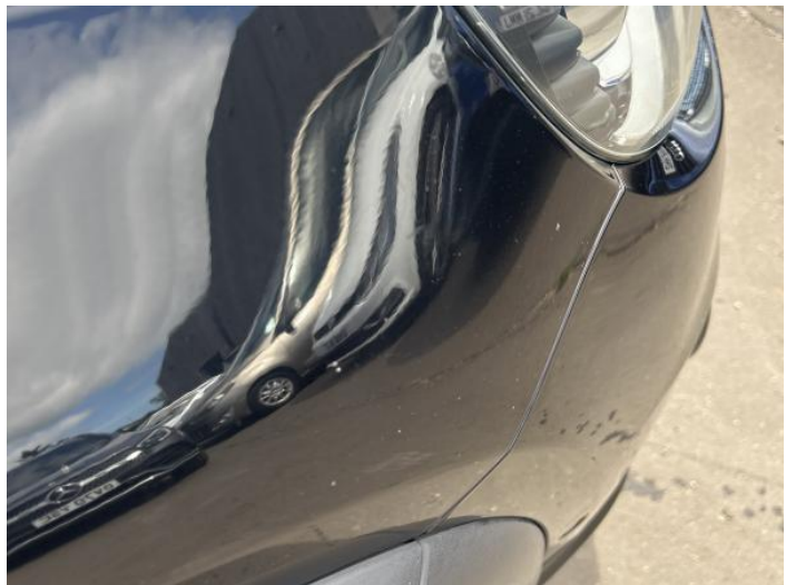
2: Wing of Chipped 1 To 5