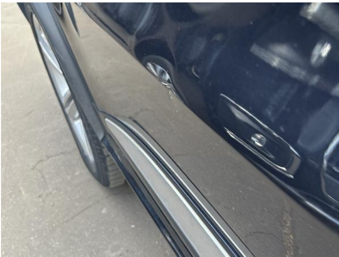
5: Door osr Dented Between 10mm + 30mm