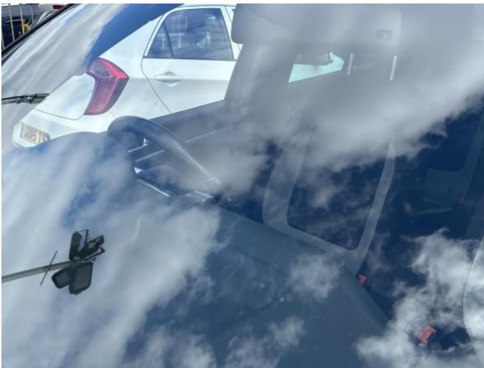
17: Screen Front Chipped Up To 10mm