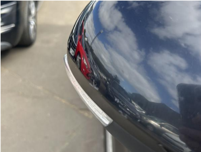
3: Door Mirror Assy osf Scratched (Painted) UpTo 25mm Thru Paint