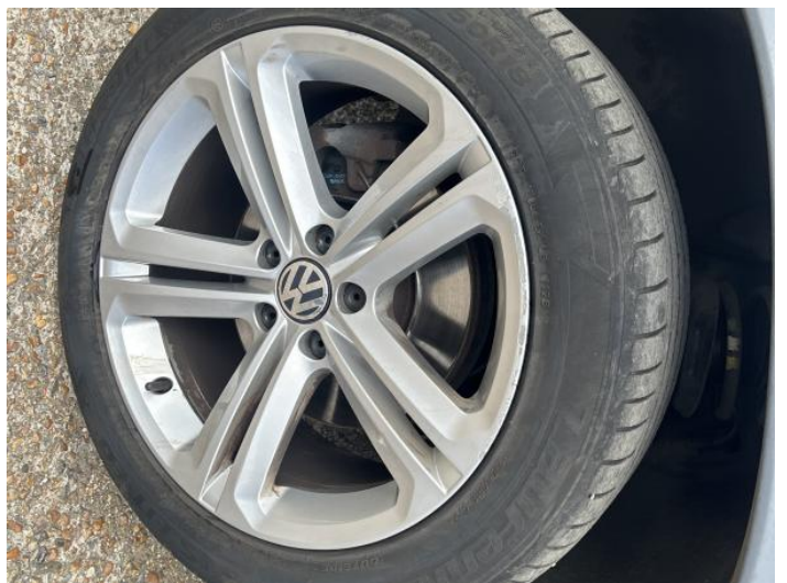
14: Wheel nsf Scratched Over 50mm