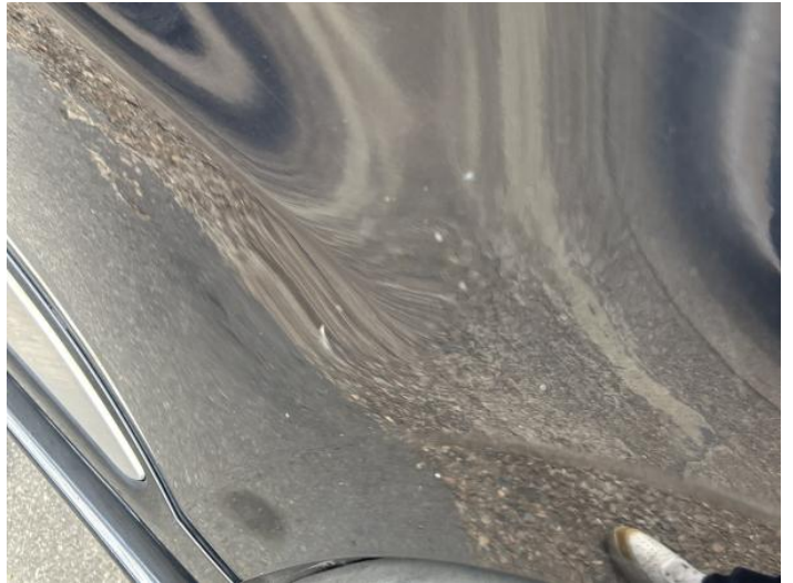
10: Door nsr Chipped 1 To 5