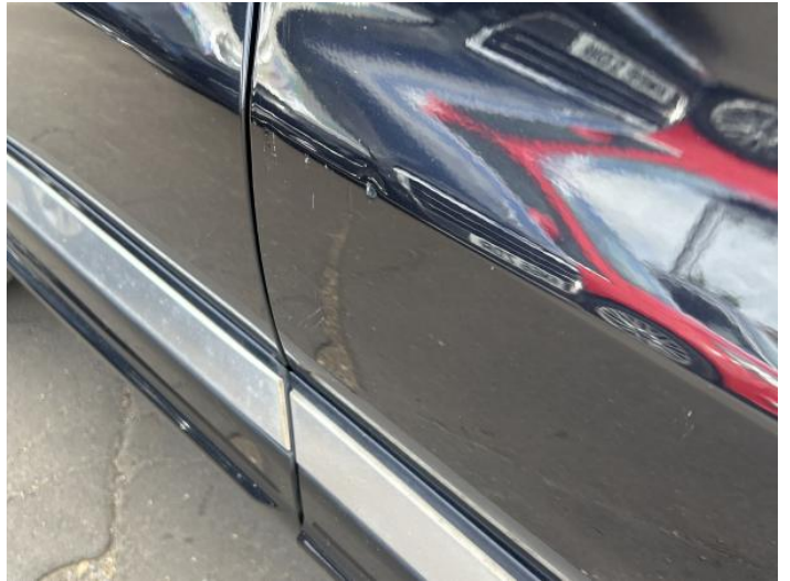
4: Door osf Dented With Paint Damage