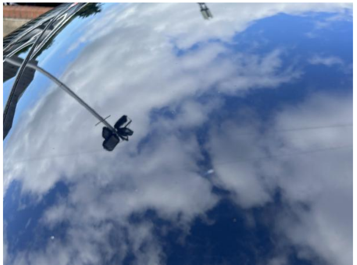
18: Roof Chipped 1 To 5