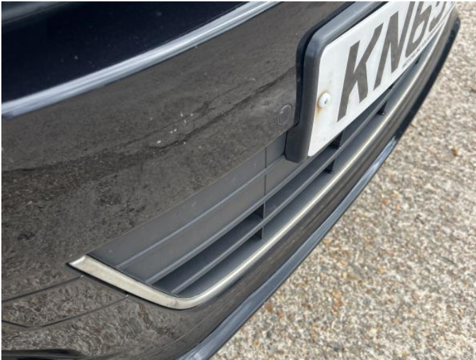
15: Bumper Front Chipped Multiple Chips