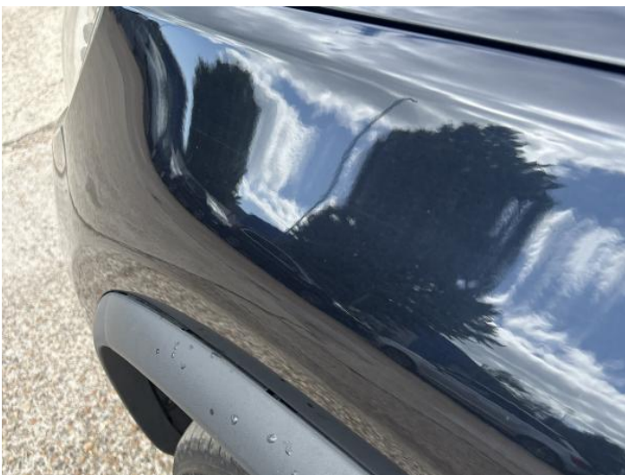
13: Wing nsf Dented Between 10mm + 30mm