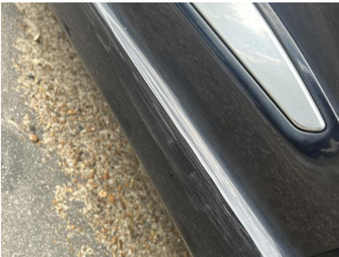
11: Door Moulding nsr Scratched (Painted) Over 25mm Thru Paint