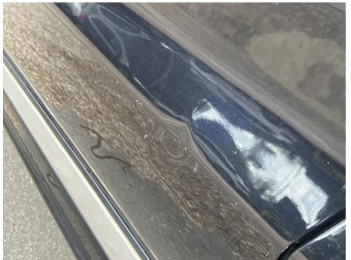
12: Door nsf Dented With Paint Damage