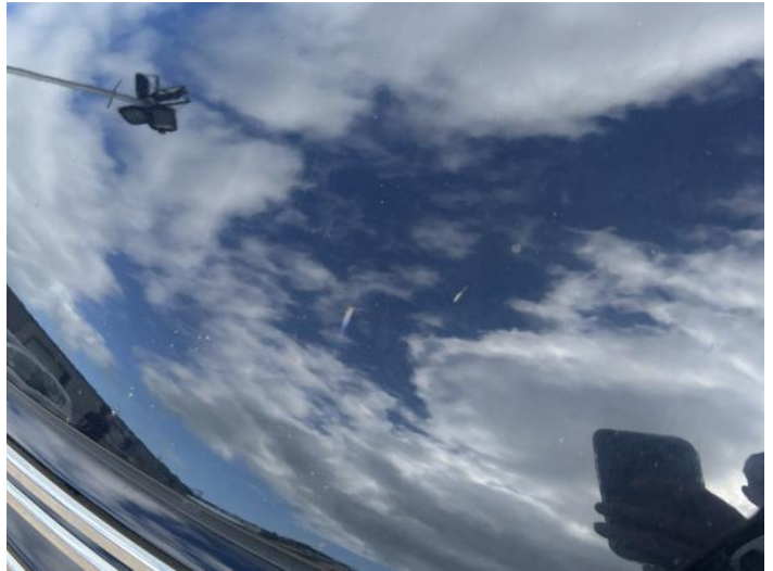
16: Bonnet Chipped 1 To 5