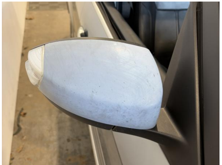
24: Door Mirror Assy osf Scratched (Painted) Over 25mm Thru Paint