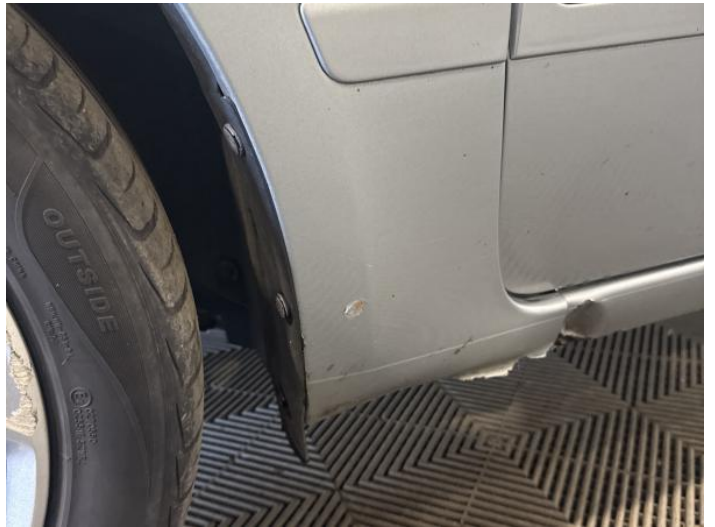
6: Wing nsf Scratched Rusted