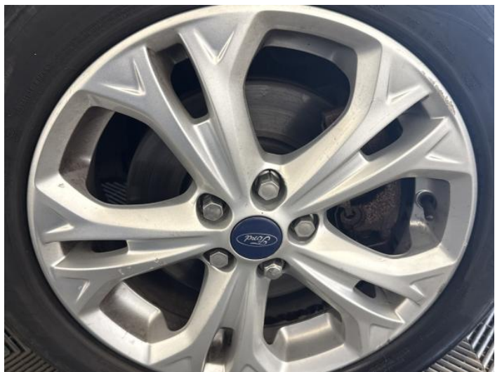
20: Wheel osf Scratched Over 50mm