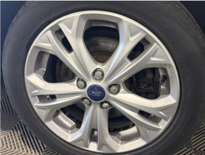
9: Wheel osr Scratched Up To 50mm