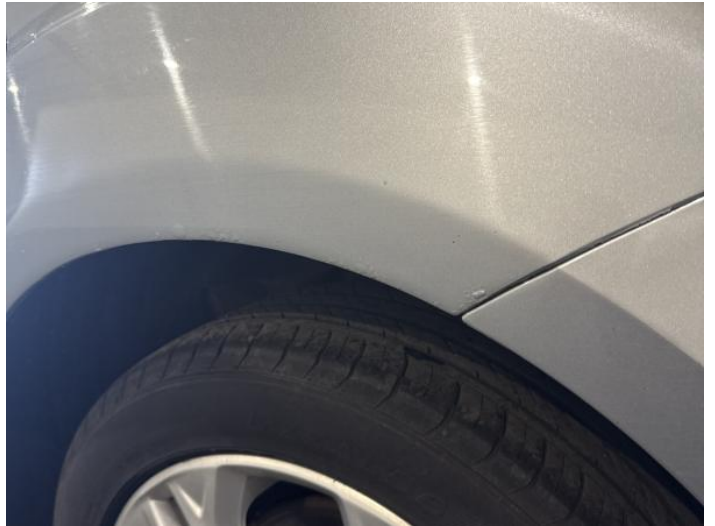
10: Qtr Panel nsr Rusted Over 5mm