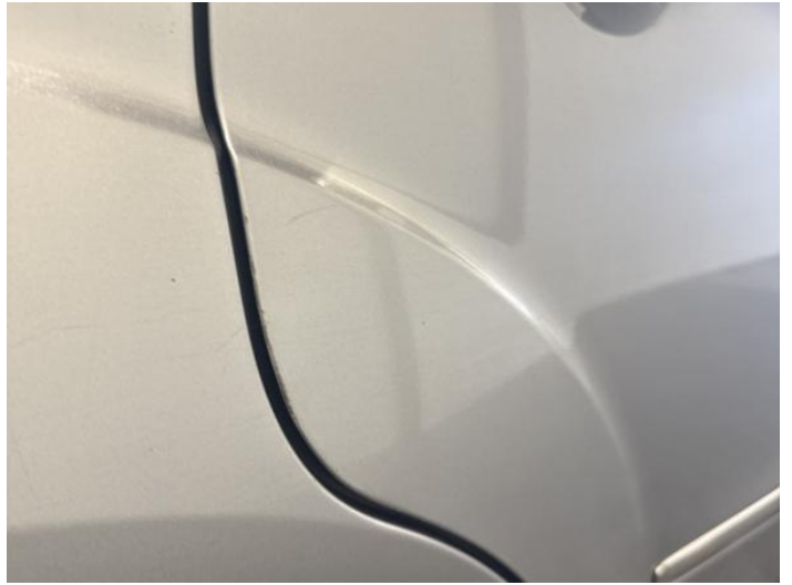
16: Door osr Chipped Edge Chip