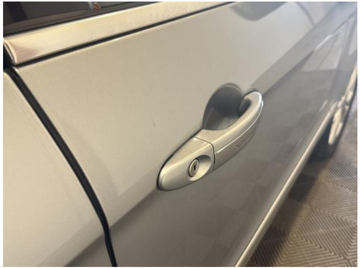
18: Door osf Dented Between 10mm + 30mm