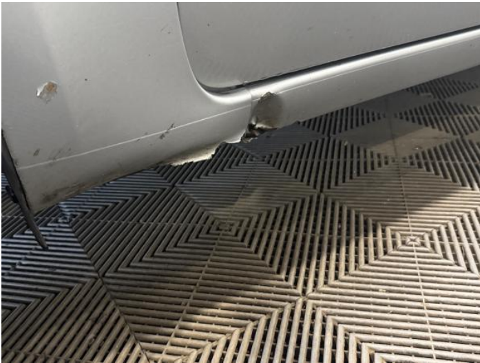
5: Sill ns Dented With Paint Damage