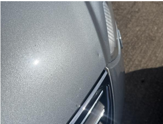
1: Bonnet Dented Between 10mm + 30mm