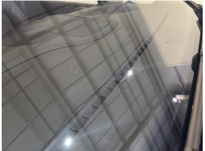
22: Screen Front Chipped UpTo 10mm