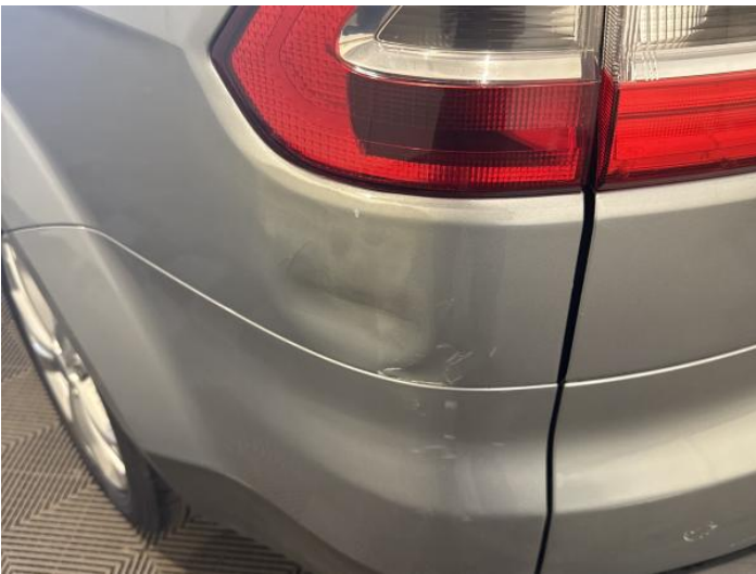
11: Qtr Panel nsr Dented With Paint Damage