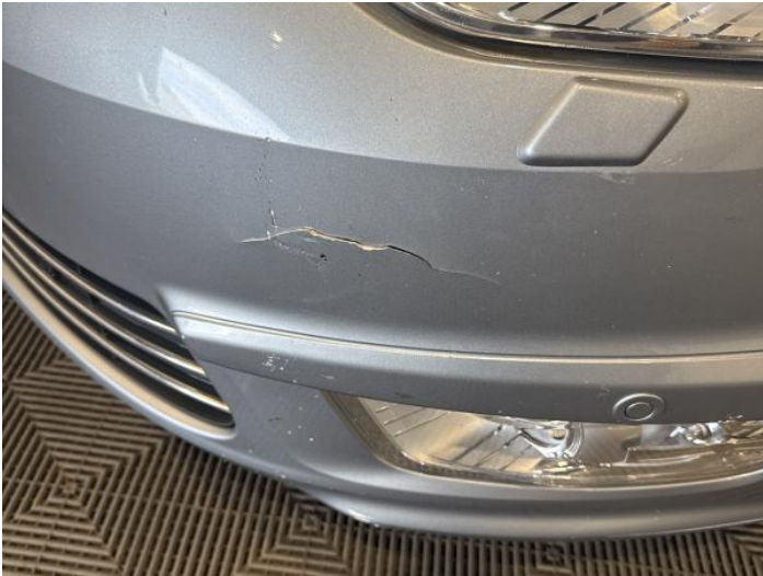
3: Bumper Front Cracked Over 25mm