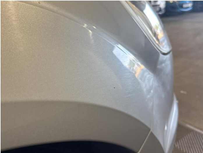
21: Wing osf Chipped 1 To 5