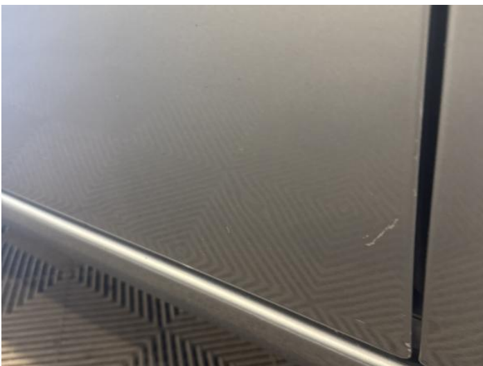
7: Door nsf Scratched Over 25mm Thru Paint