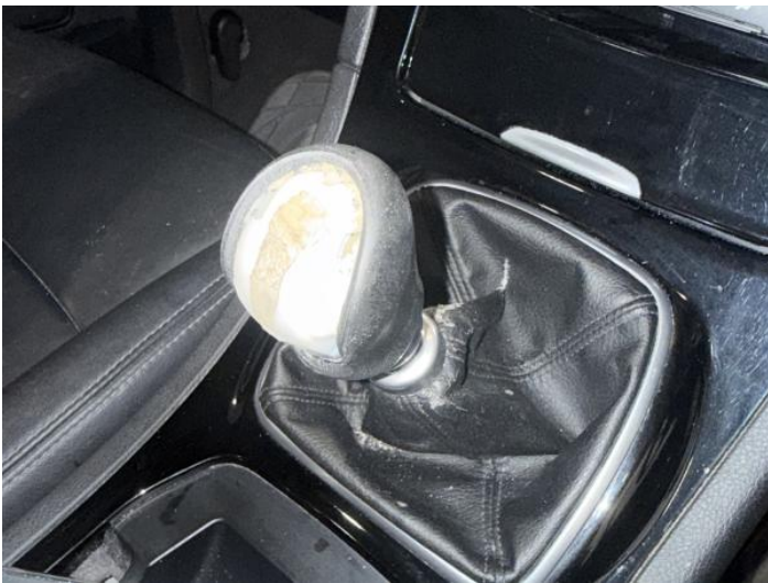
23: Switches And Controls Broken Replace