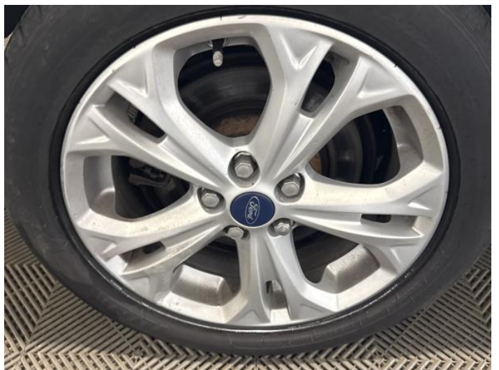
14: Wheel osr Scratched Up To 50mm