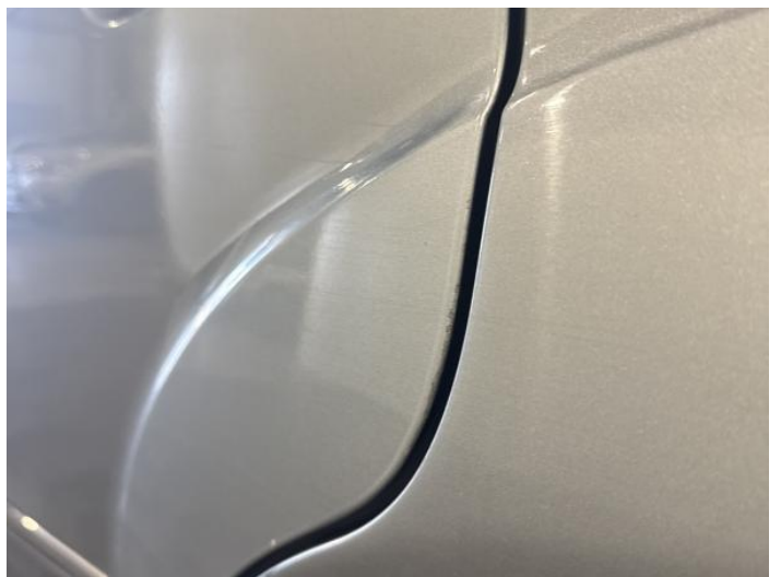
8: Door nsr Chipped Edge Chip