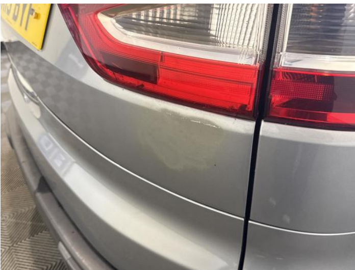
13: Tailgate Dented With Paint Damage