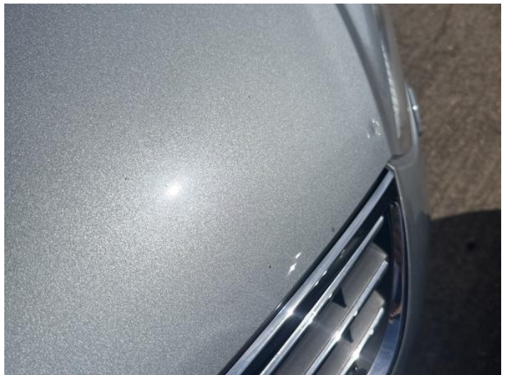
2: Bonnet Chipped 1 To 5