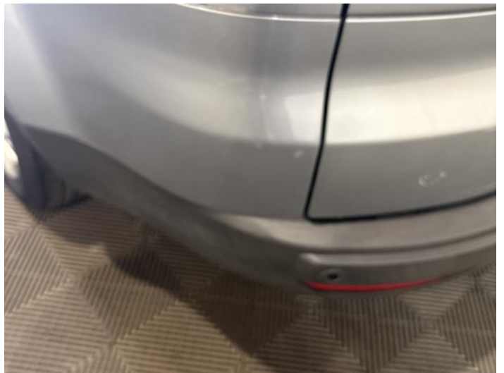
12: Bumper Rear Scratched Over 100mm Thru Paint