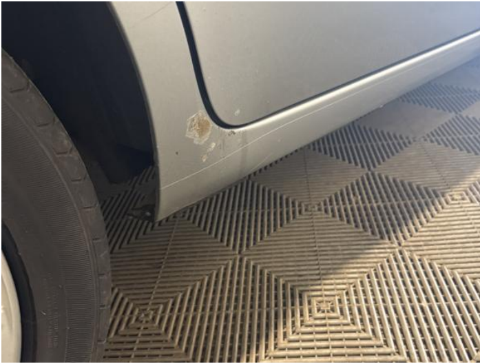
15: Qtr Panel osr Scratched Rusted