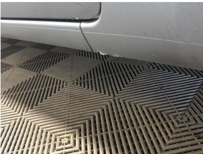
19: Sill os Rusted Over 5mm