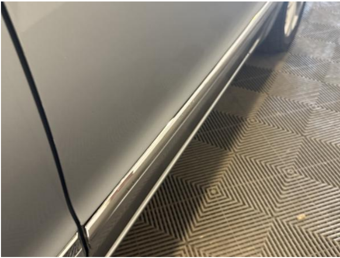
17: Door osf Scratched Over 25mm Thru Paint