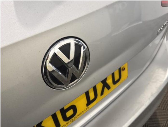
9: Tailgate Dented Over 30mm