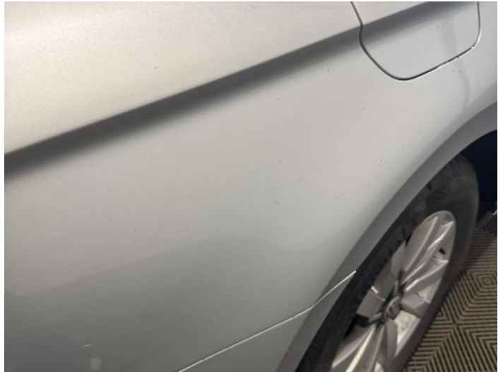
10: Qtr Panel osr Scratched Over 25mm Thru Paint