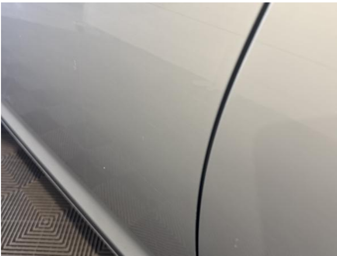
5: Door nsf Dented Over 30mm