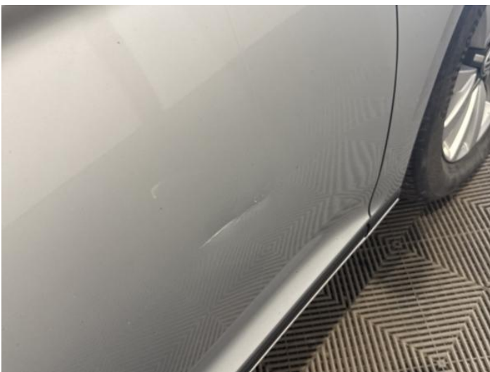
13: Door osf Dented With Paint Damage