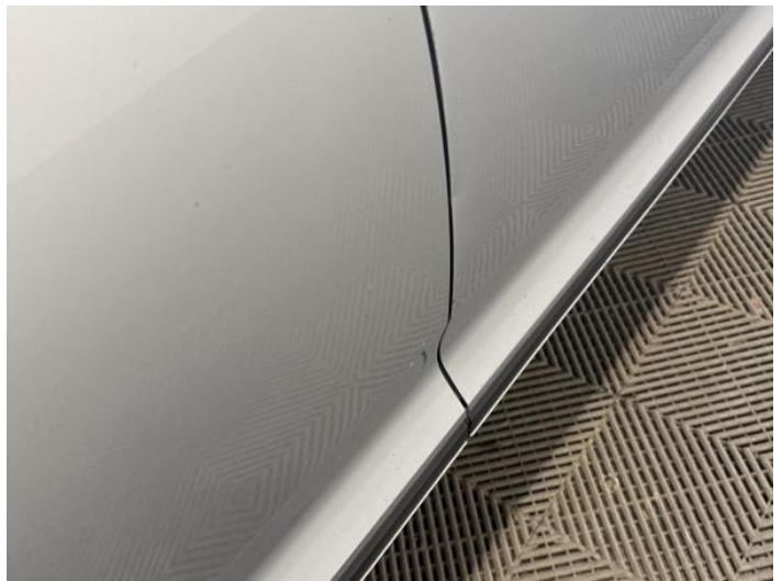
12: Door osr Chipped 1 To 5