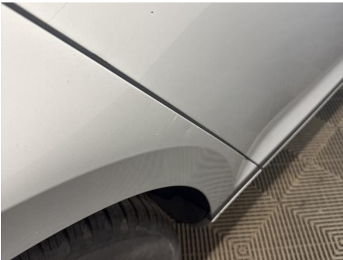
11: Qtr Panel osr Dented Between 10mm + 30mm