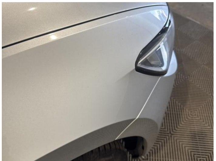
14: Wing osf Chipped 1 To 5