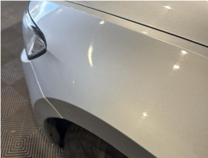
3: Wing nsf Poor Previous Repair Poor Paint