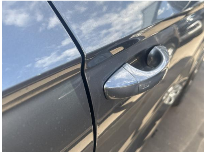
4: Door osf Chipped Edge Chip