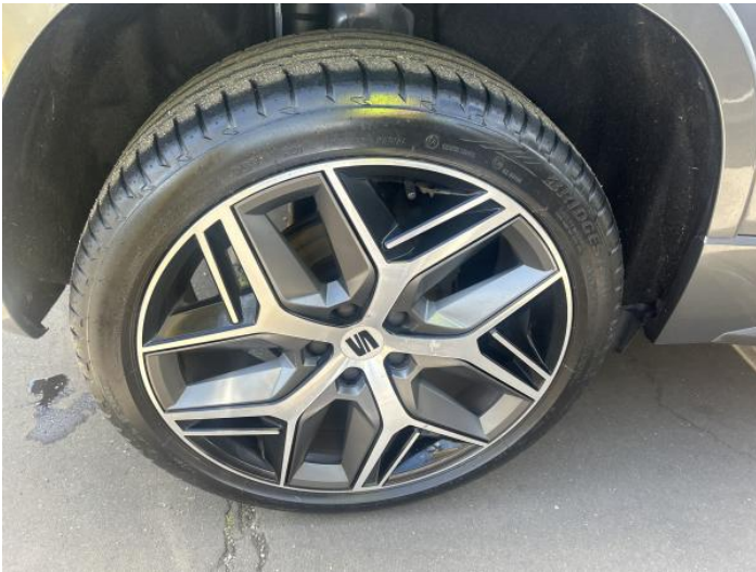
5: Wheel osr Corroded Light