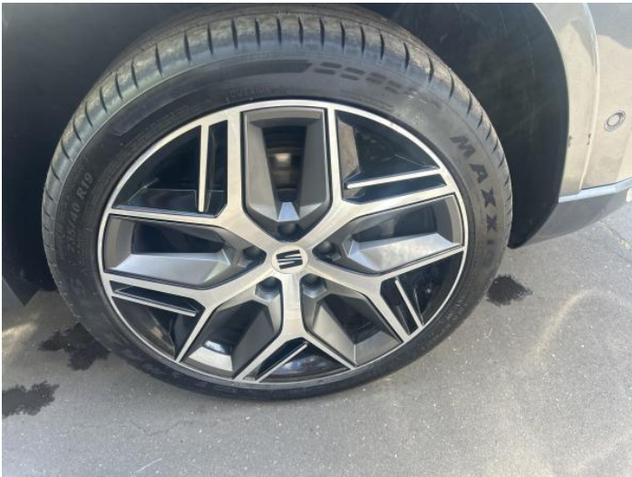
1: Wheel osf Corroded Light