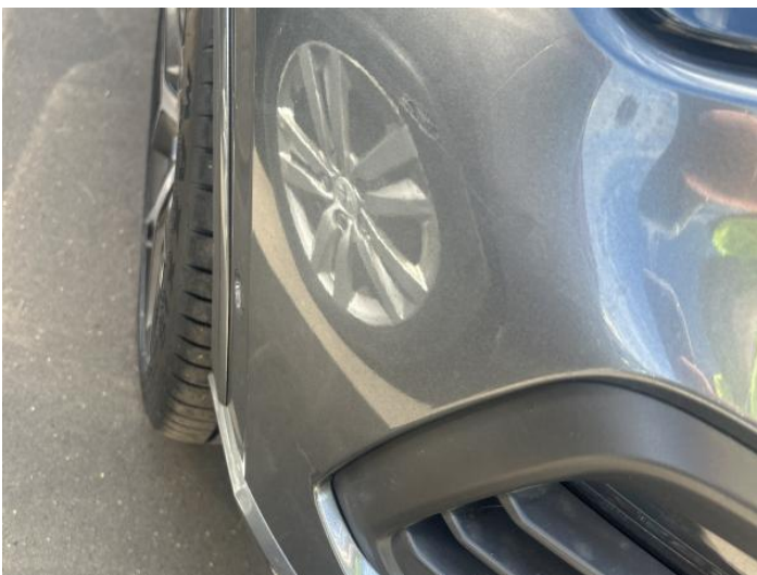
13: Bumper Front Scratched 25 to 100mm Thru Paint