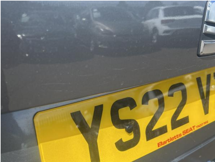
9: Tailgate Scratched Over 25mm Thru Paint