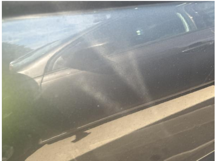
6: Door osr Chipped 1 To 5