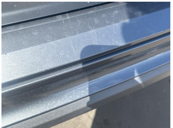
8: Bumper Rear Chipped 1 To 5