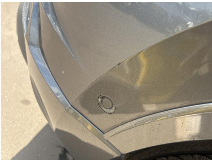
7: Bumper Rear Scratched 25 to 100mm Thru Paint