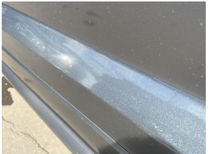
12: Door nsf Poor Previous Repair Poor Paint