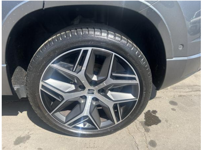
10: Wheel nsr Corroded Light