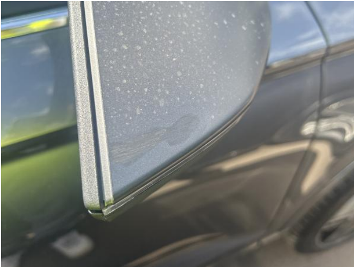
3: Door Mirror Assy osf Scratched (Painted) Over 25mm Thru Paint