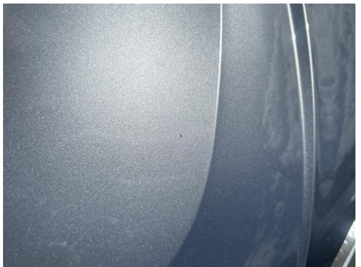
14: Bonnet Chipped 1 To 5