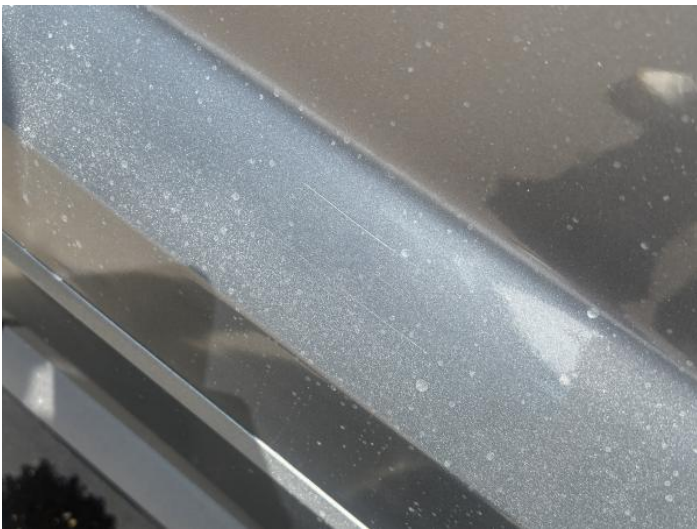
11: Door nsr Scratched Over 25mm Thru Paint