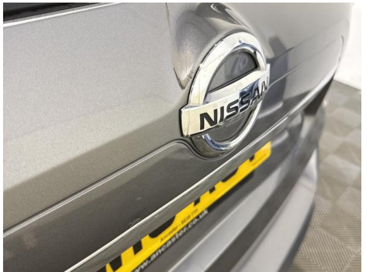
12: Tailgate Scratched Over 25mm Thru Paint