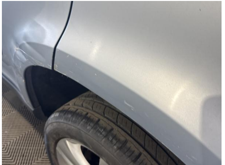
12: Qtr Panel nsr Scratched Rusted