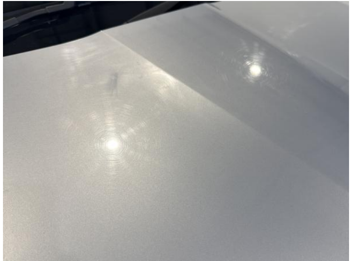
4: Bonnet Scratched Over 25mm Thru Paint