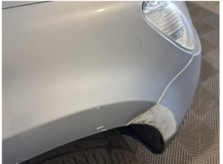
18: Wing osf Dented With Paint Damage