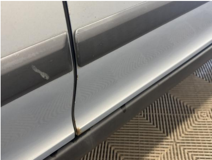
17: Door osf Rusted Over 5mm