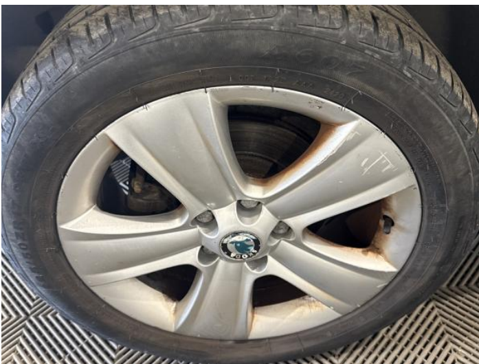
7: Wheel nsf Scratched Over 50mm