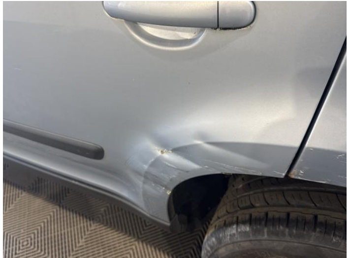
10: Door nsr Dented With Paint Damage