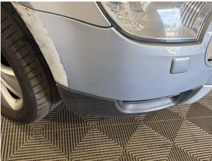
5: Bumper Front Dented With Paint Damage