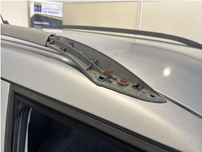
3: Other N/A N/A