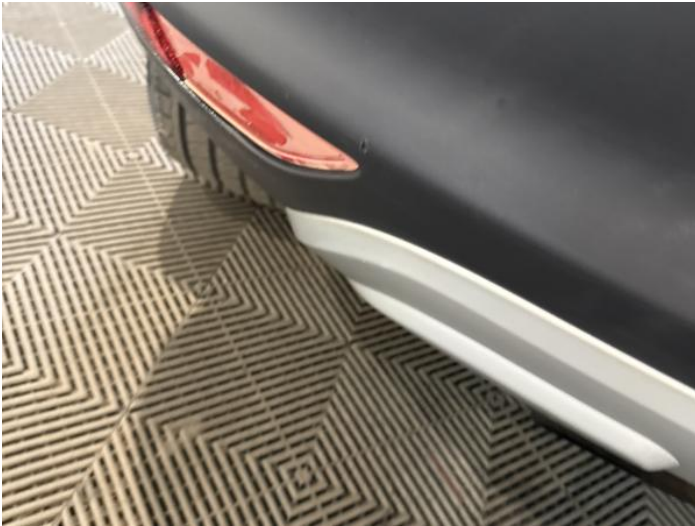
21: Bumper Reflector nsr Broken Replace