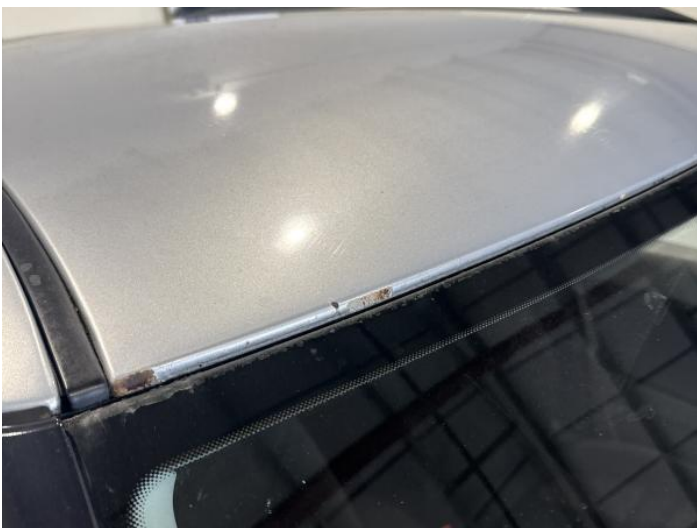
19: Roof Rusted Over 5mm