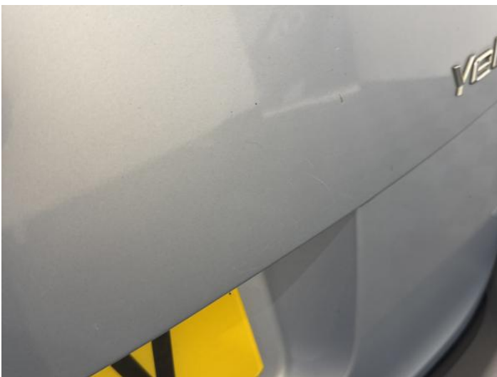
13: Tailgate Scratched Up To 25mm Thru Paint