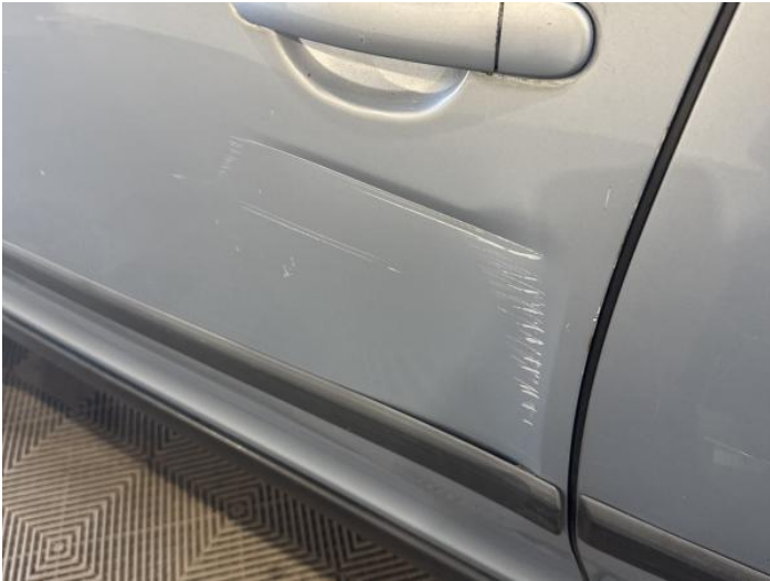
9: Door nsf Dented With Paint Damage