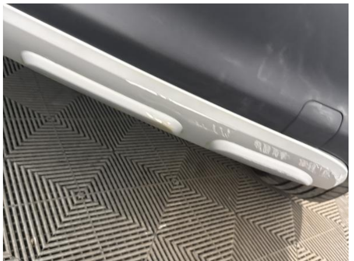
20: Bumper Rear Moulding Scratched (Painted) Over 25mm Thru Paint