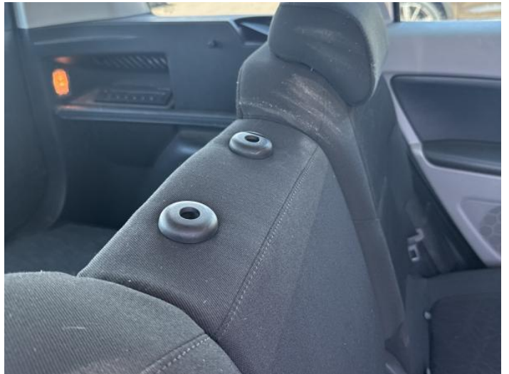
2: Headrest Assy Rear Seat Centr Missing Replace