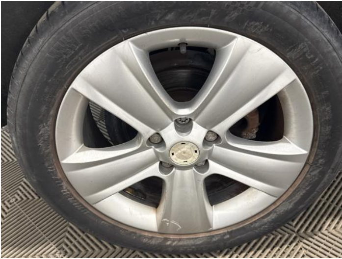
15: Wheel osr Scratched Over 50mm