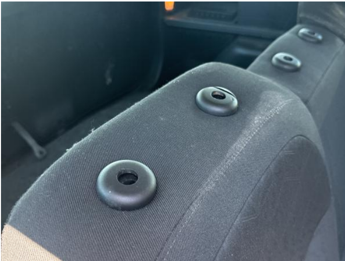
1: Headrest Assy Rear Seat os Missing Replace