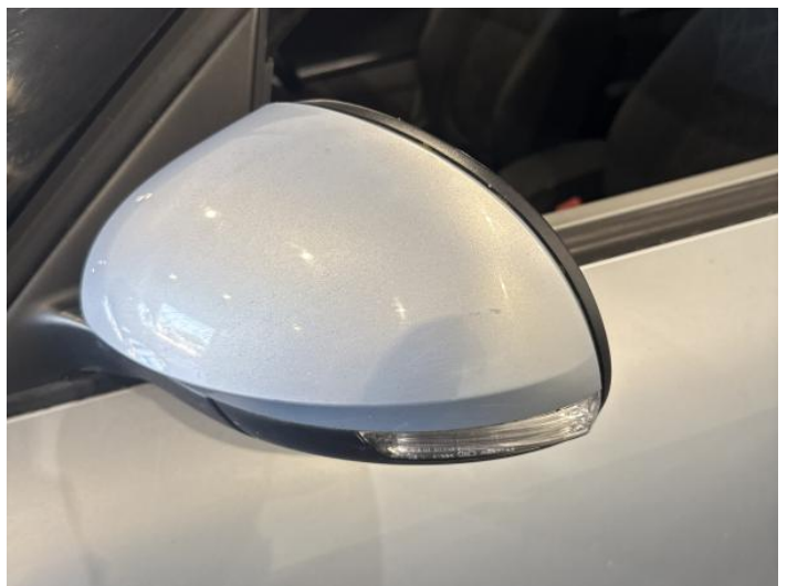
8: Door Mirror Assy nsf Scratched (Painted) UpTo 25mm Thru Paint