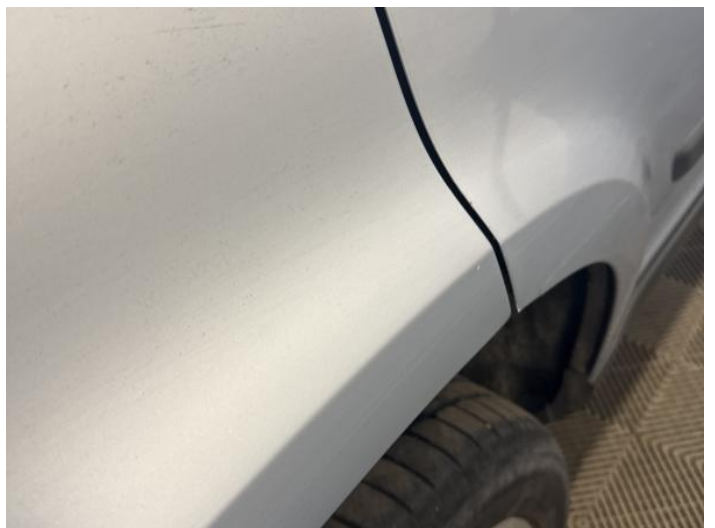
14: Qtr Panel osr Chipped 1 To 5