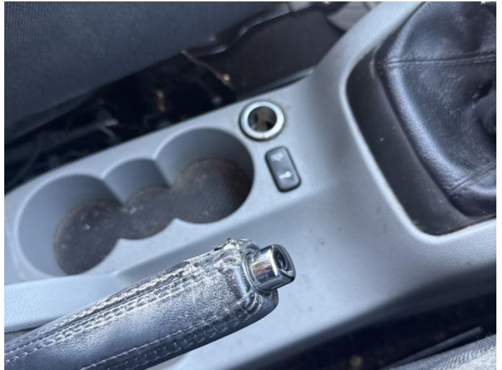
22: Switches And Controls Broken Replace