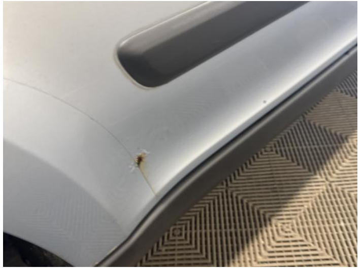
16: Door osr Rusted Over 5mm