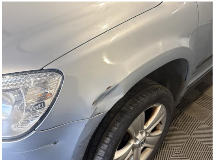
6: Wing nsf Dented With Paint Damage