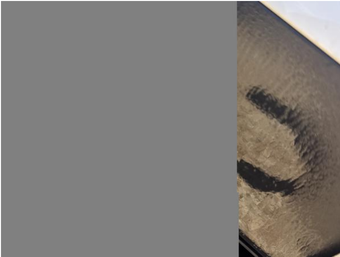
27: Bumper Front Grill Broken Replace