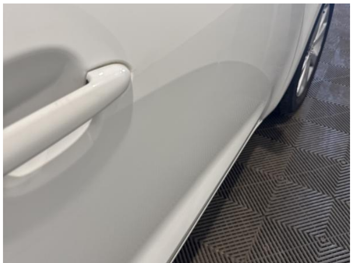
20: Door osf Dented Between 10mm + 30mm