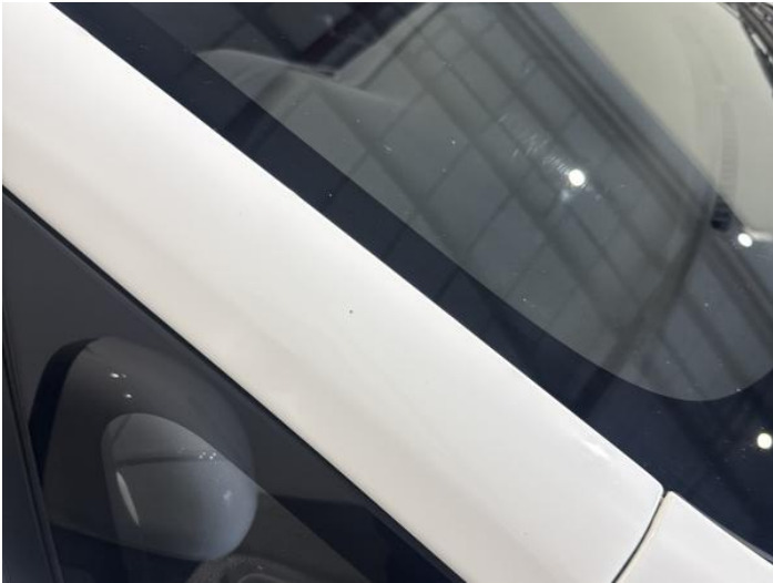
21: A Post osf Chipped 1 To 5