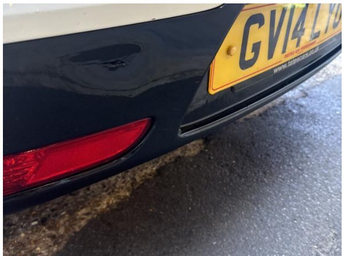
26: Bumper Rear Moulding Scuffed (Unpainted) Over 100mm