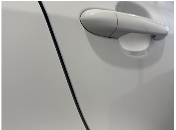
18: Door osr Chipped Edge Chip