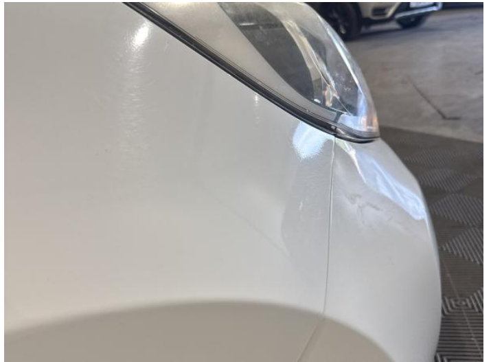
24: Wing osf Chipped Multiple Chips