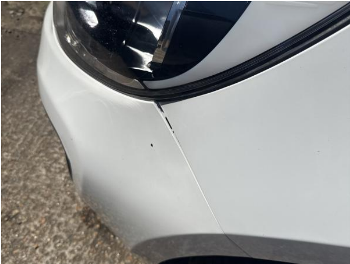
3: Bumper Front Insecure Action Required