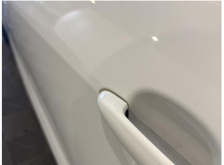
16: Door nsr Dented Between 10mm + 30mm