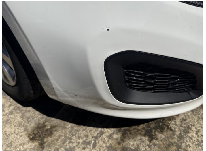
2: Bumper Front Dented With Paint Damage