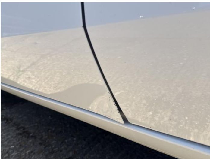
7: Door nsf Dented With Paint Damage