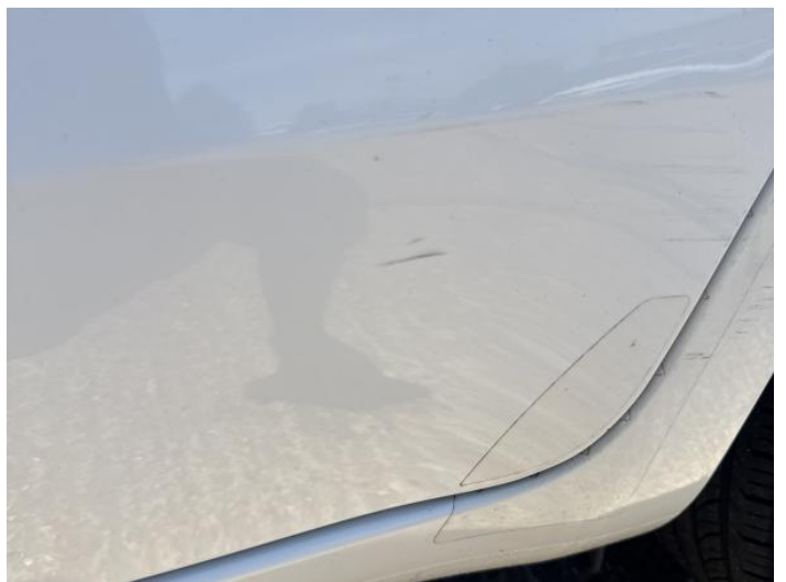
8: Door nsr Scratched Over 25mm Thru Paint