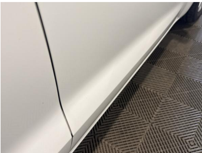
19: Door osf Chipped Edge Chip