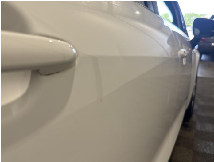
17: Door osf Dented Over 30mm