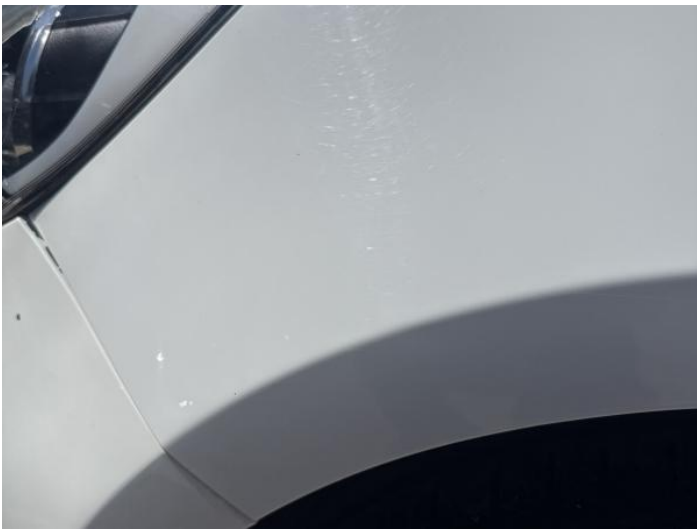
5: Wing nsf Chipped 1 To 5