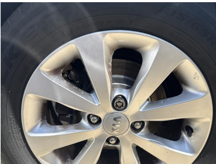
13: Wheel osr Corroded Light