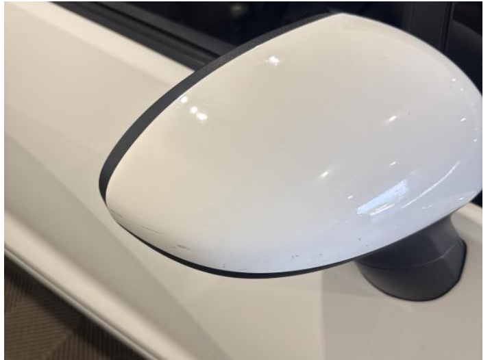
22: Door Mirror Assy osf Scratched (Painted) Over 25mm Thru Paint