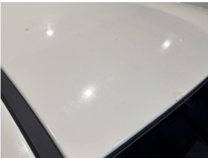
25: Roof Rusted Over 5mm