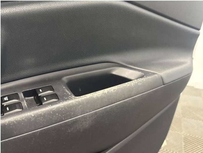
15: Door Pad osf Scuffed Over 25mm