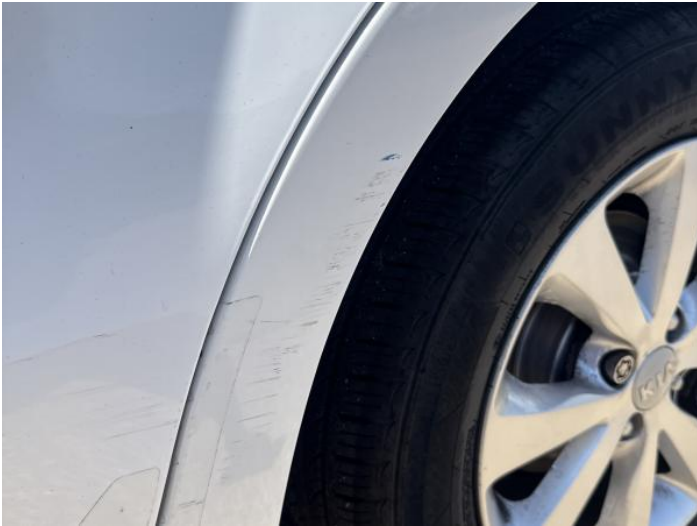
9: Qtr Panel nsr Scratched Over 25mm Thru Paint