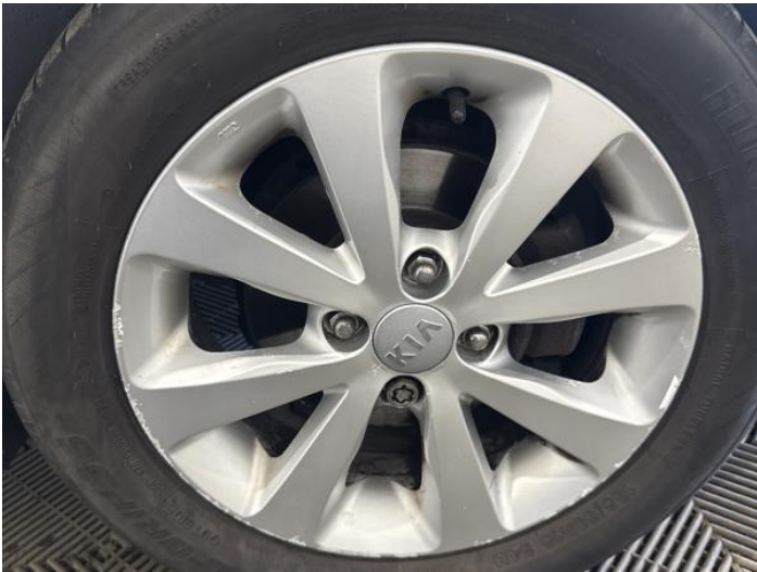
23: Wheel osf Scratched Over 50mm