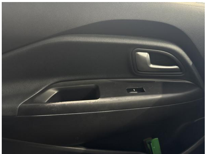
14: Door Pad nsf Scuffed Over 25mm