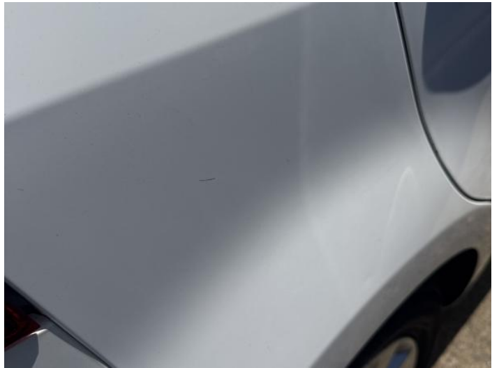
12: Qtr Panel osr Scratched UpTo 25mm Thru Paint