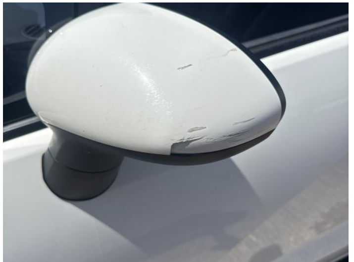
6: Door Mirror Assy nsf Broken Replace