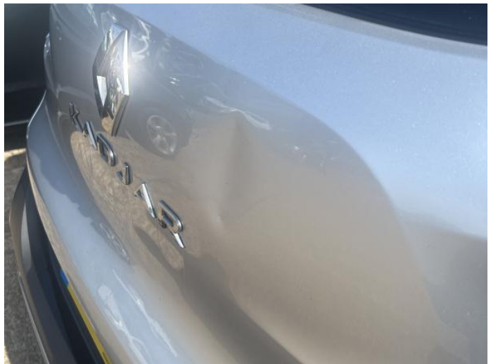
2: Tailgate Dented Over 30mm