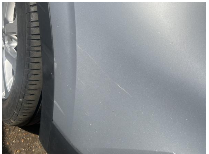
8: Bumper Front Scratched Over 100mm Thru Paint