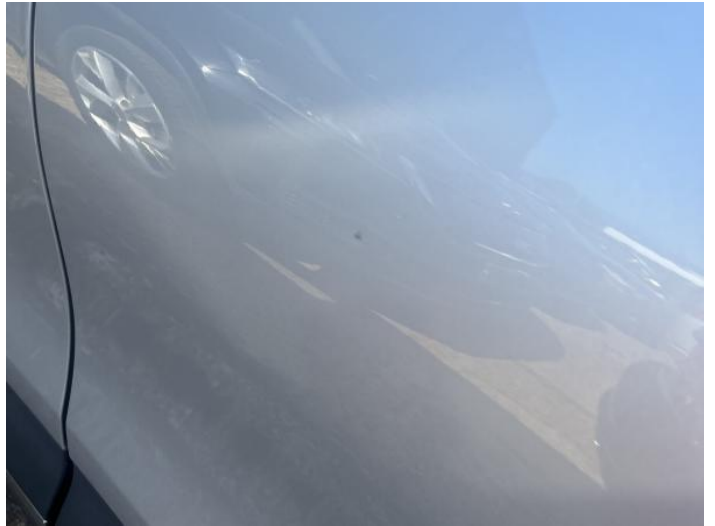
4: Door nsr Chipped 1 To 5