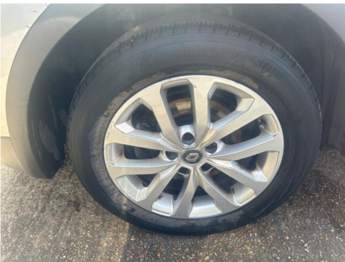
7: Wheel nsf Scratched Over 50mm