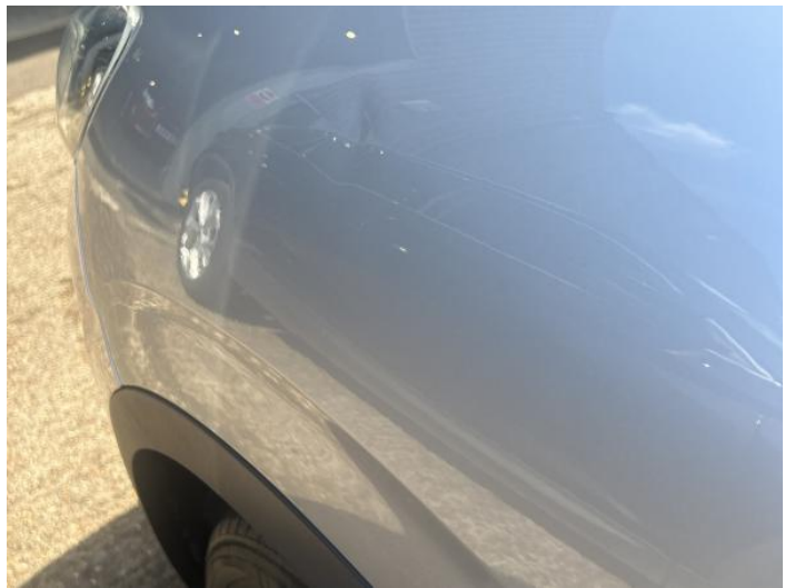
6: Wing nsf Dented Between 10mm + 30mm