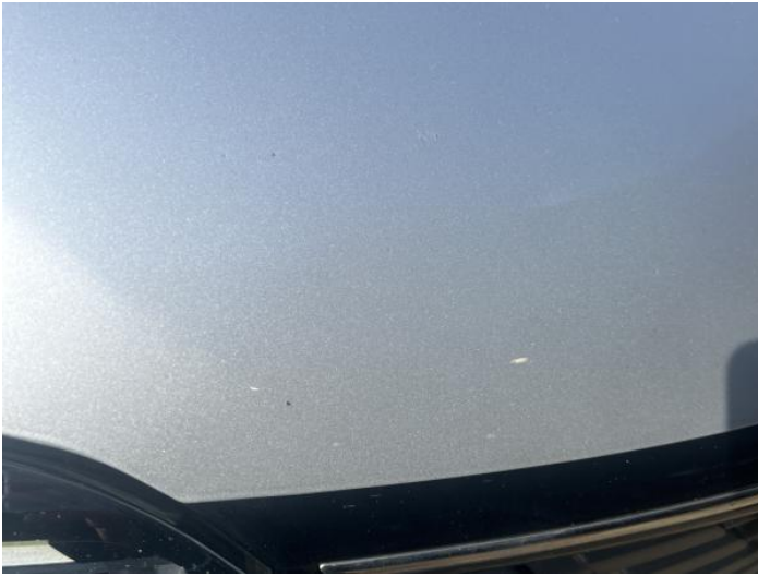
9: Bonnet Chipped 1 To 5