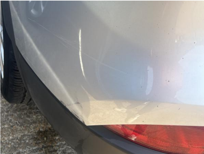
3: Bumper Rear Scratched 25 to 100mm Thru Paint