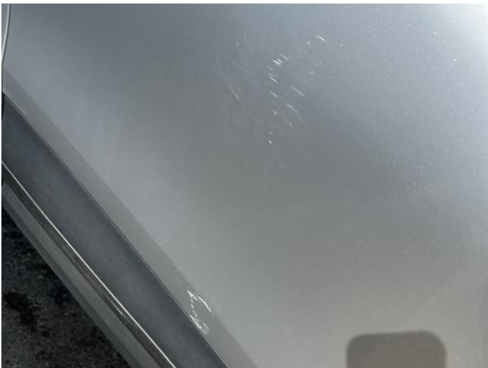
1: Door osf Scratched Over 25mm Thru Paint