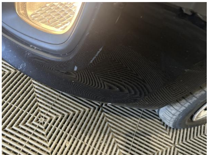
8: Bumper Front Scratched Over 100mm Thru Paint