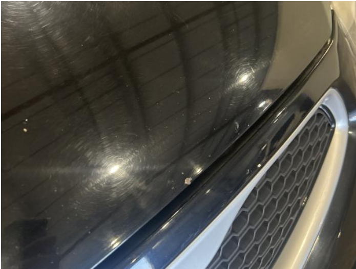
9: Bonnet Chipped 1 To 5