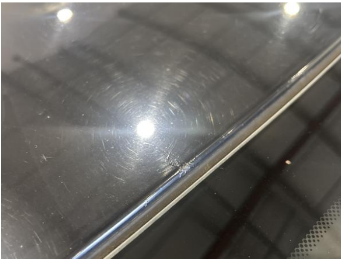
11: Roof Rusted UpTo 5mm