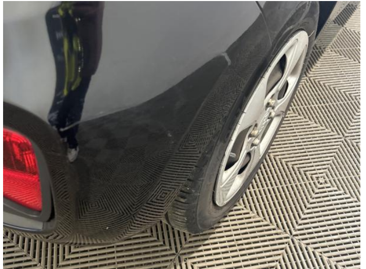
4: Bumper Rear Scratched Over 100mm Thru Paint