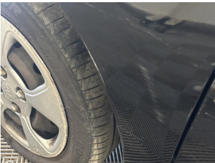
7: Wing nsf Scratched Over 25mm Thru Paint