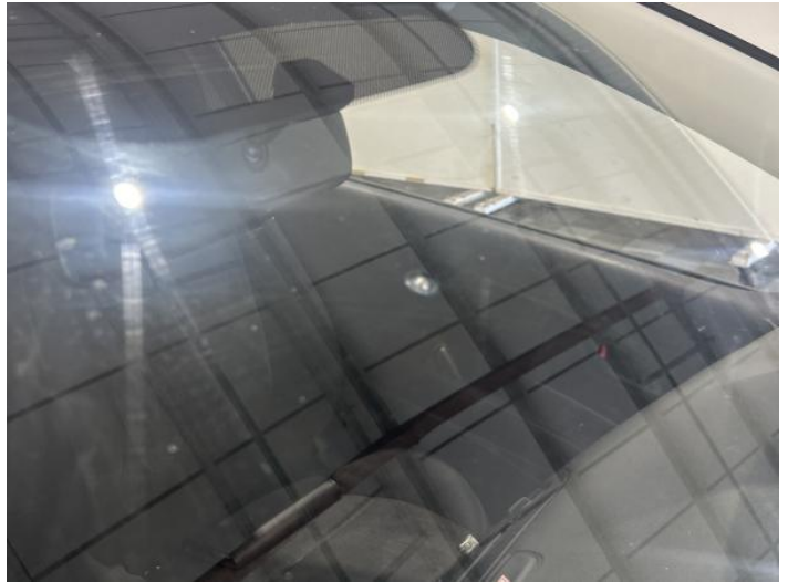
10: Screen Front Chipped Over 10mm