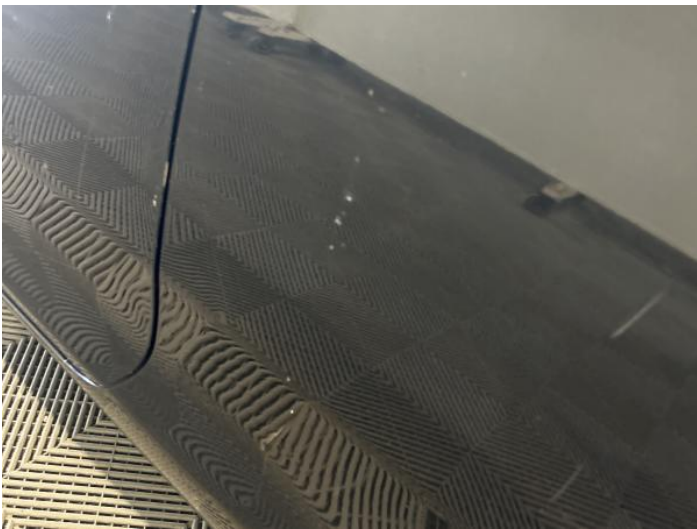
5: Qtr Panel nsr Chipped Multiple Chips