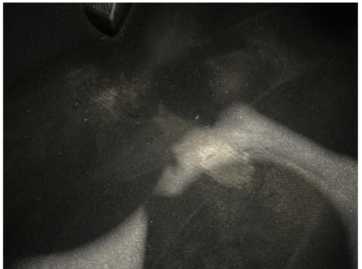
12: Carpets Front Scuffed Over 25mm