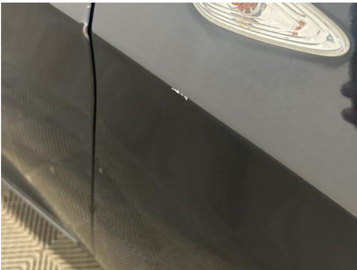
1: Wing osf Scratched UpTo 25mm Thru Paint