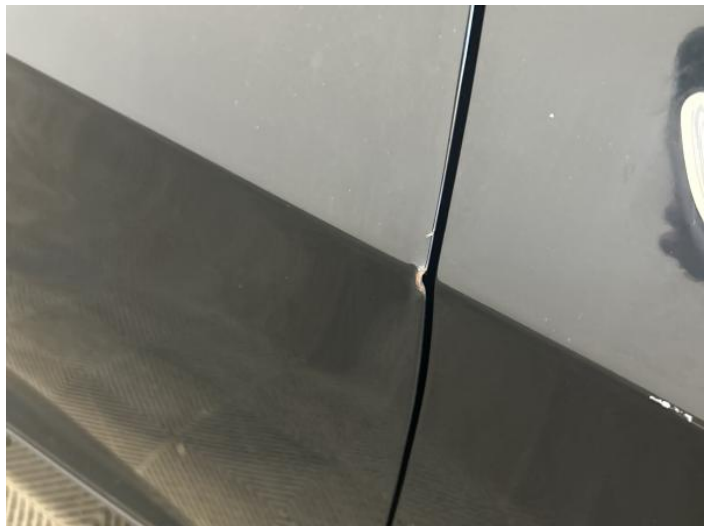
2: Door osf Dented With Paint Damage