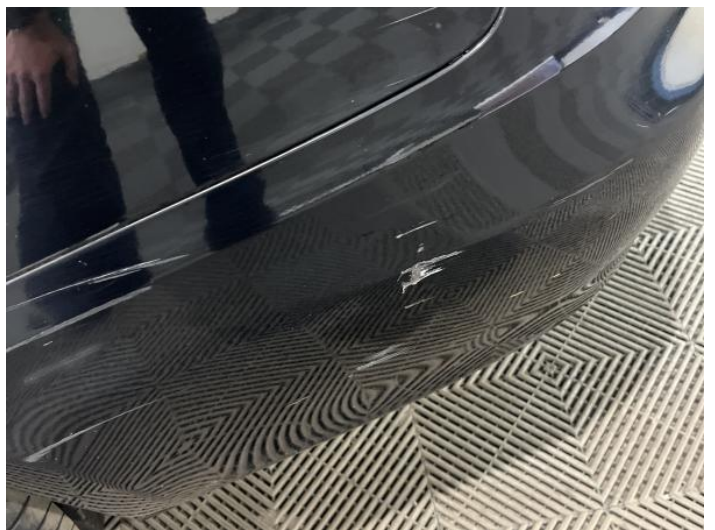
14: Bumper Rear Scratched Over 100mm Thru Paint