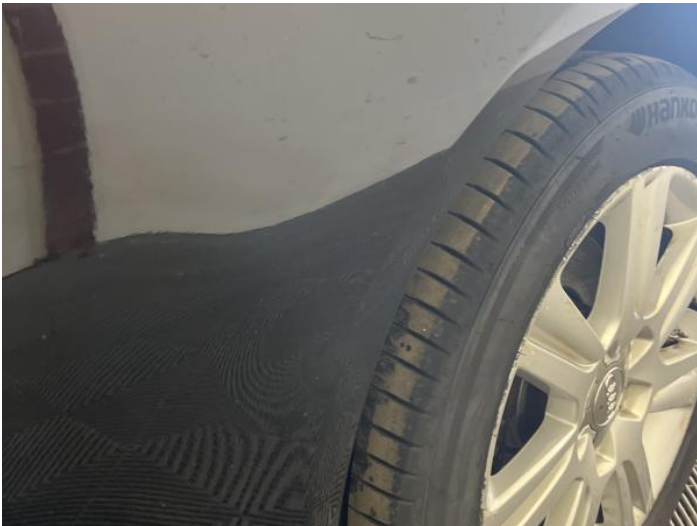
1: Wing of Dented Over 30mm