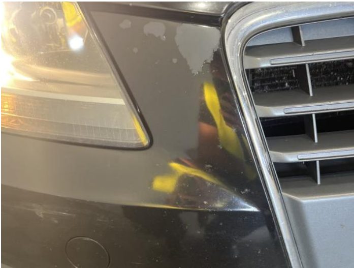
5: Bumper Front Poor Previous Repair Paint Flake