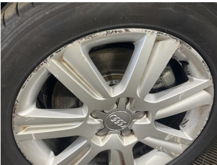
7: Wheel nsf Scratched Over 50mm