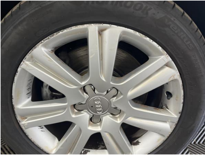
3: Wheel osf Scratched Over 50mm