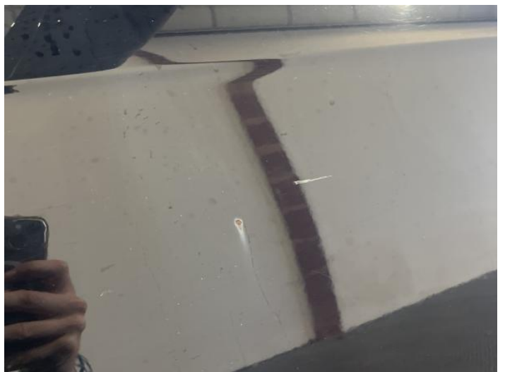
20: Door osf Rusted UpTo 5mm