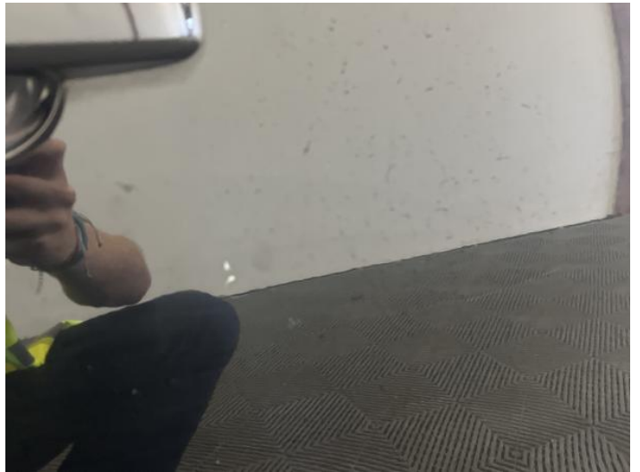
18: Door osr Scratched Over 25mm Thru Paint