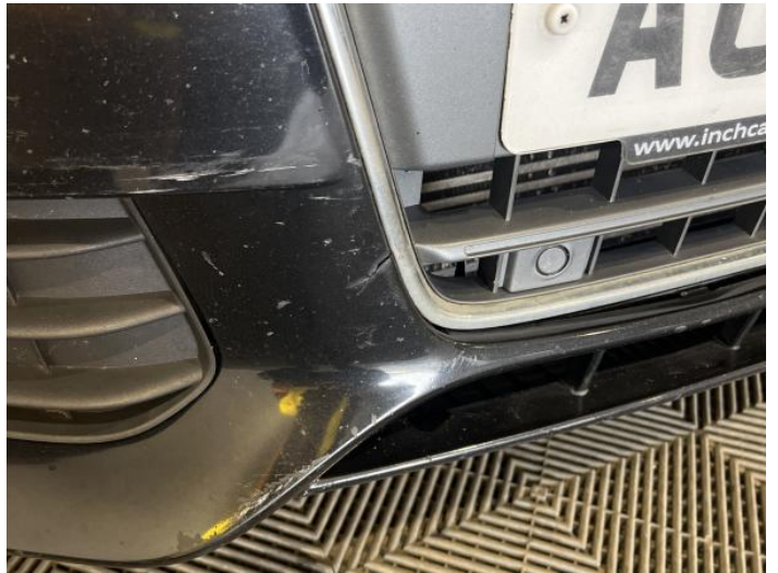
6: Bumper Front Cracked UpTo 25mm