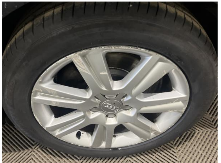
12: Wheel nsr Scratched Over 50mm