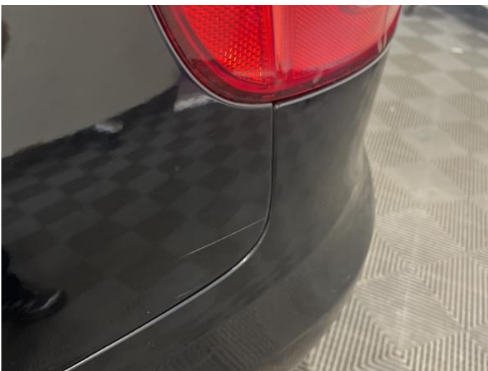
13: Qtr Panel nsr Scratched Over 25mm Thru Paint