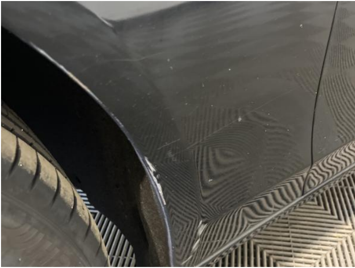
9: Wing nsf Scratched Over 25mm Thru Paint