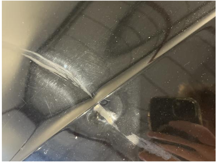
4: Bonnet Dented With Paint Damage