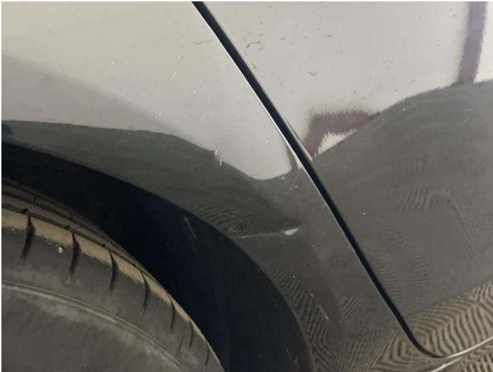
15: Qtr Panel osr Dented With Paint Damage