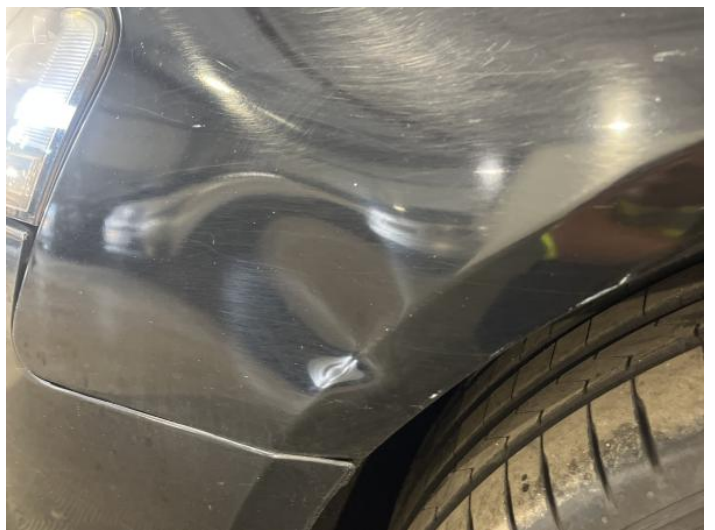
8: Wing nsf Dented Over 30mm