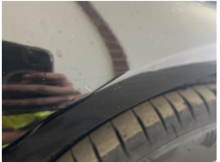
2: Wing of Scratched Over 25mm Thru Paint