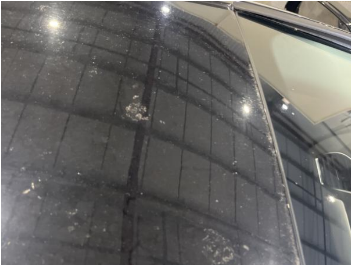
21: Roof Scratched Over 25mm Thru Paint