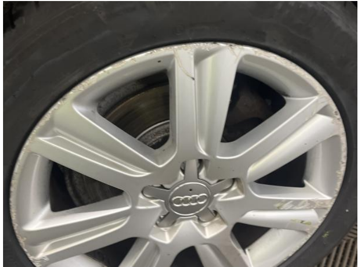
16: Wheel osr Scratched Over 50mm