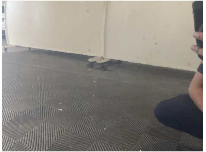
10: Door nsr Rusted Over 5mm