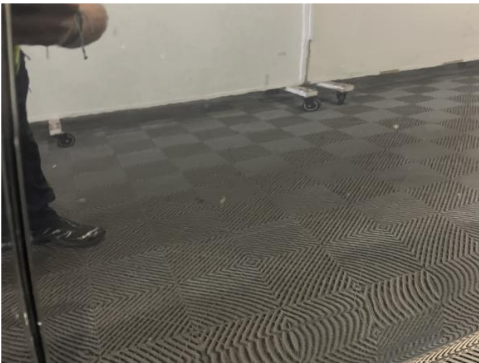
11: Door nsr Scratched Over 25mm Thru Paint