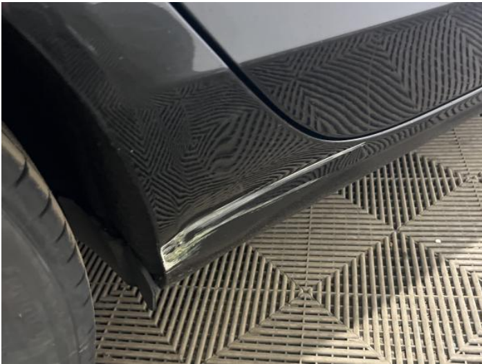
17: Sill os Dented With Paint Damage