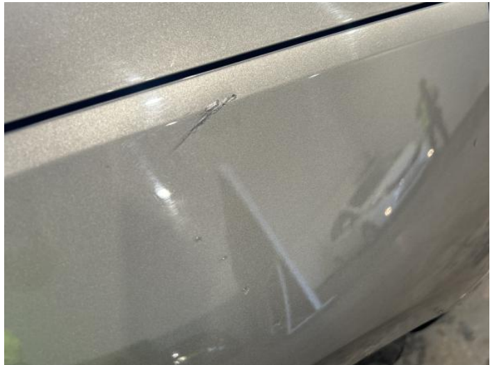
2: Wing osf Scratched Over 25mm Thru Paint