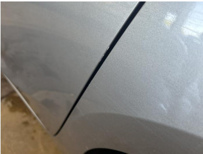
11: Door nsr Chipped Edge Chip