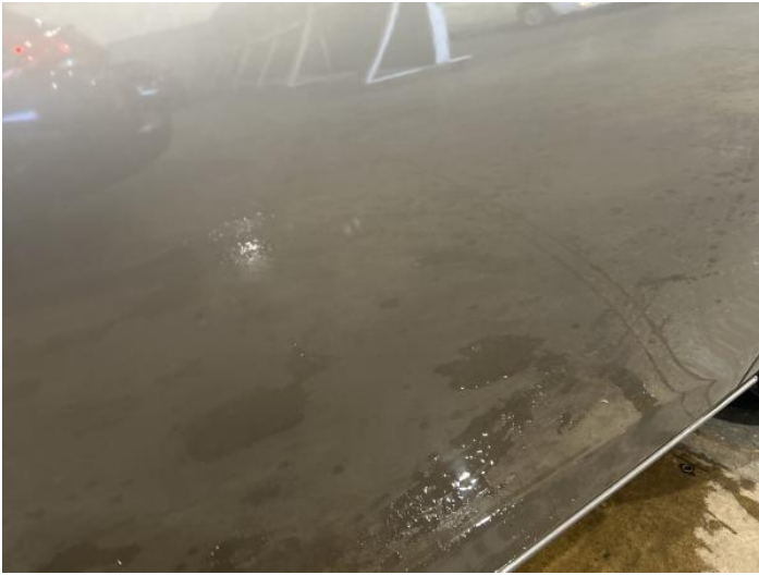
3: Door osf Chipped 1 To 5