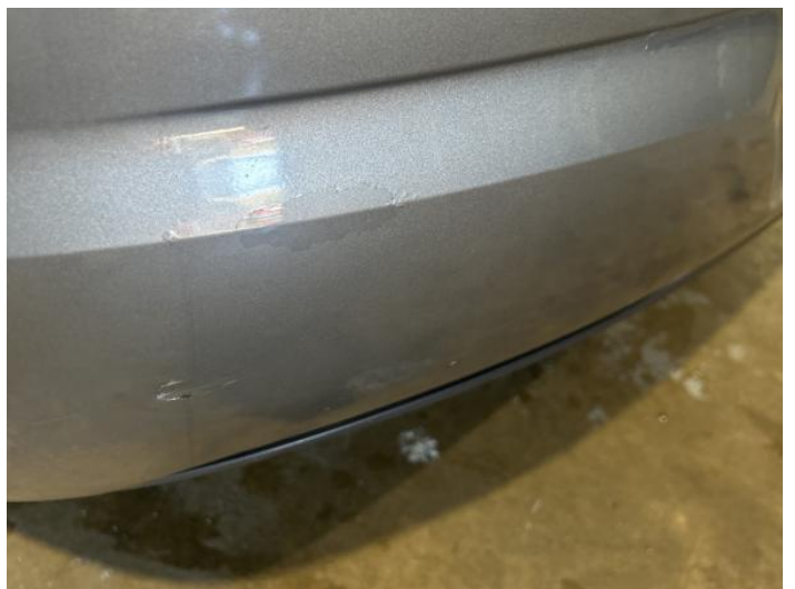
8: Bumper Rear Poor Previous Repair Paint Flake