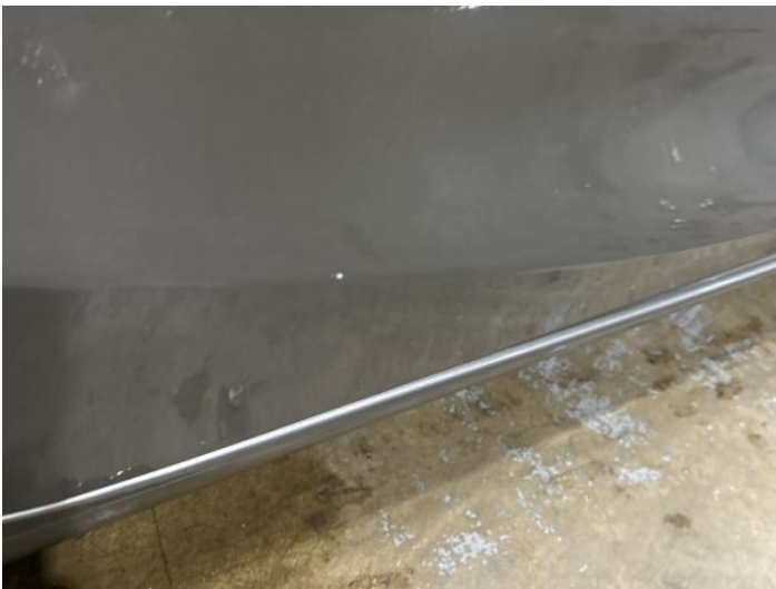
5: Door osr Chipped 1 To 5