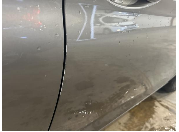
4: Door osf Chipped Edge Chip