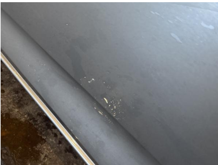
13: Door nsf Chipped 1 To 5