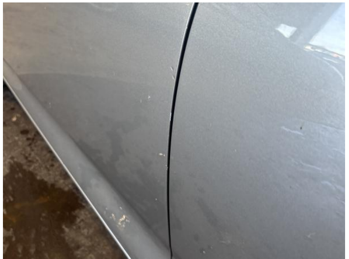
12: Door nsf Chipped Edge Chip