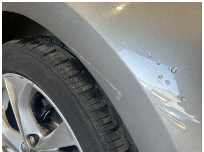
14: Wing nsf Scratched Over 25mm Thru Paint