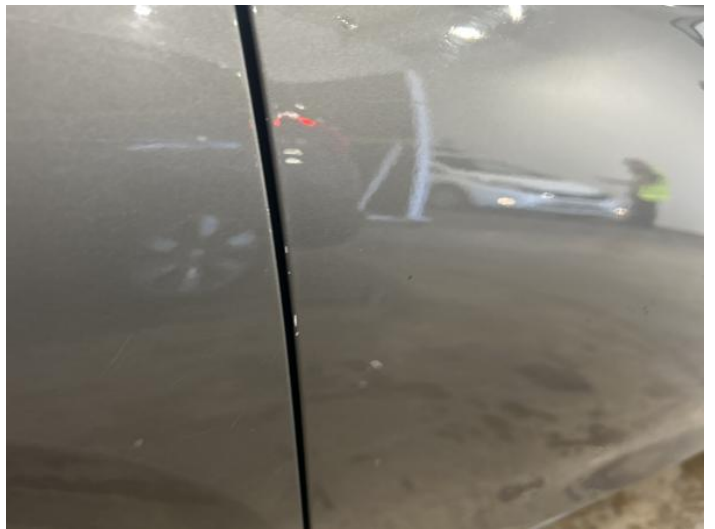
6: Door osr Chipped Edge Chip