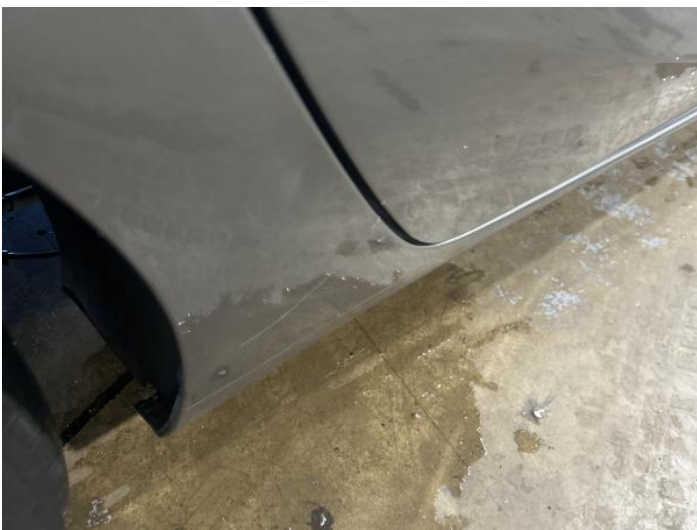
7: Qtr Panel osr Dented Between 10mm + 30mm