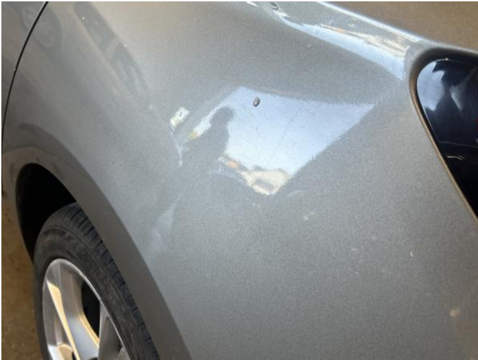
9: Qtr Panel nsr Poor Previous Repair Poor Paint