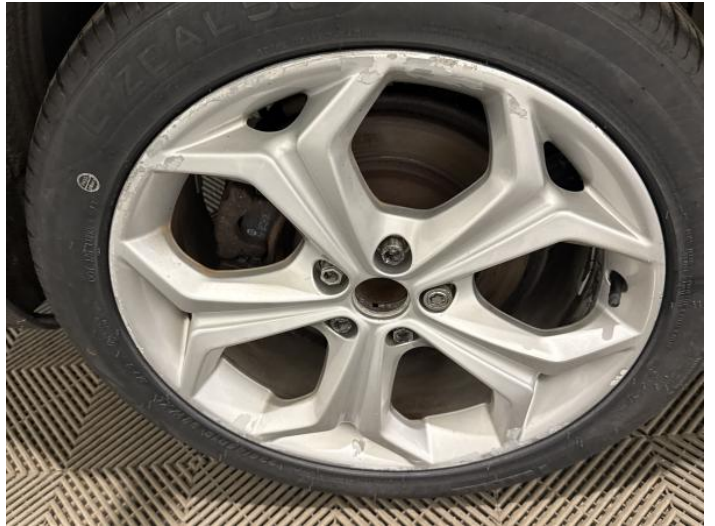
16: Wheel osr Scratched Over 50mm