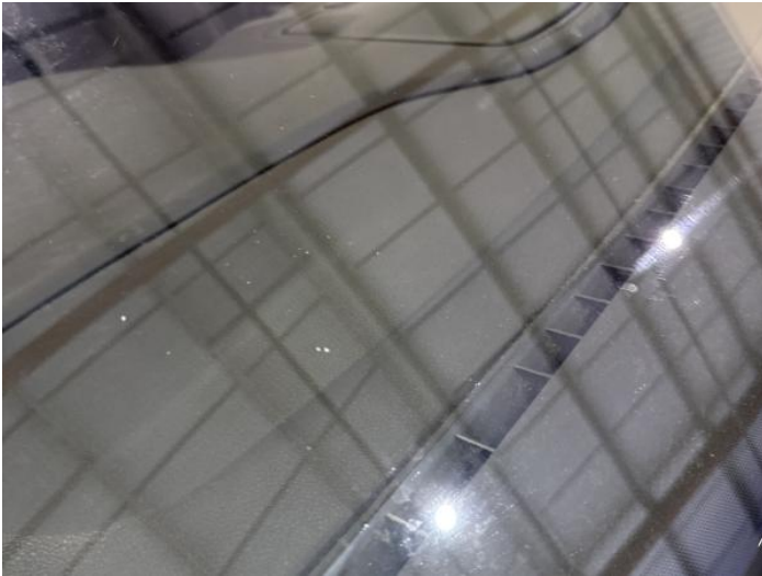
21: Screen Front Chipped UpTo 10mm