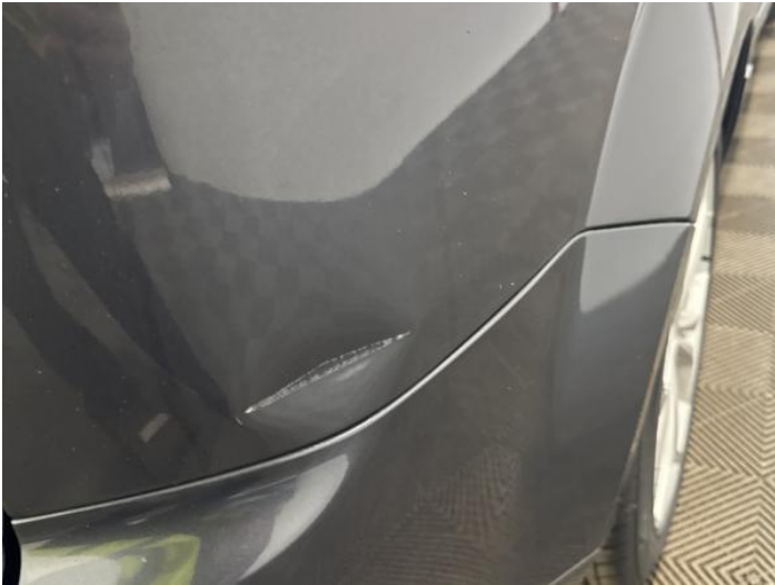
15: Qtr Panel osr Dented With Paint Damage