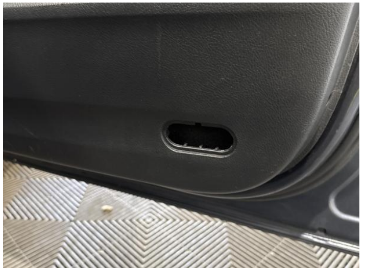
2: Fascia Trim Missing Replace