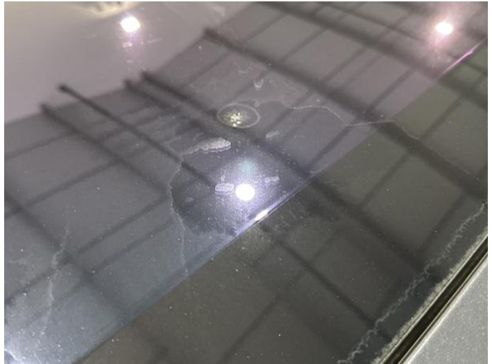
22: Glass Roof Cracked Replace