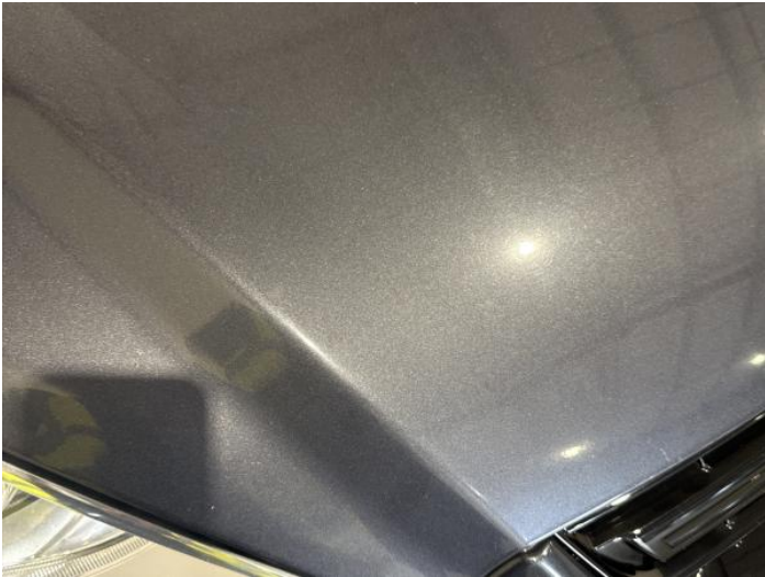
3: Bonnet Chipped 1 To 5