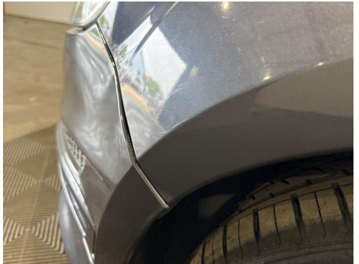
6: Wing nsf Scratched UpTo 25mm Thru Paint