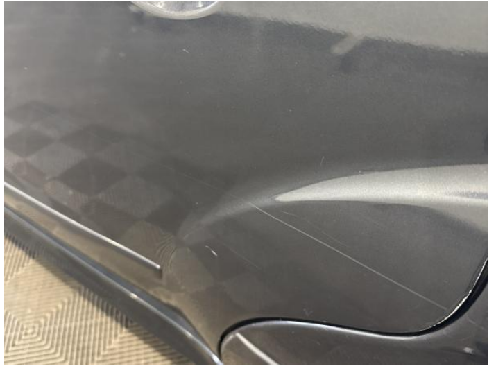
10: Door nsr Scratched Over 25mm Thru Paint