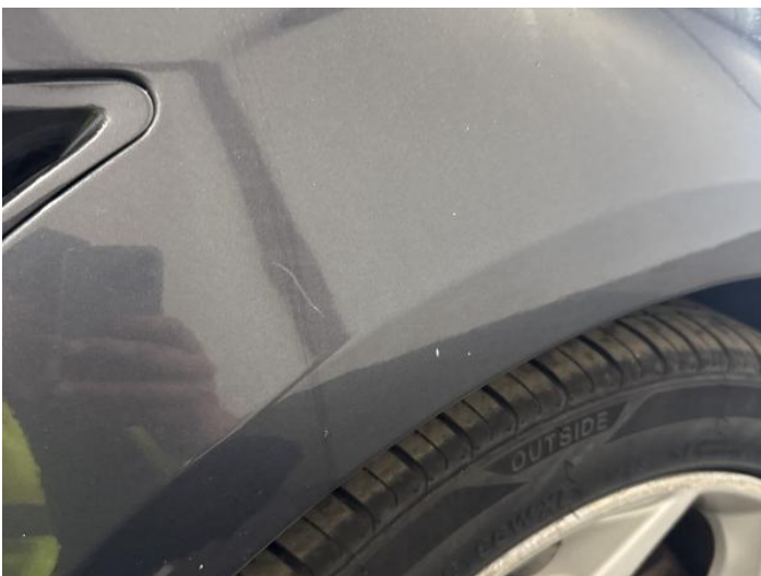
19: Wing osf Scratched Up To 25mm Thru Paint