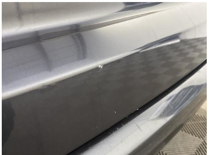
14: Tailgate Scratched UpTo 25mm Thru Paint