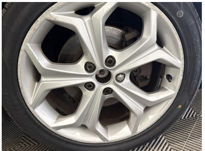
20: Wheel osf Scratched Over 50mm