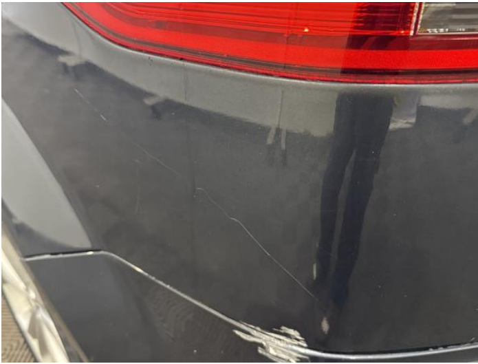
11: Qtr Panel nsr Dented With Paint Damage