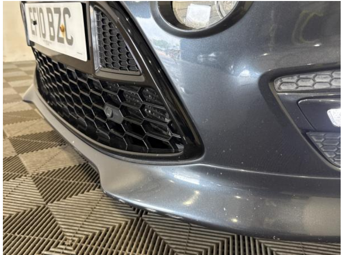
4: Bumper Front Poor Previous Repair Poor Paint