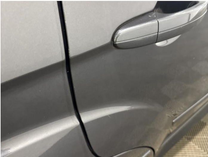
17: Door osr Chipped Edge Chip