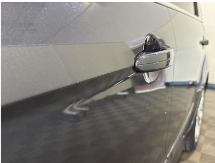
7: Door nsf Dented Between 10mm + 30mm