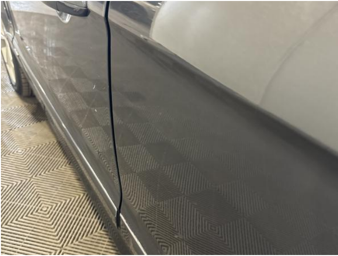
9: Door nsr Dented Between 10mm + 30mm