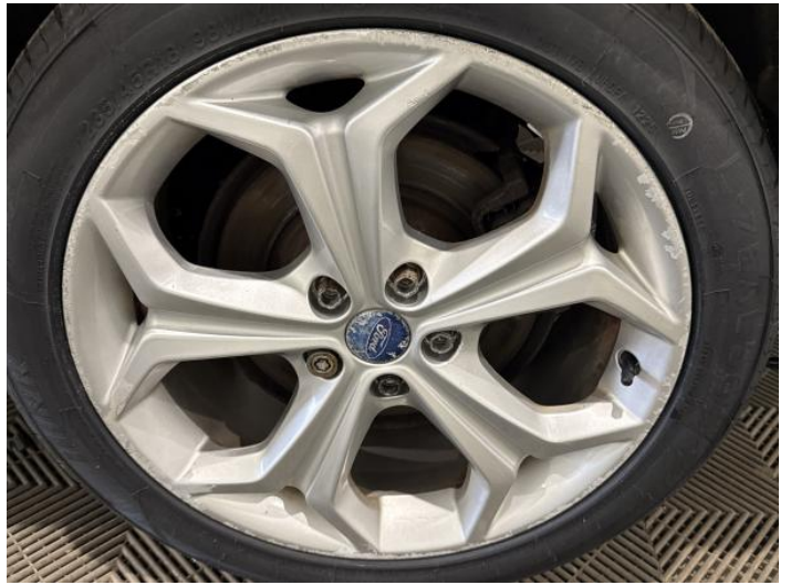
12: Wheel nsr Scratched Over 50mm