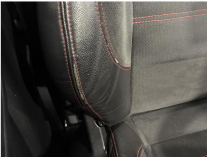
1: Seat Back Cover osf Scuffed Over 25mm