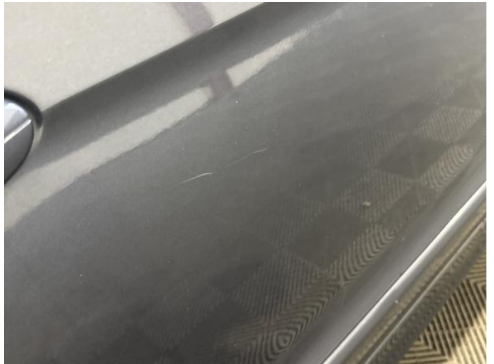
18: Door osf Scratched Over 25mm Thru Paint