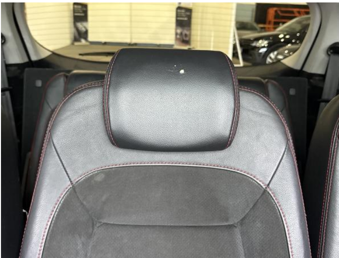
23: Other N/A N/A