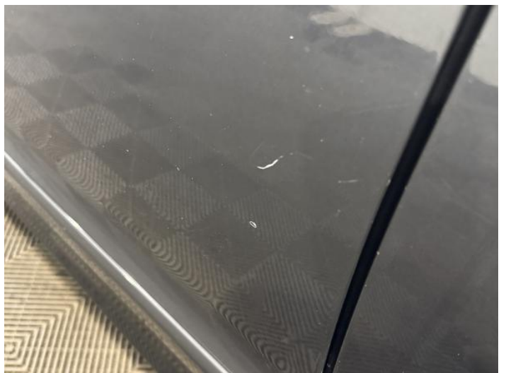
8: Door nsf Scratched UpTo 25mm Thru Paint