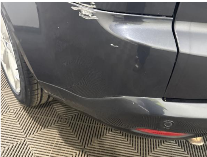
13: Bumper Rear Scratched Over 100mm Thru Paint