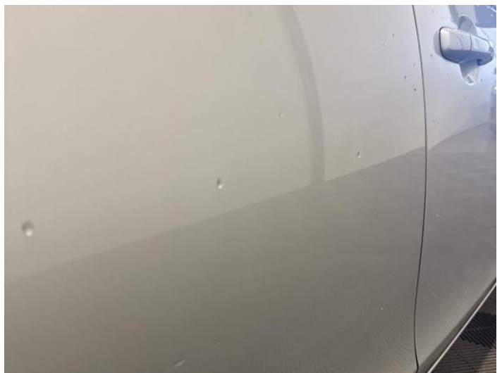
14: Door osr Scratched Over 25mm Thru Paint