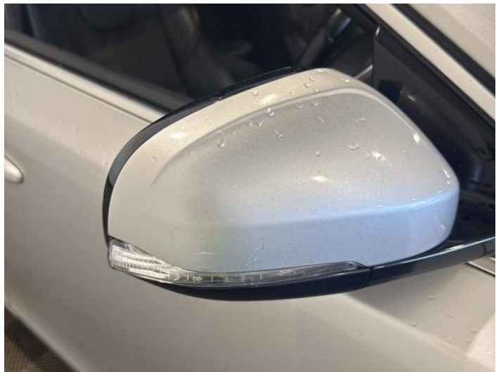
18: Door Mirror Assy osf Scratched (Painted) Over 25mm Thru Paint