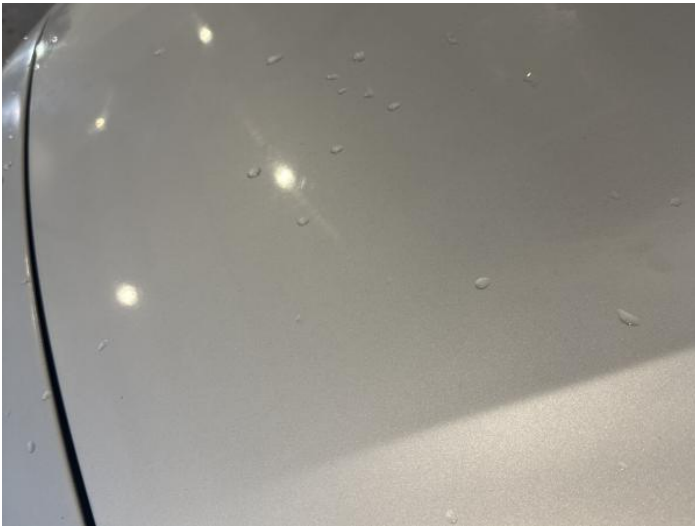
1: Bonnet Poor Previous Repair Poor Paint