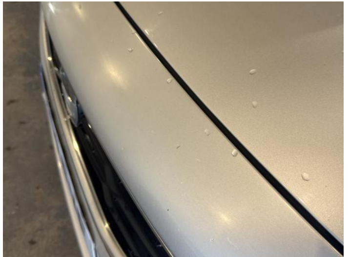
2: Bumper Front Poor Previous Repair Poor Paint