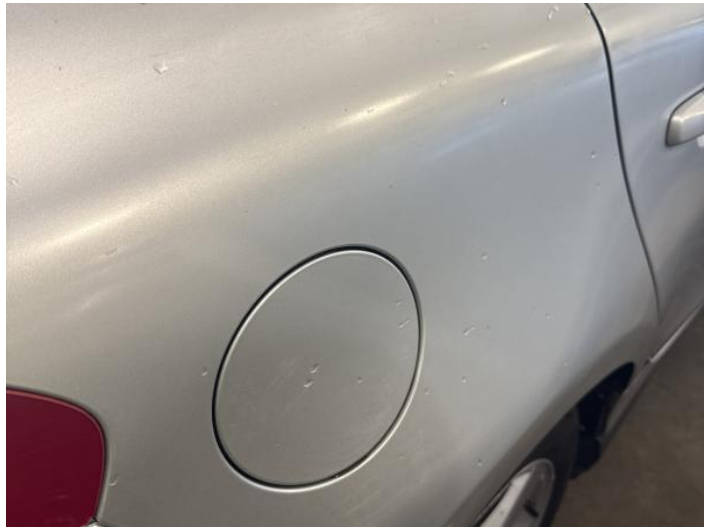
12: Qtr Panel osr Scratched Over 25mm Thru Paint