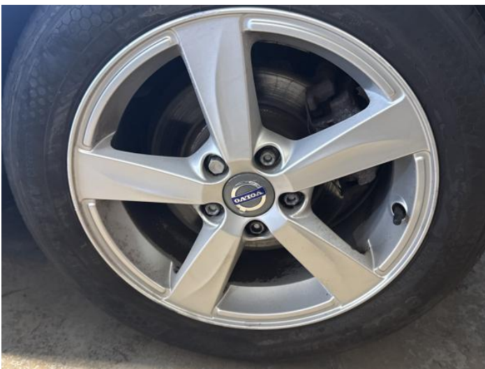
7: Wheel nsr Scratched Up To 50mm