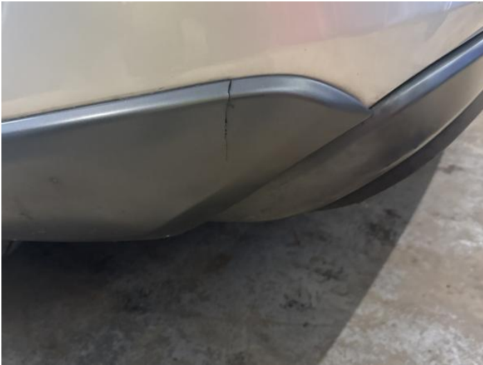
9: Bumper Rear Moulding Broken Replace