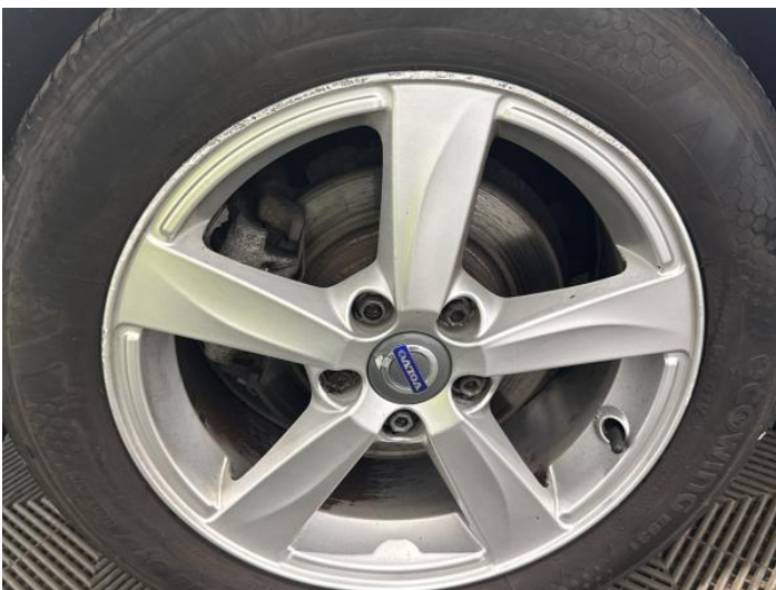
13: Wheel osr Scratched Over 50mm