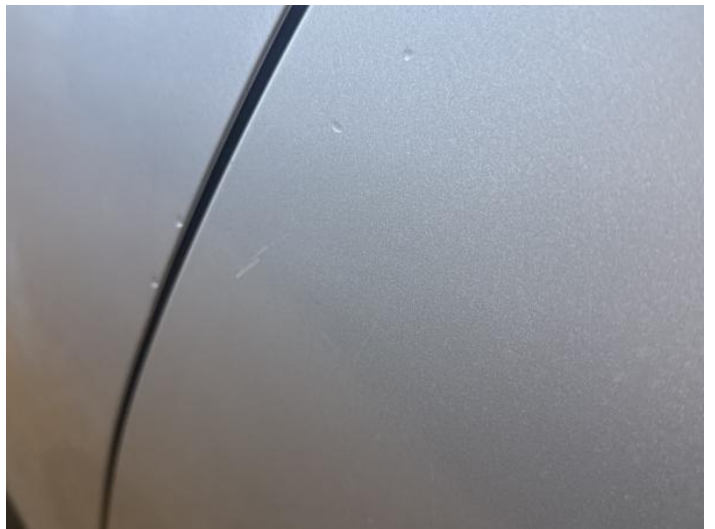
6: Door nsr Scratched UpTo 25mm Thru Paint