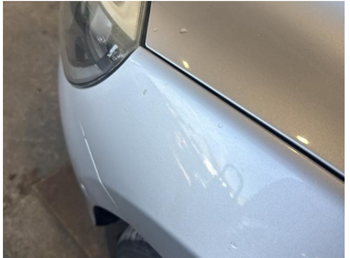
4: Wing nsf Scratched UpTo 25mm Thru Paint