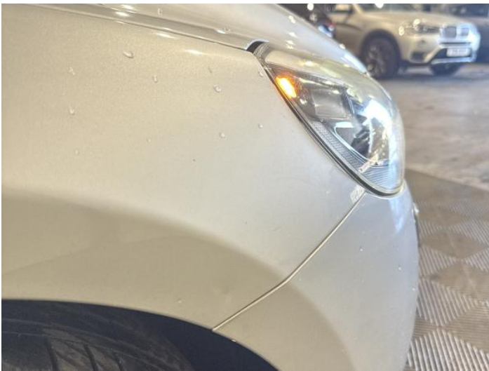
17: Wing osf Dented Between 10mm + 30mm