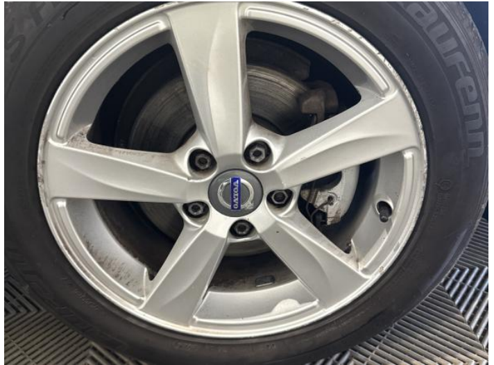
16: Wheel osf Scratched Over 50mm