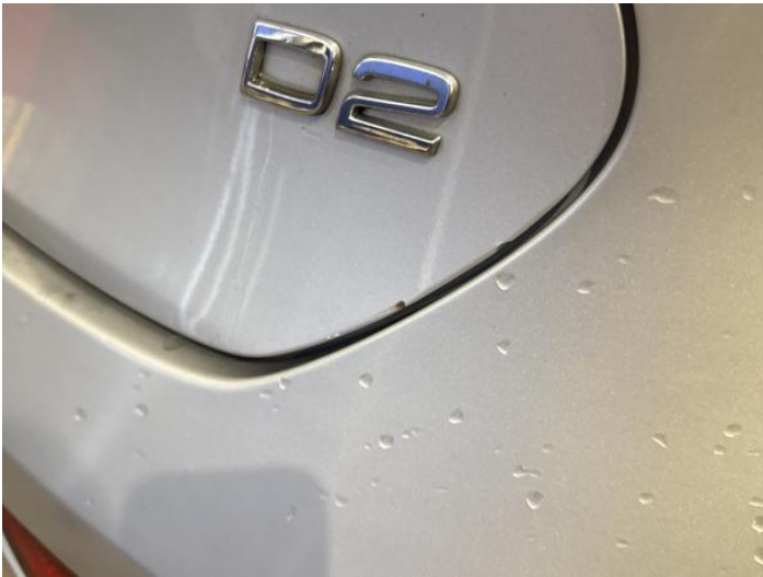
11: Tailgate Scratched Rusted