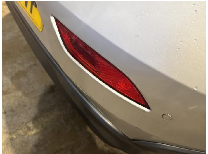
10: Bumper Rear Poor Previous Repair Poor Paint