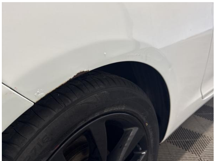
8: Qtr Panel osr Dented With Paint Damage