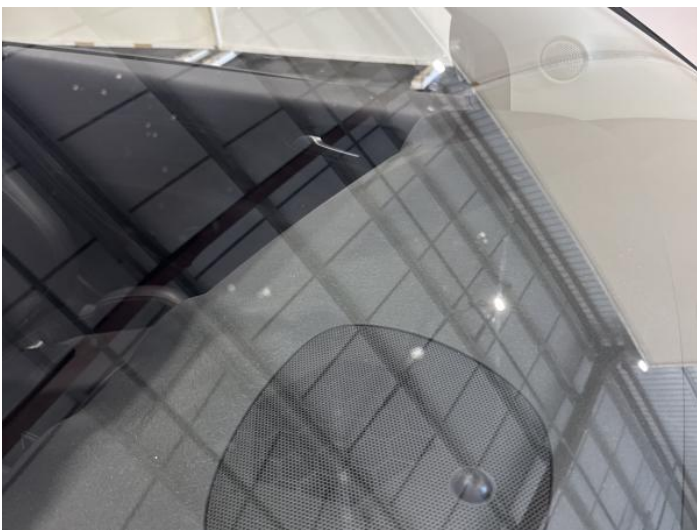
13: Screen Front Chipped UpTo 10mm