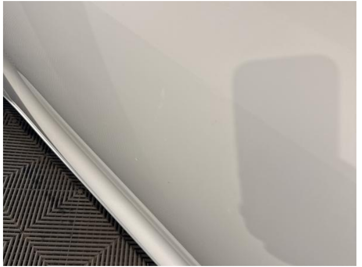
4: Door nsf Scratched UpTo 25mm Thru Paint