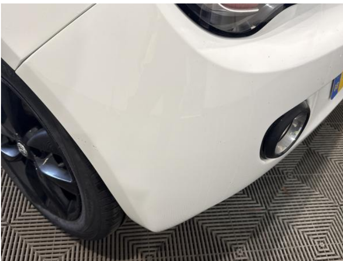
7: Bumper Rear Scratched 25 to 100mm Thru Paint