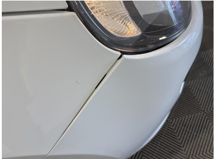
10: Bumper Front Insecure Action Required