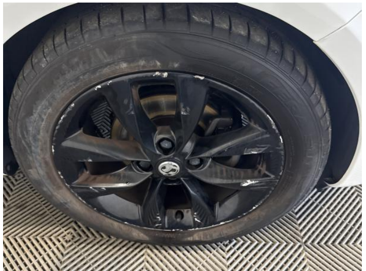
12: Wheel osf Scratched Over 50mm