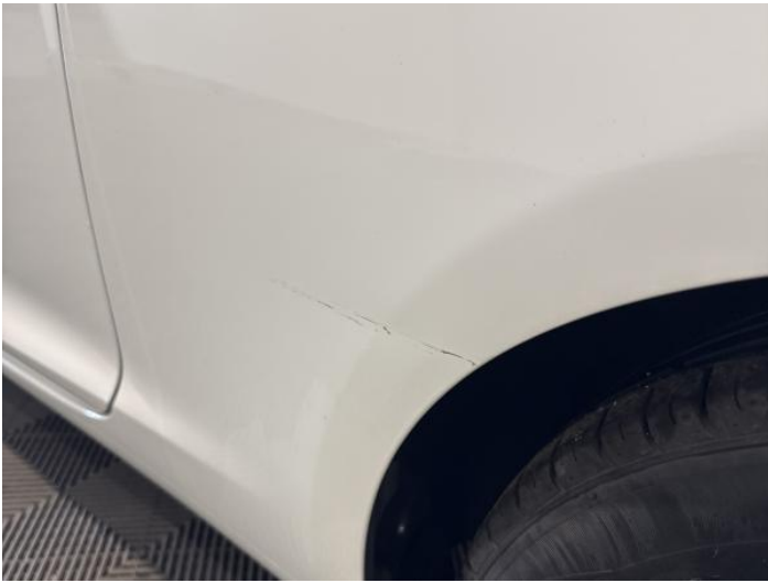
5: Qtr Panel nsr Dented With Paint Damage