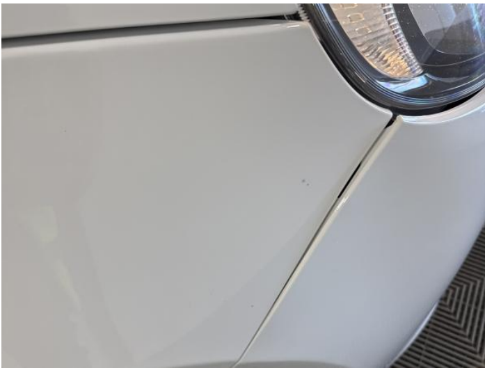
11: Wing osf Chipped 1 To 5