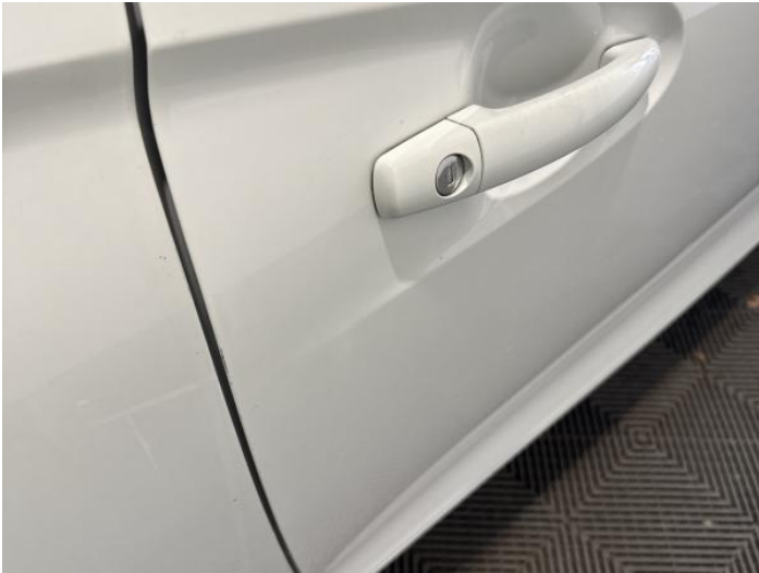
9: Door osf Chipped Edge Chip