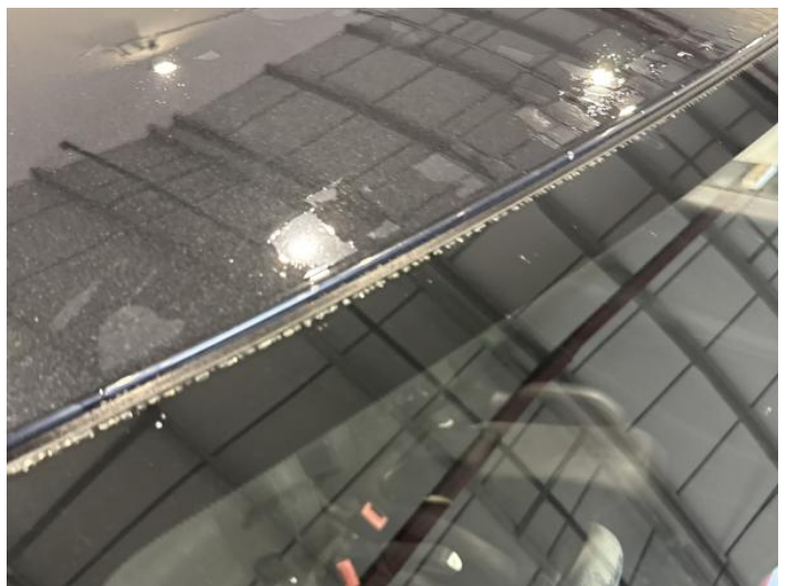
14: Roof Chipped Edge Chip