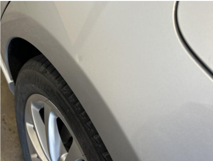
1: Qtr Panel nsr Dented 2 Or Less UpTo 10mm