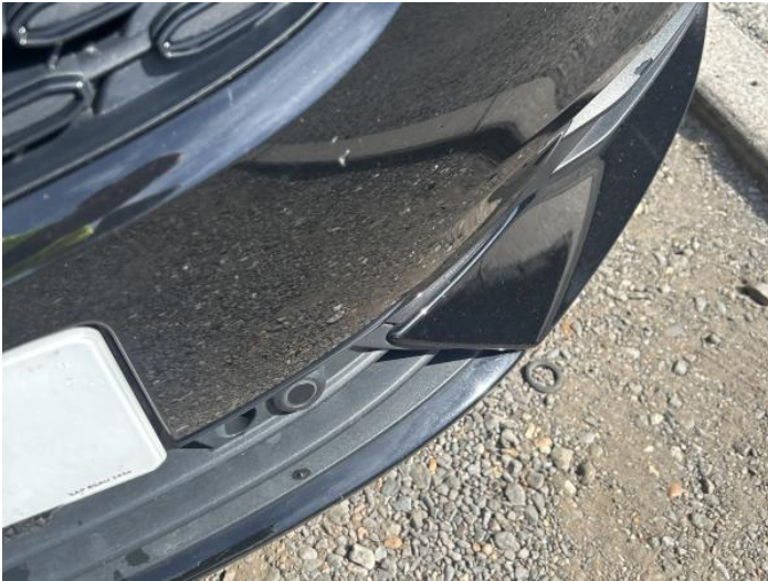
9: Bumper Front Chipped Multiple Chips