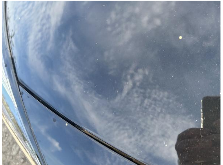
10: Bonnet Chipped 1 To 5