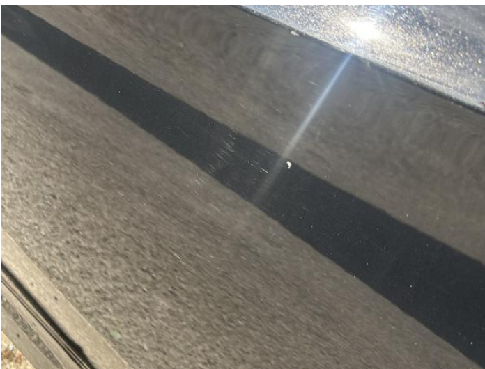
7: Door nsr Chipped 1 To 5