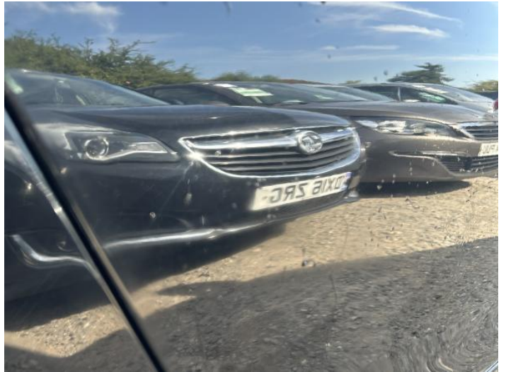
4: Door osr Poor Previous Repair Poor Paint