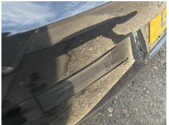
6: Bumper Rear Chipped 1 To 5