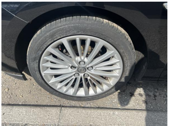
8: Wheel nsf Scratched Over 50mm