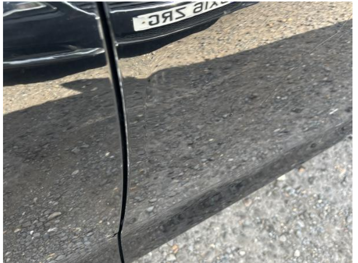
2: Door osf Dented Over 30mm