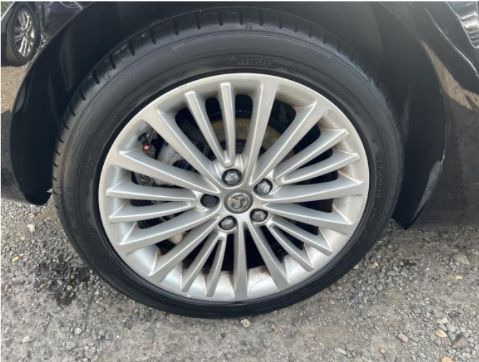
3: Wheel osr Scratched Up To 50mm