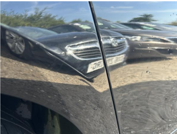
5: Qtr Panel osr Poor Previous Repair Poor Paint