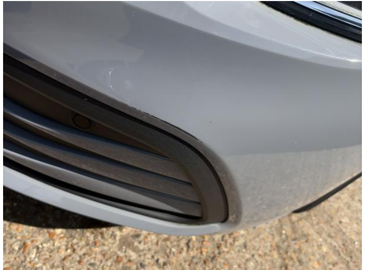
4: Bumper Front Scratched 25 to 100mm Thru Paint