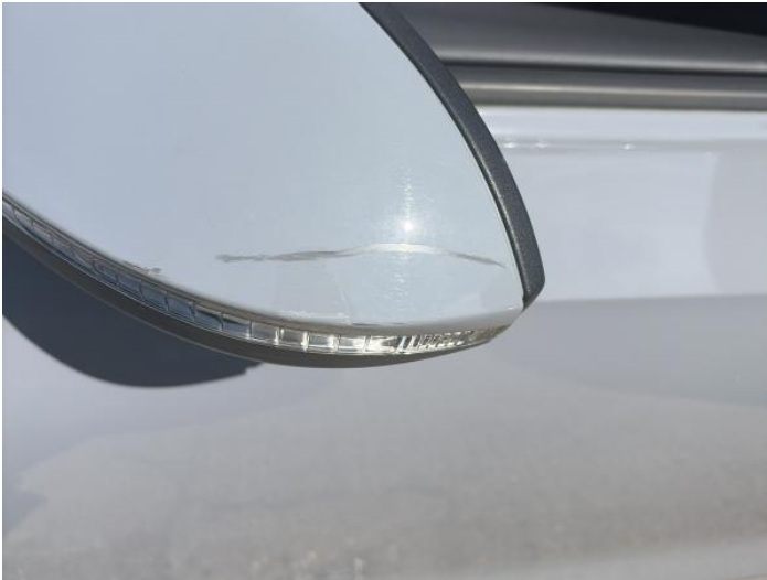
3: Door Mirror Assy nsf Scratched (Painted) Over 25mm Thru Paint