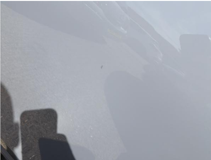
1: Door nsr Chipped 1 To 5