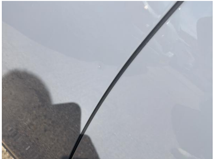
2: Door nsf Chipped 1 To 5