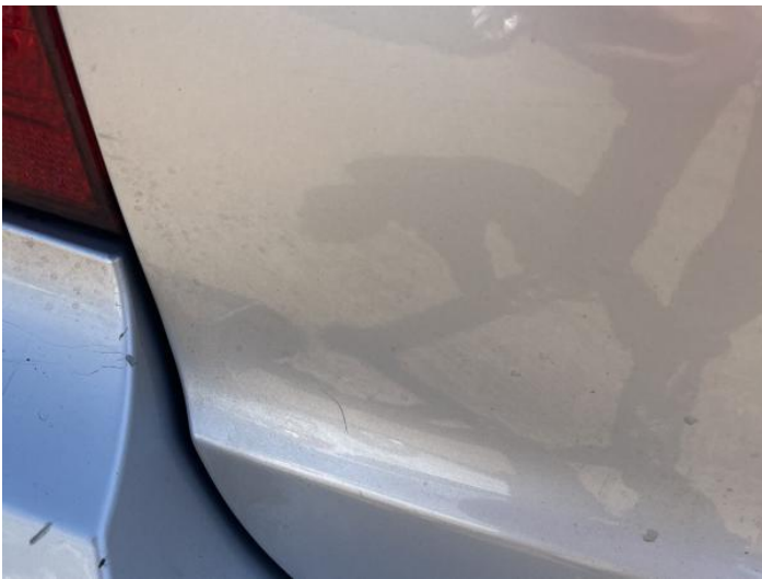
11: Tailgate Scratched Over 25mm Thru Paint