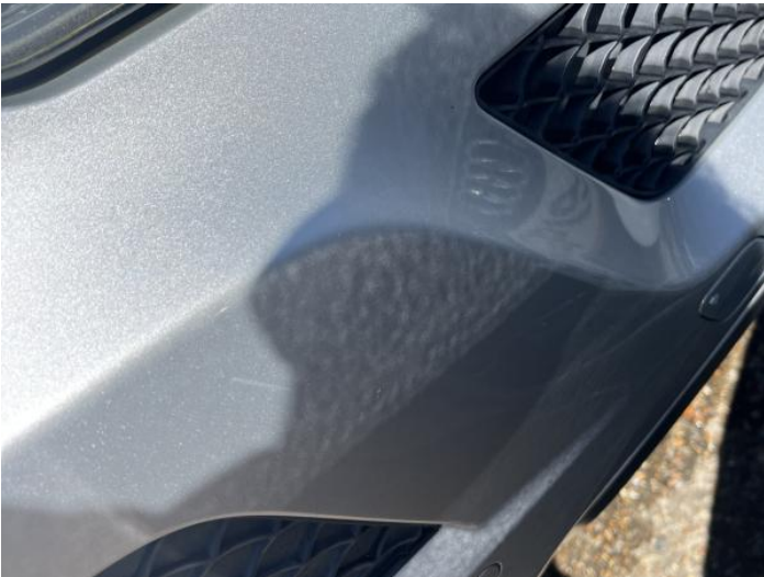
1: Bumper Front Scratched Over 100mm Thru Paint