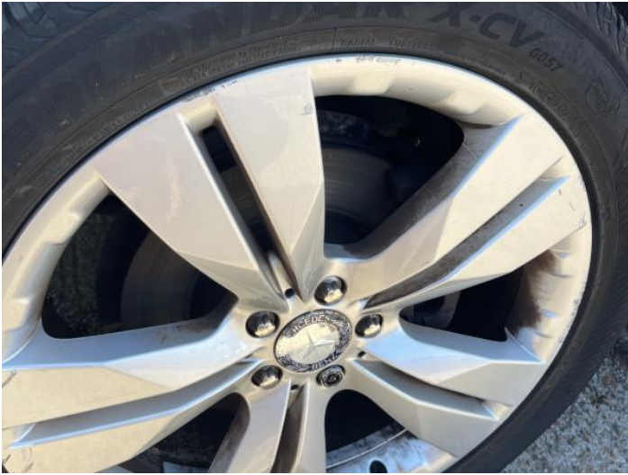
3: Wheel osf Scratched Over 50mm