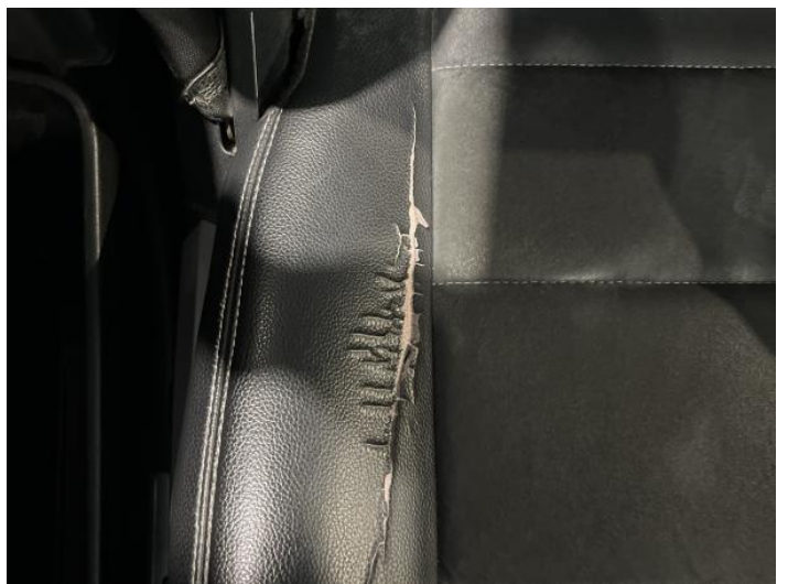
14: Seat Base Cover osf Torn Over 3mm