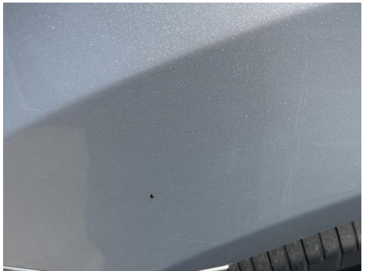
12: Qtr Panel osr Scratched Over 25mm Thru Paint