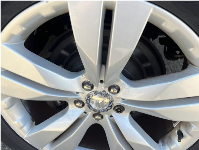
9: Wheel nsr Scratched Up To 50mm