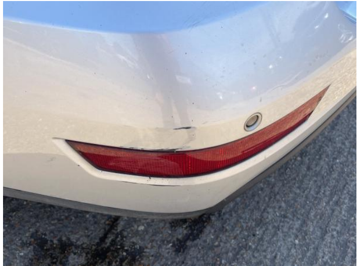
10: Bumper Rear Scratched Over 100mm Thru Paint