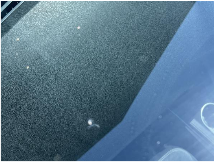
5: Screen Front Chipped UpTo 10mm