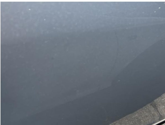
13: Door osf Scratched Up To 25mm Thru Paint