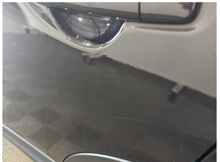
8: Door nsr Scratched Over 25mm Thru Paint