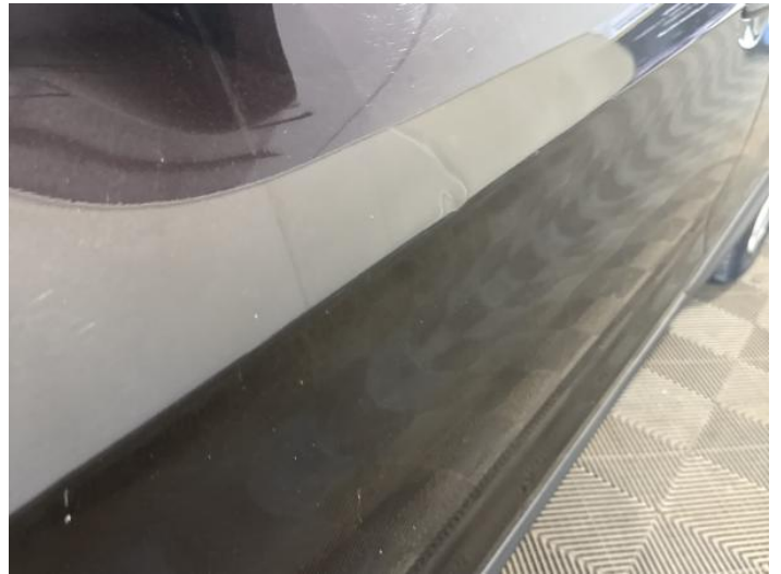
6: Door nsf Dented Between 10mm + 30mm