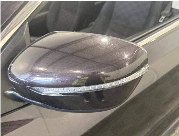
5: Door Mirror Assy nsf Scratched (Painted) UpTo 25mm Thru Paint