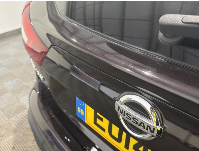
11: Tailgate Scratched Over 25mm Thru Paint