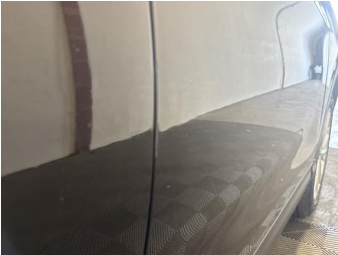
15: Door osf Dented Between 10mm + 30mm