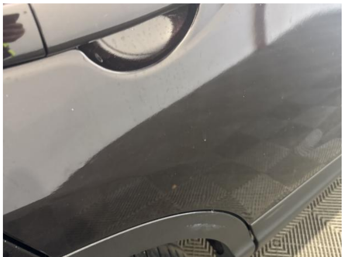
14: Door osr Chipped 1 To 5