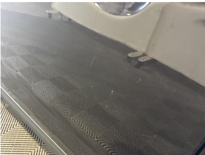
7: Door nsf Scratched Over 25mm Thru Paint