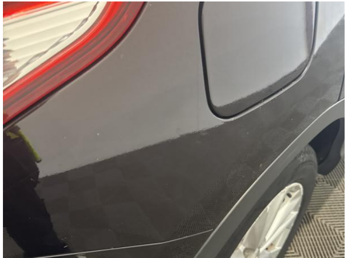
12: Qtr Panel osr Chipped 1 To 5