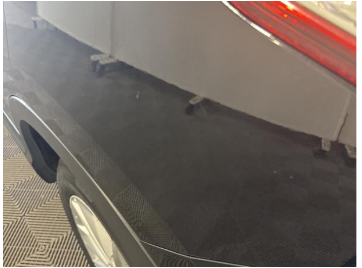
10: Qtr Panel nsr Scratched UpTo 25mm Thru Paint