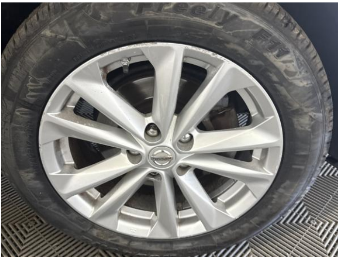
17: Wheel osf Scratched Over 50mm