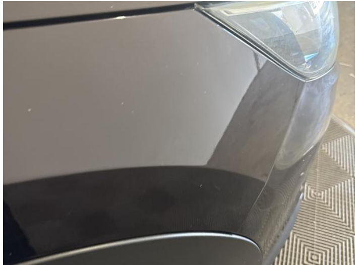
16: Wing osf Chipped 1 To 5