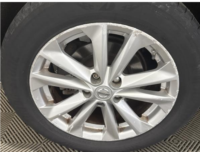
13: Wheel osr Scratched Over 50mm