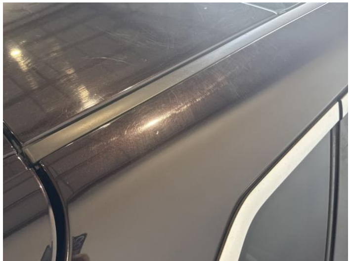
18: Roof Scratched Over 25mm Thru Paint