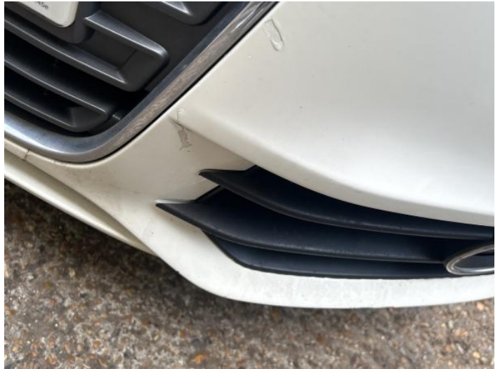
10: Bumper Front Poor Previous Repair Paint Flake