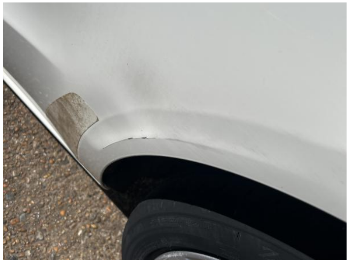
6: Qtr Panel nsr Dented With Paint Damage