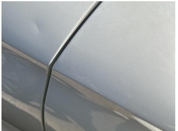
2: Door osf Chipped 1 To 5