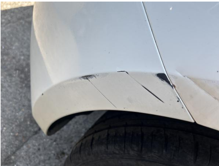
5: Bumper Rear Scratched Over 100mm Thru Paint