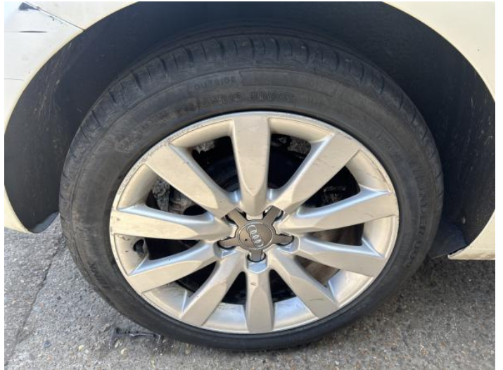
4: Wheel nsr Scratched Over 50mm