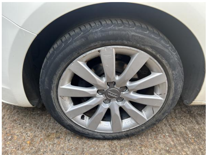
8: Wheel nsf Scratched Over 50mm