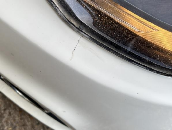
9: Bumper Front Cracked UpTo 25mm