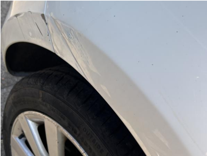
3: Qtr Panel osr Dented With Paint Damage