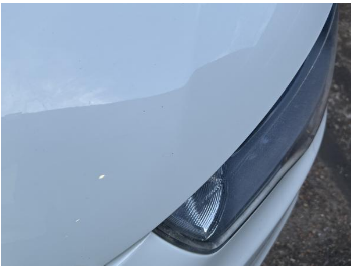
11: Bonnet Chipped 1 To 5