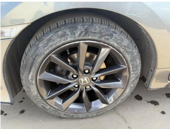
13: Wheel nsf Scratched Over 50mm