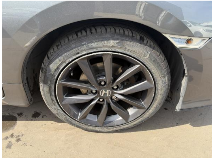
4: Wheel osf Scratched Over 50mm