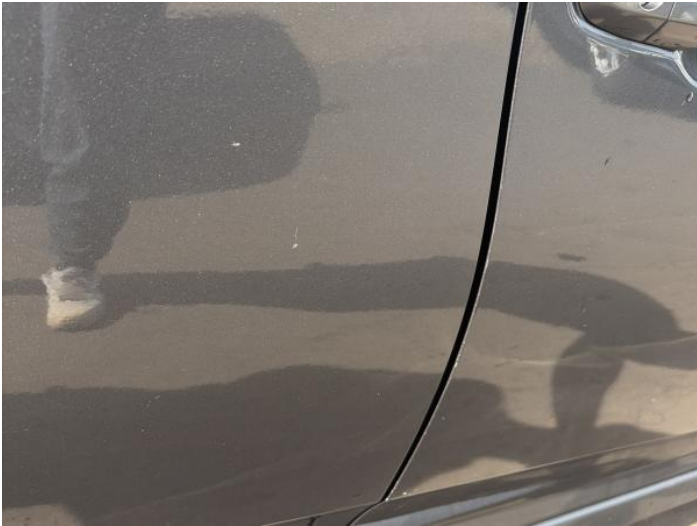
3: Door osr Chipped 1 To 5