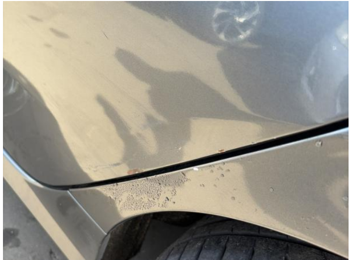
10: Door nsr Dented With Paint Damage