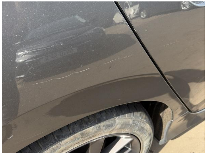
6: Qtr Panel osr Scratched Over 25mm Thru Paint