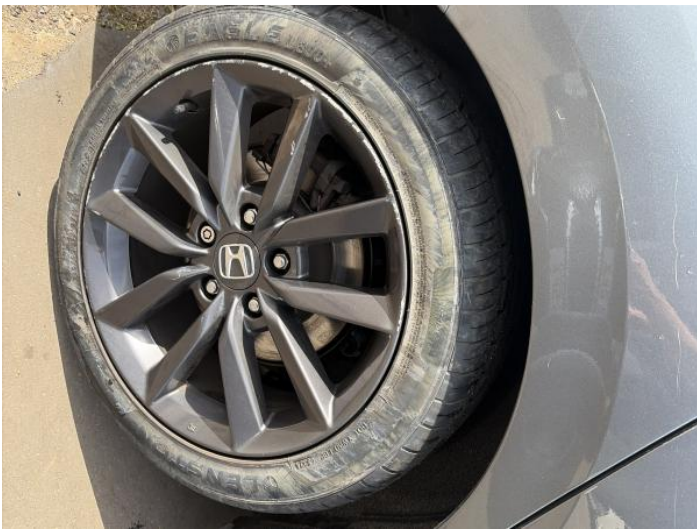
5: Wheel osr Scratched Over 50mm