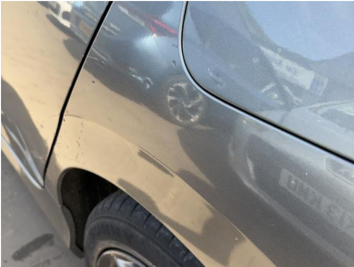
9: Qtr Panel nsr Dented With Paint Damage