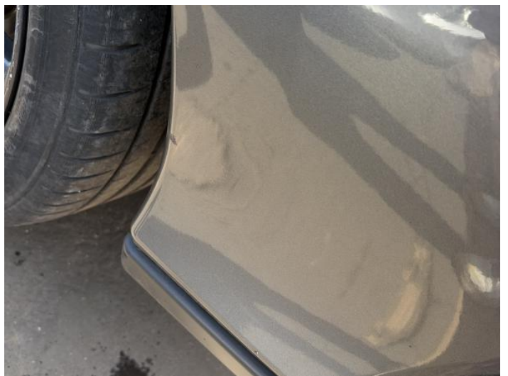
8: Bumper Rear Chipped 1 To 5