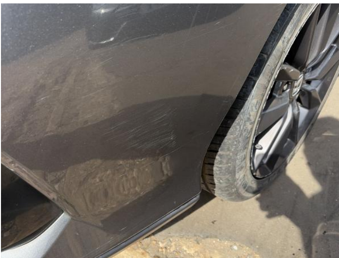
7: Bumper Rear Scratched 25 to 100mm Thru Paint