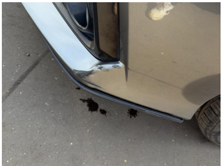
14: Bumper Front Dented With Paint Damage