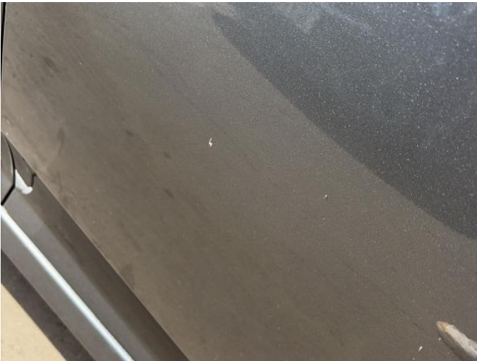
1: Door osf Chipped 1 To 5