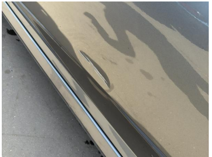
12: Door nsf Dented With Paint Damage