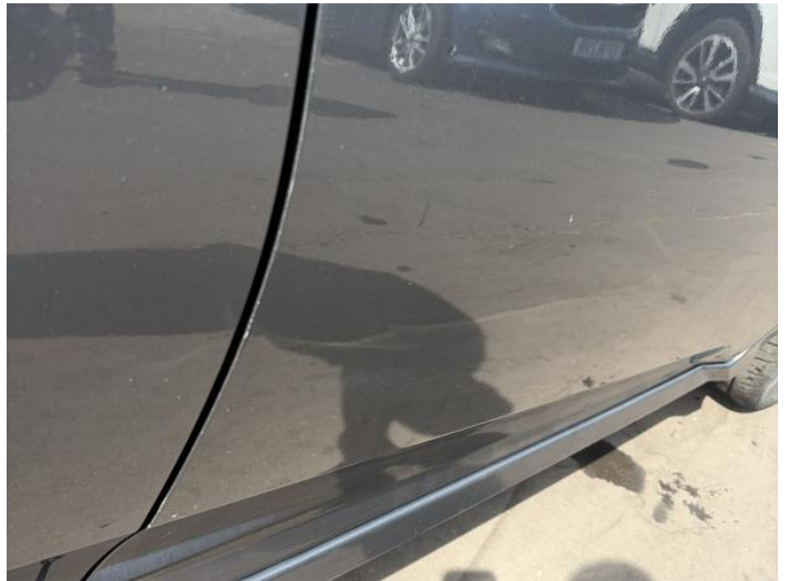
2: Door osf Chipped Edge Chip