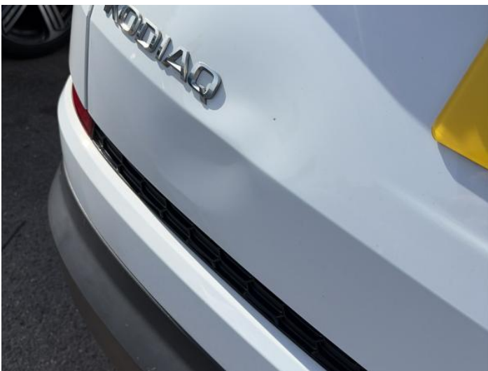
7: Tailgate Dented Over 30mm