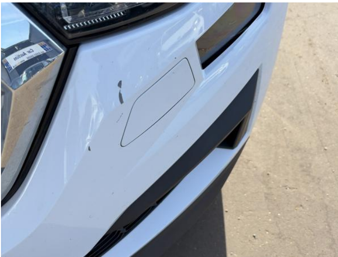
5: Bumper Front Scratched 25 to 100mm Thru Paint