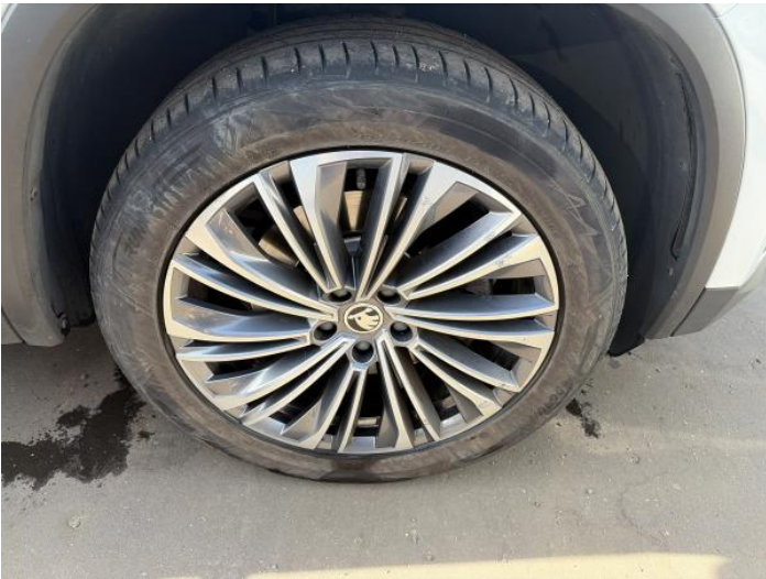
1: Wheel of Scratched Over 50mm