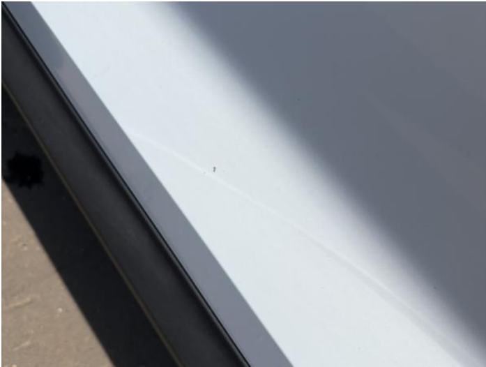
3: Door nsf Chipped 1 To 5