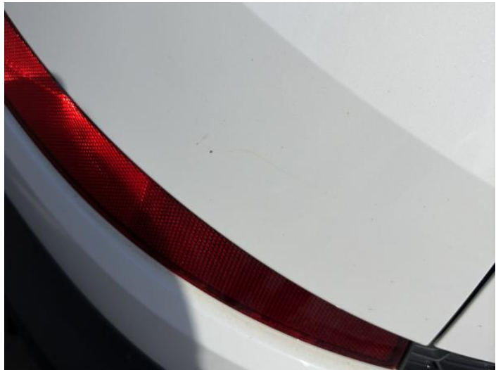
2: Bumper Rear Chipped 1 To 5