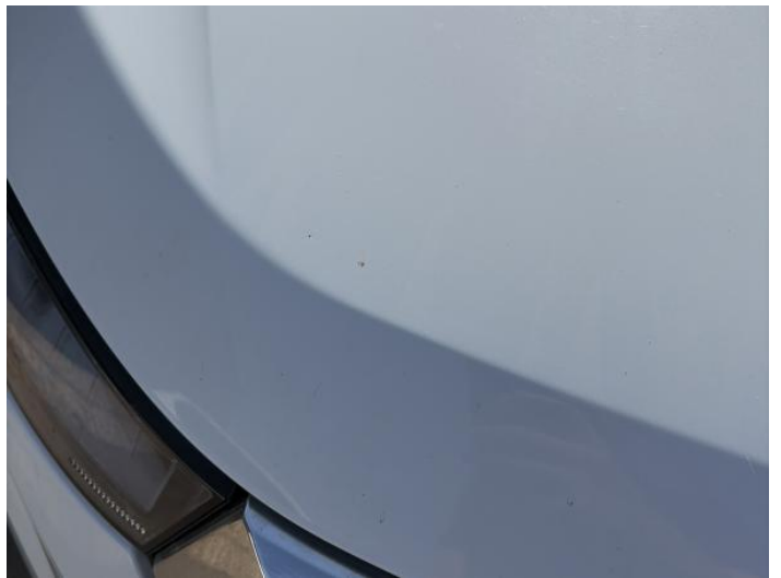
6: Bonnet Chipped 1 To 5