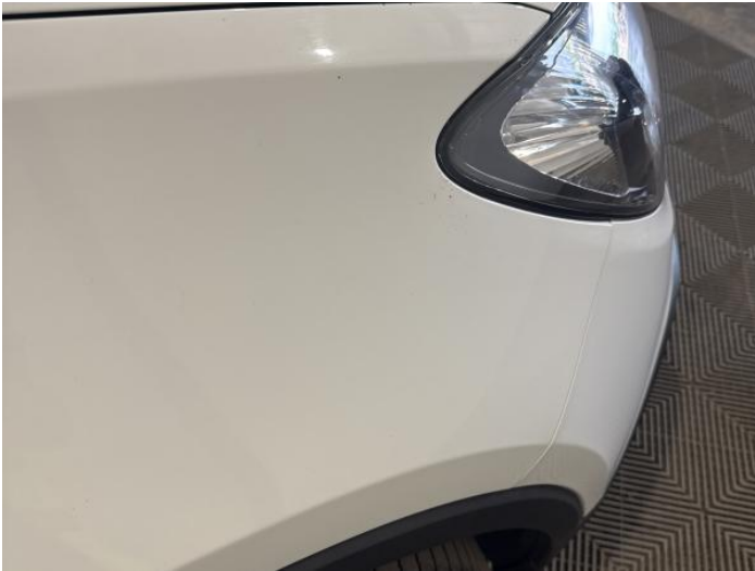
15: Wing osf Chipped 1 To 5