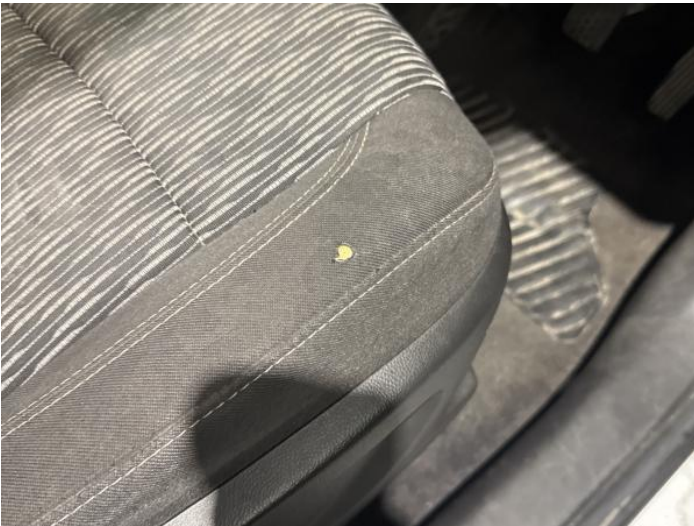
1: Seat Base Cover osf Burn Over 3mm