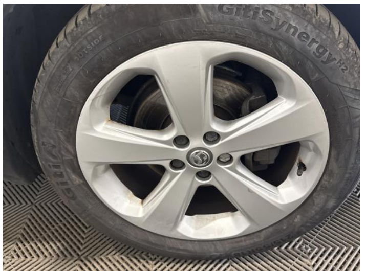
14: Wheel osf Scratched Over 50mm