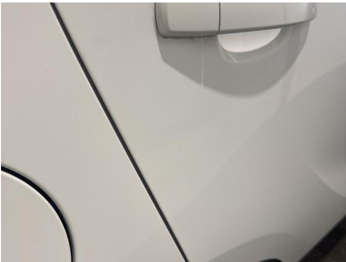
11: Door osr Chipped Edge Chip