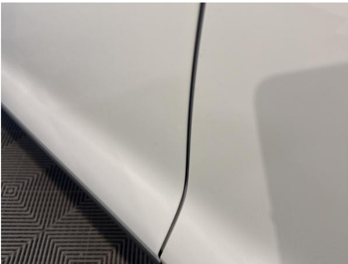
5: Door nsf Chipped Edge Chip