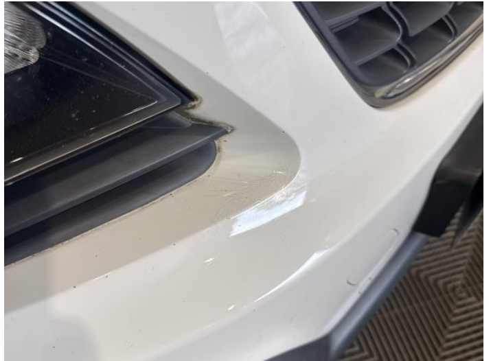
4: Bumper Front Dented With Paint Damage