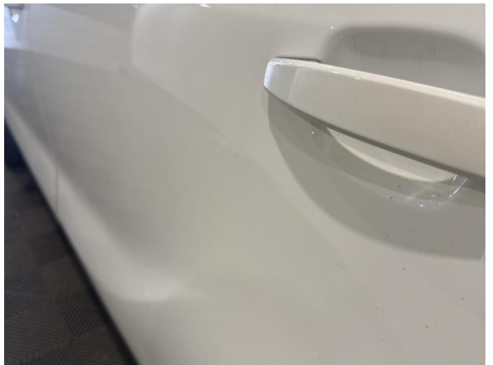
6: Door nsr Poor Previous Repair Rippled Up To 30%