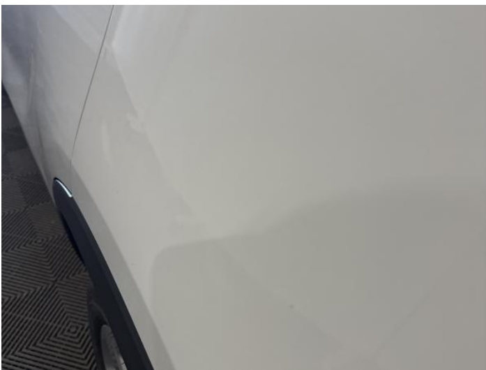
7: Qtr Panel nsr Scratched Over 25mm Thru Paint