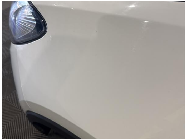
16: Wing nsf Chipped 1 To 5