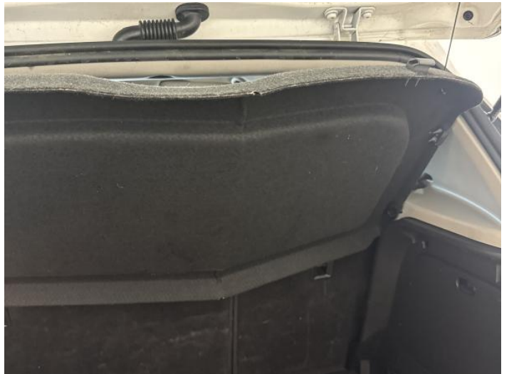
2: Other N/A N/A