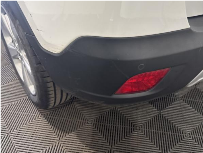
9: Bumper Rear Moulding Scuffed (Unpainted) Over 100mm