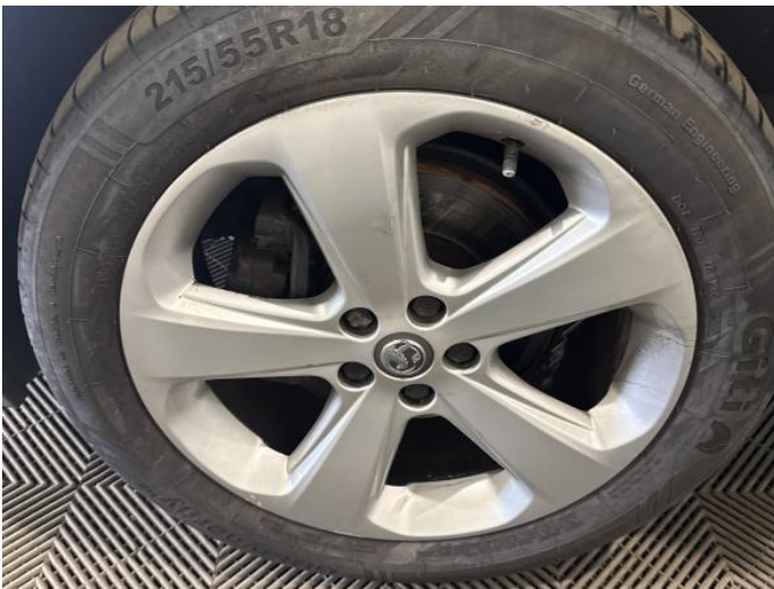
17: Wheel nsf Scratched Over 50mm