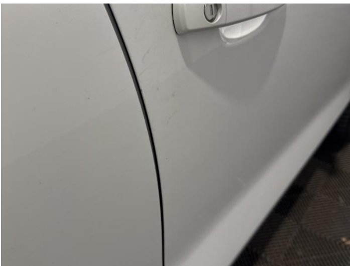
13: Door osf Chipped Edge Chip