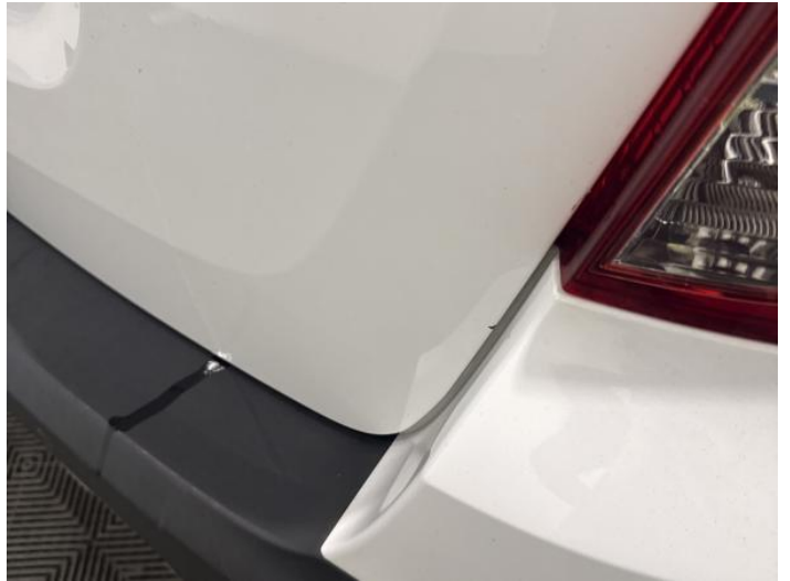
10: Tailgate Chipped 1 To 5