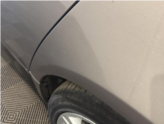
9: Qtr Panel nsr Scratched UpTo 25mm Thru Paint