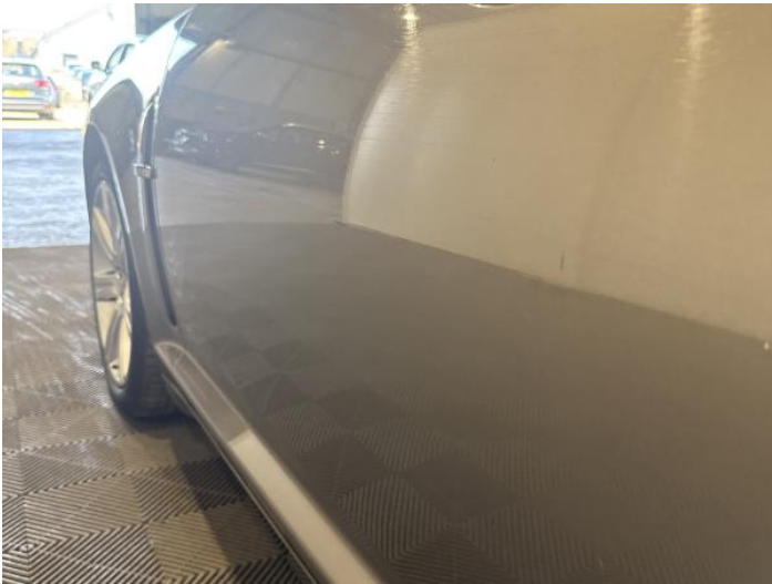
5: Door nsf Dented Between 10mm + 30mm