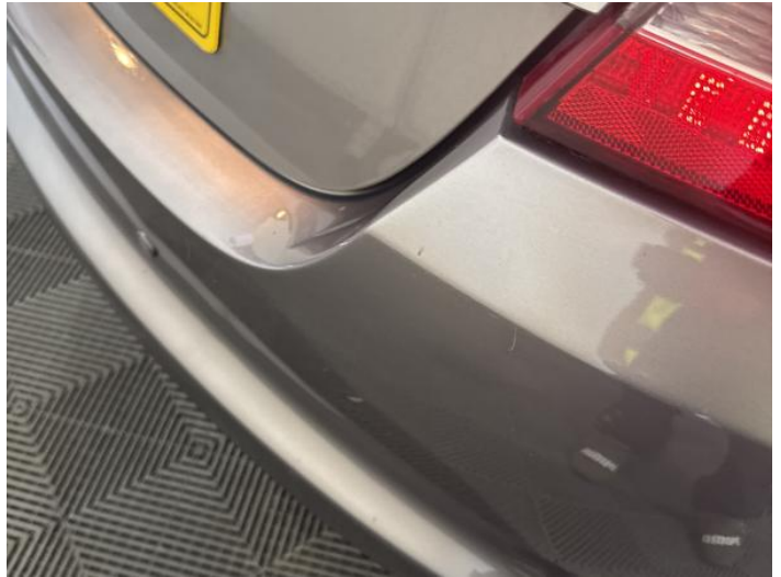
10: Bumper Rear Scratched Up To 25mm Thru Paint