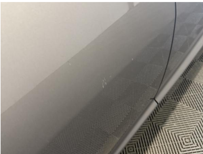
13: Door osr Scratched Over 25mm Thru Paint