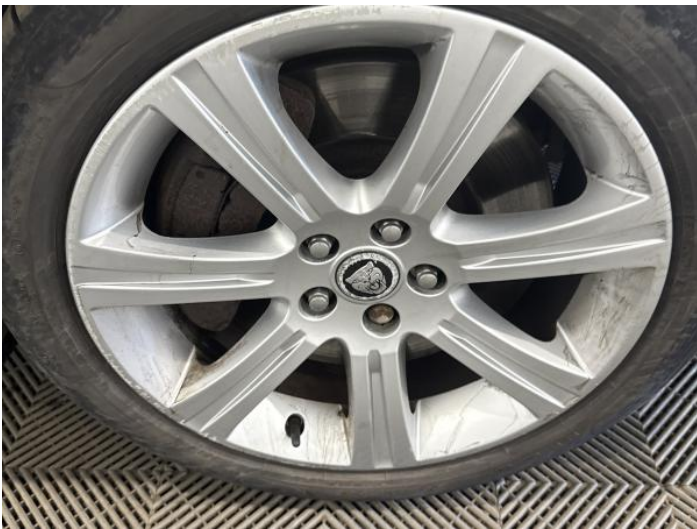
17: Wheel osf Scratched Over 50mm