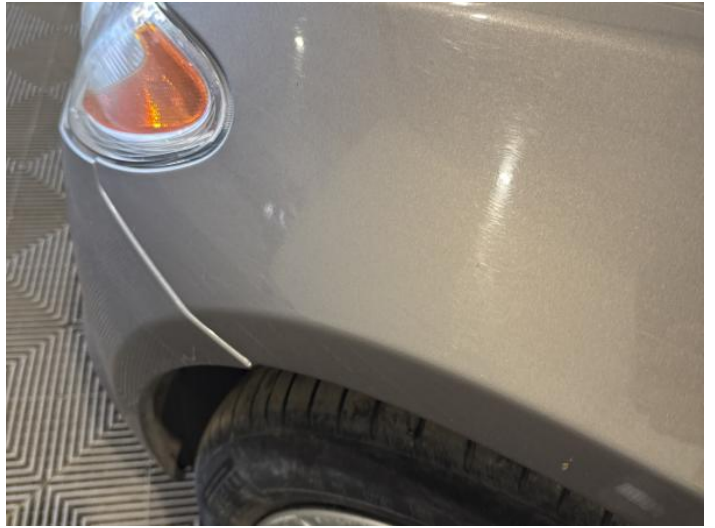
4: Wing nsf Scratched UpTo 25mm Thru Paint