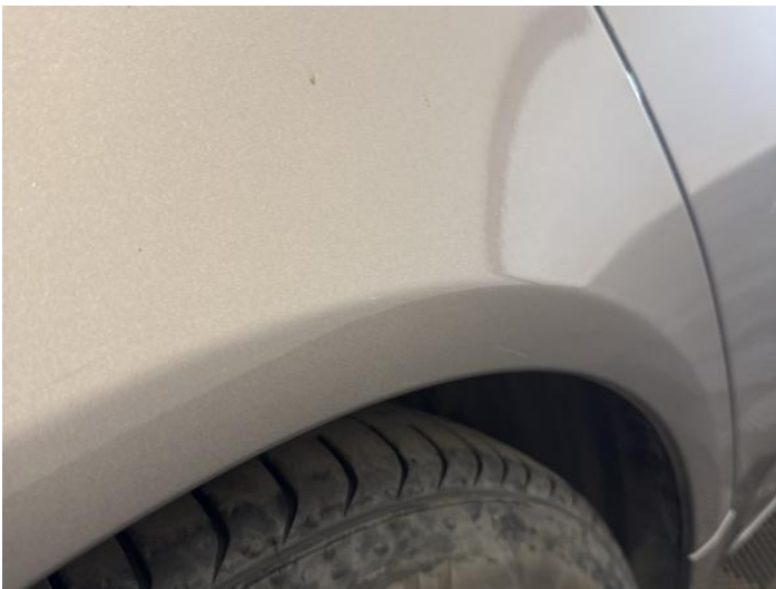
11: Qtr Panel osr Scratched UpTo 25mm Thru Paint