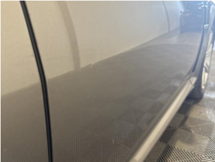
15: Door osf Dented Between 10mm + 30mm