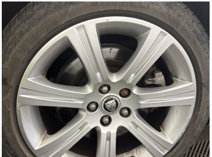
12: Wheel osr Scratched Up To 50mm