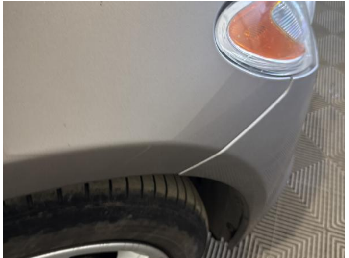
16: Wing osf Scratched UpTo 25mm Thru Paint