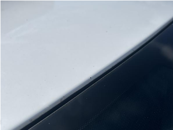
15: Roof Chipped 1 To 5