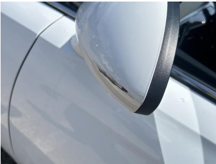
11: Door Mirror Assy nsf Scratched (Painted) Over 25mm Thru Paint