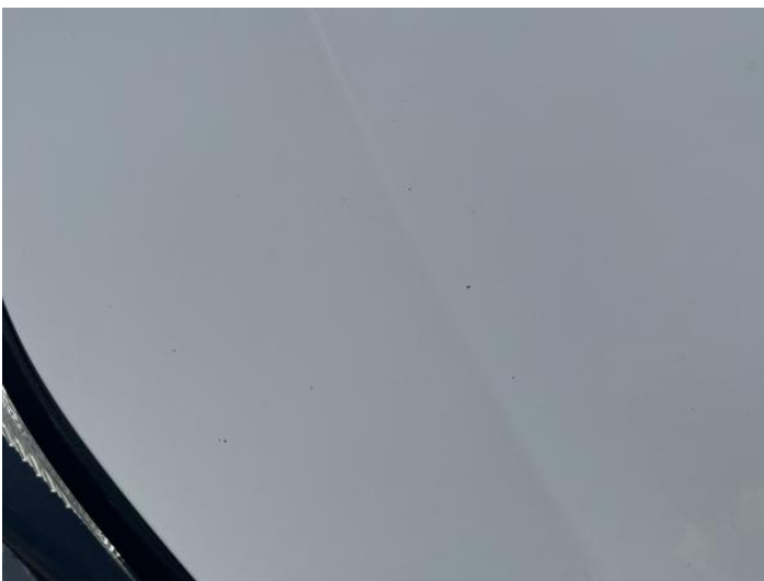
13: Bonnet Chipped Multiple Chips