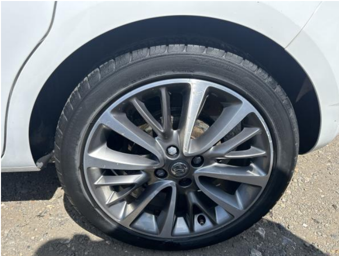
3: Wheel nsr Corroded Light