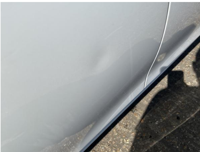
7: Door osr Dented With Paint Damage