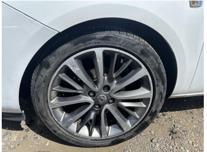
4: Wheel nsf Corroded Light