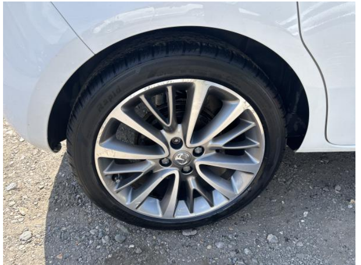
2: Wheel osr Scratched Over 50mm