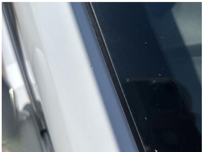
14: A Post os Chipped 1 To 5