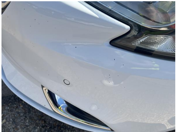
12: Bumper Front Chipped Multiple Chips