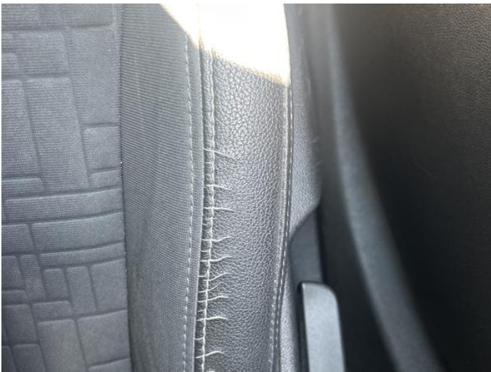
5: Seat Base Cover osf Torn Over 3mm