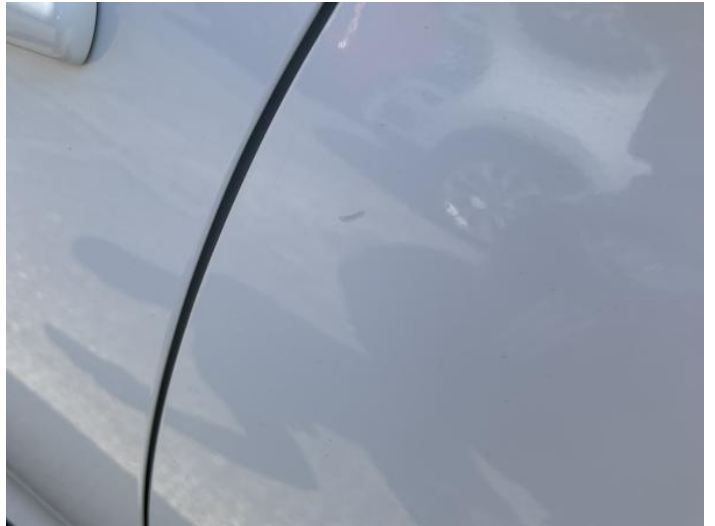
10: Door nsr Chipped 1 To 5