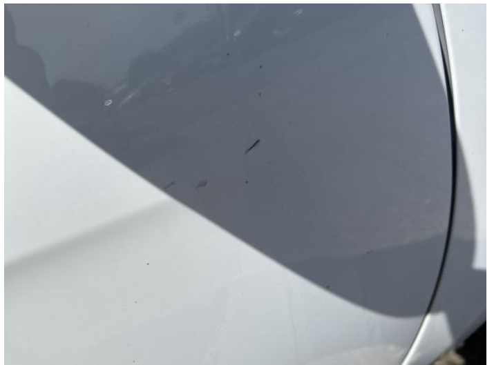
6: Door osf Chipped 1 To 5