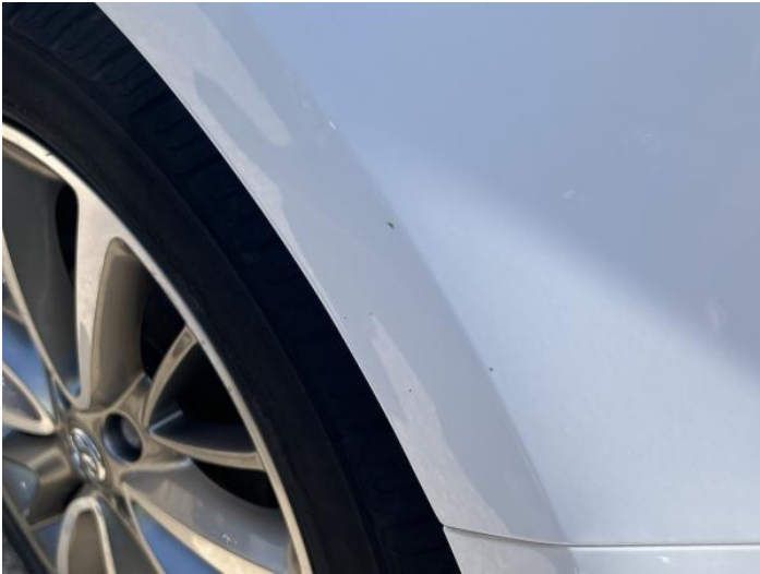
9: Qtr Panel nsr Chipped 1 To 5