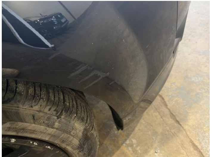
2: Wing osf Scratched Over 25mm Thru Paint