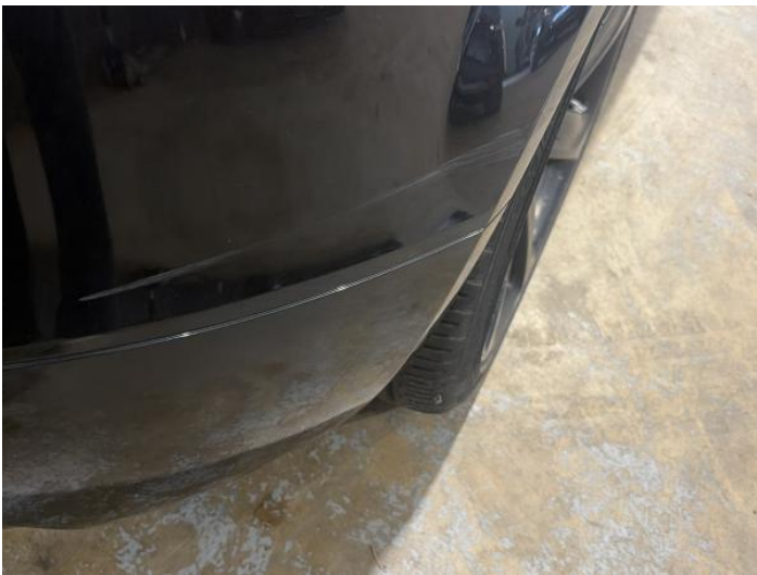
5: Bumper Rear Scratched 25 to 100mm Thru Paint