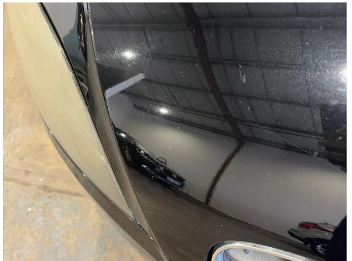
12: Bonnet Chipped 1 To 5