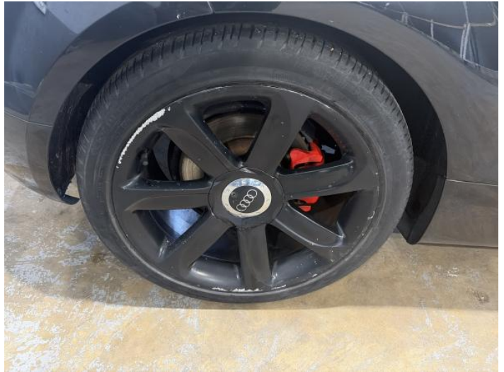
4: Wheel osr Scratched Over 50mm