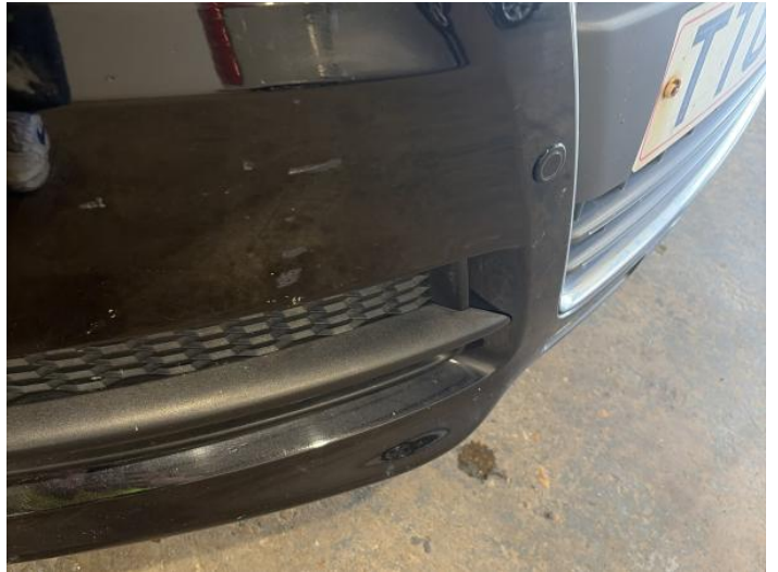
10: Bumper Front Scratched 25 to 100mm Thru Paint