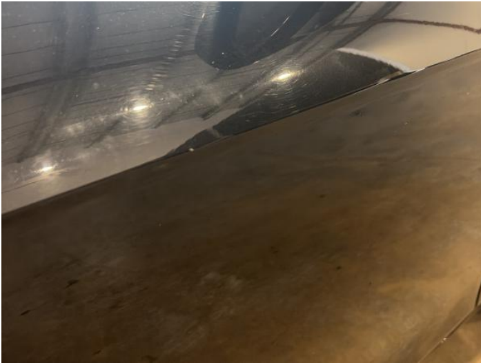
3: Door osf Chipped 1 To 5