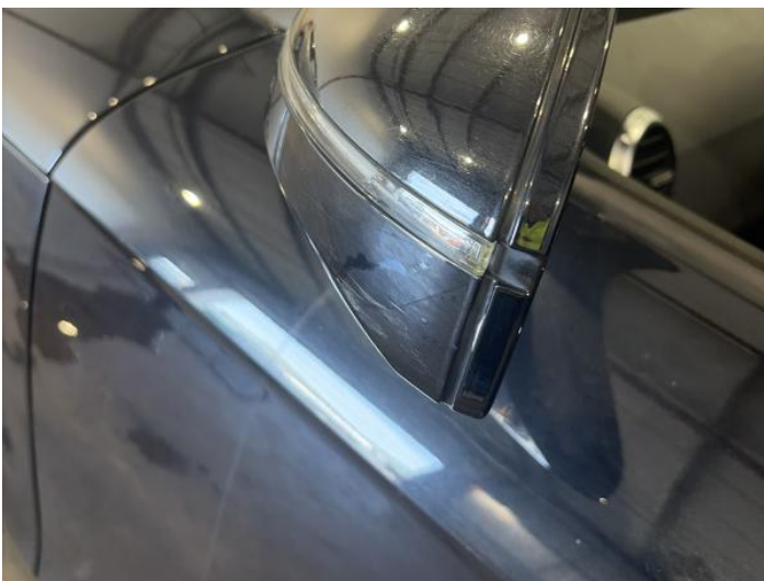
7: Door Mirror Assy nsf Scratched (Painted) Up To 25mm Thru Paint