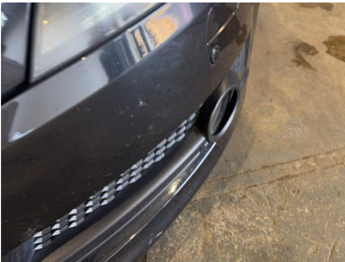
11: Bumper Front Chipped Multiple Chips