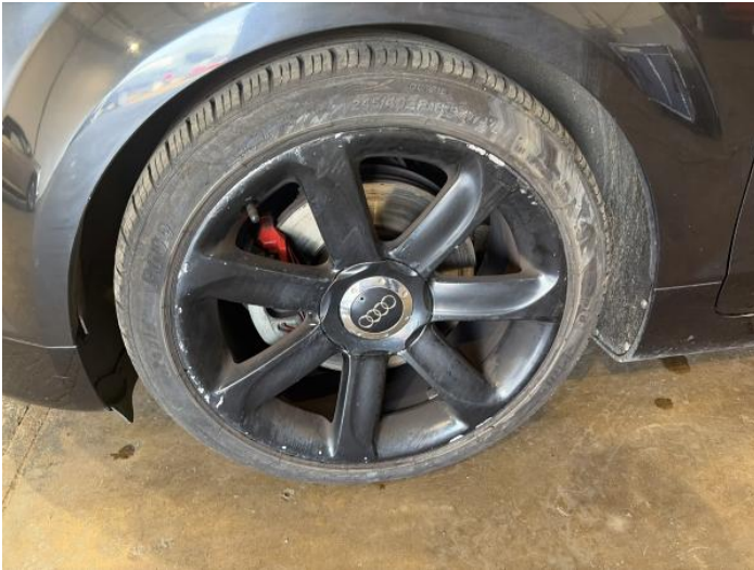
9: Wheel nsf Scratched Over 50mm