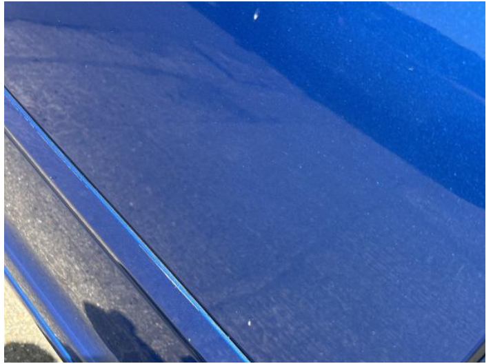
4: Door osr Chipped 1 To 5