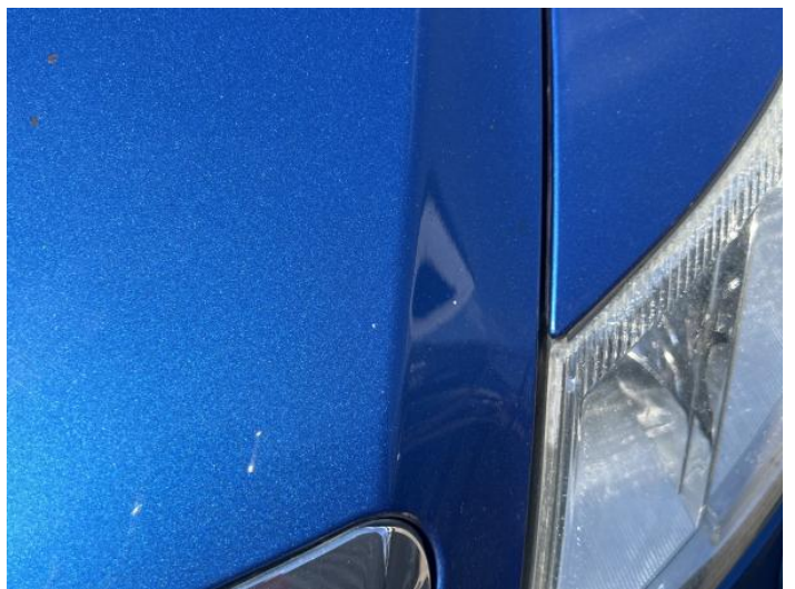
14: Bonnet Chipped 1 To 5