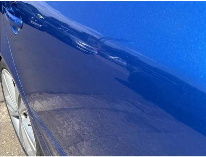
5: Door osr Dented 2 Or Less UpTo 10mm