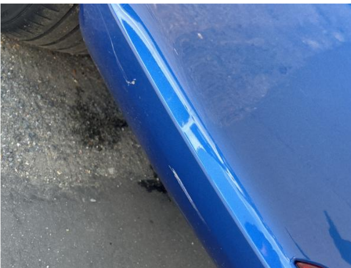
7: Bumper Rear Scratched Over 100mm Thru Paint