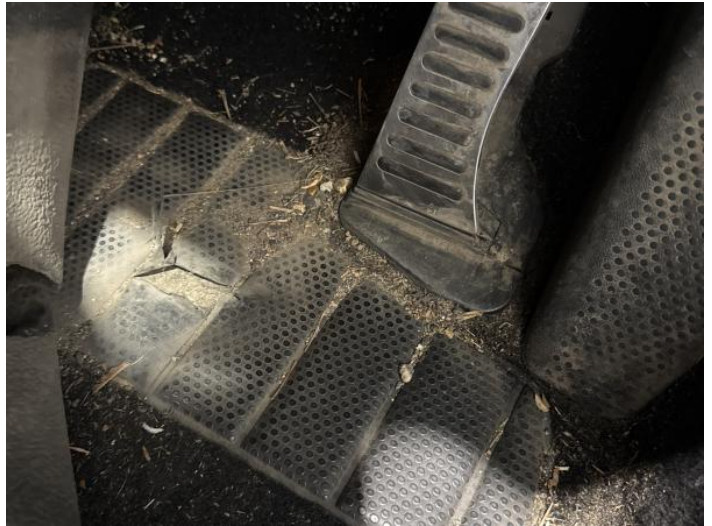
16: Carpets Front Torn Over 10mm