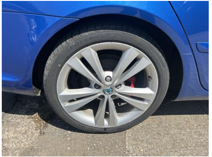
6: Wheel osr Scratched Over 50mm