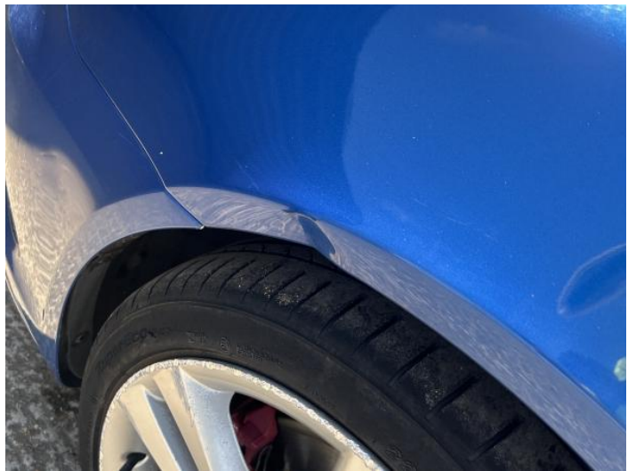
12: Wing nsf Dented With Paint Damage