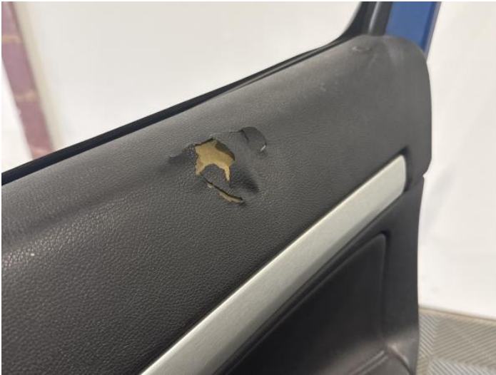
15: Door Pad osf Torn Over 10mm