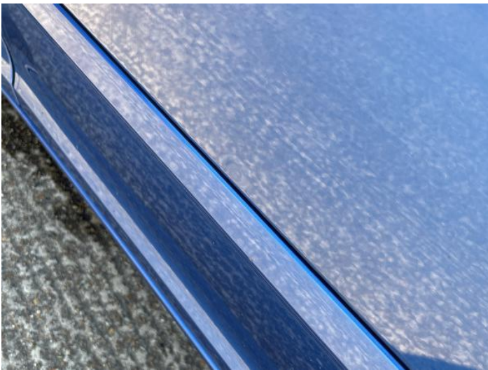
11: Door nsf Dented 2 Or Less UpTo 10mm