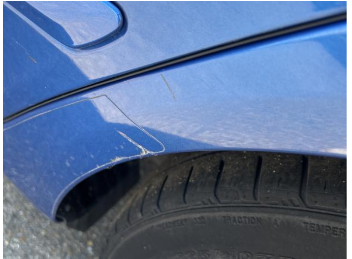
10: Qtr Panel nsr Scratched UpTo 25mm Thru Paint