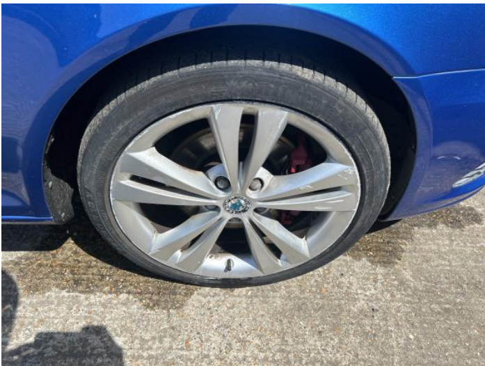
1: Wheel of Scratched Over 50mm