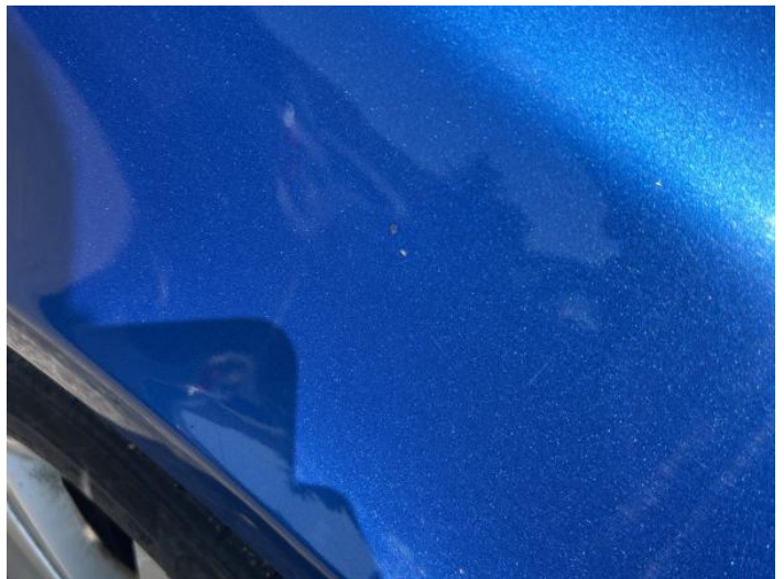
2: Wing of Chipped 1 To 5