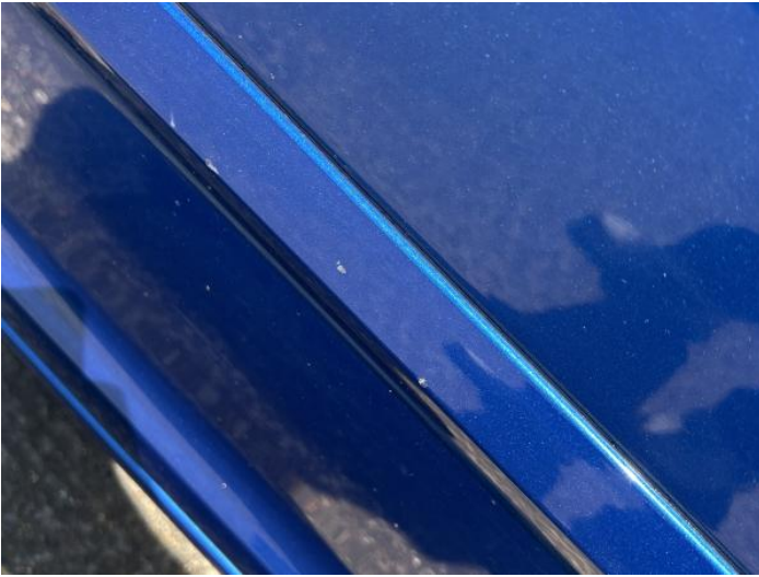
3: Door Moulding osf Scratched (Painted) UpTo 25mm Thru Paint