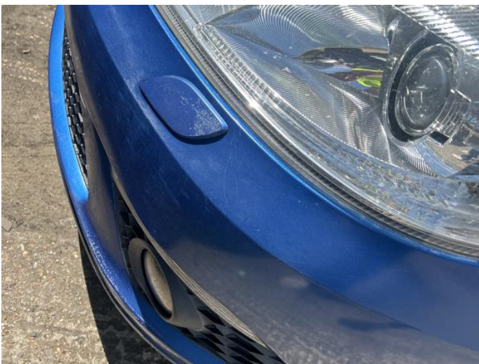
13: Bumper Front Poor Previous Repair Poor Paint