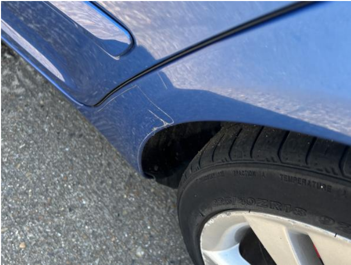
9: Qtr Panel nsr Dented 2 Or Less UpTo 10mm