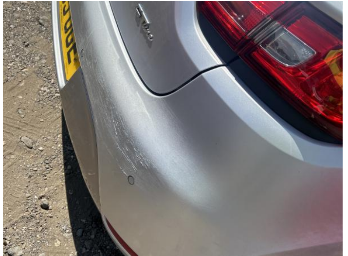
4: Bumper Rear Poor Previous Repair Paint Flake