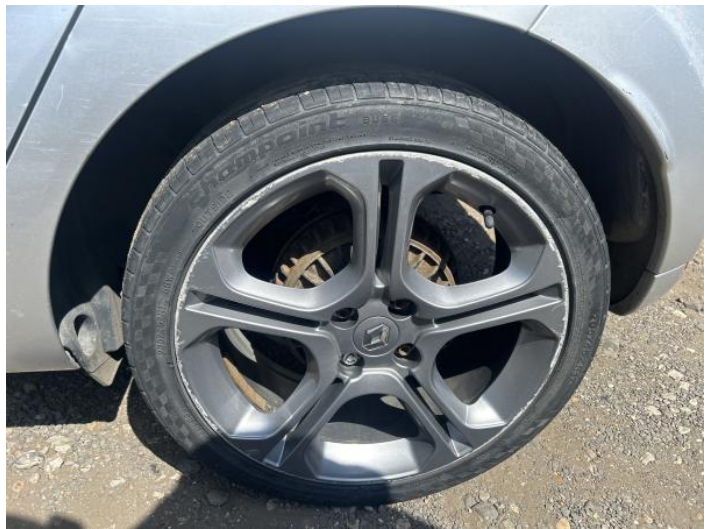
6: Wheel nsr Scratched Over 50mm