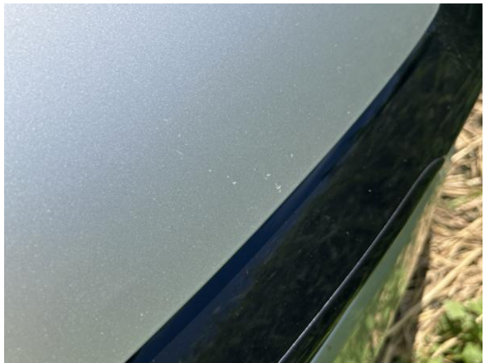
12: Bonnet Chipped 1 To 5