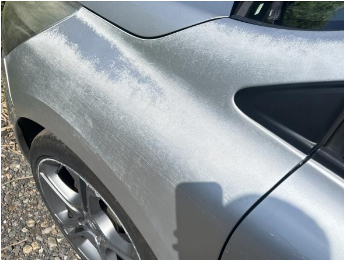
9: Wing nsf Poor Previous Repair Paint Flake