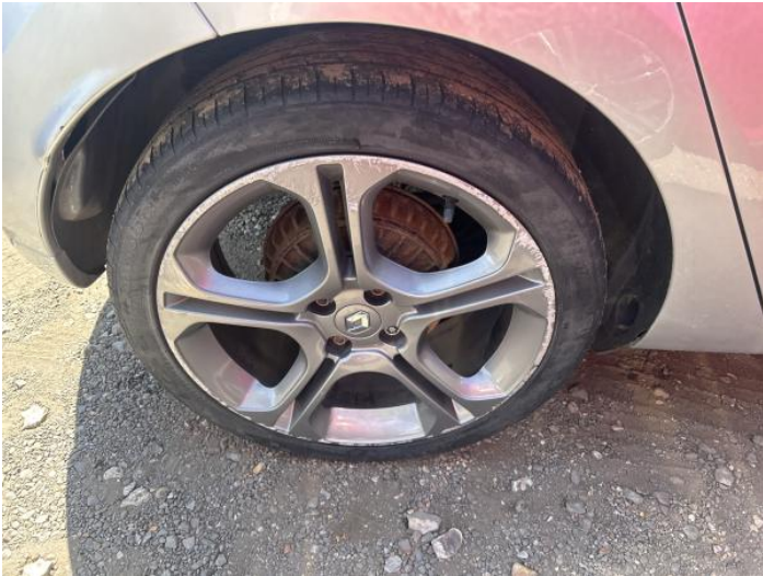
3: Wheel osr Scratched Over 50mm