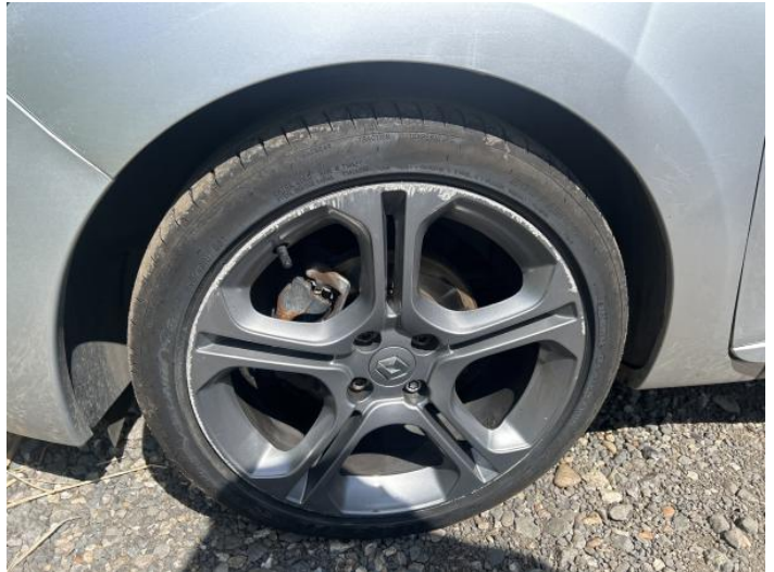
10: Wheel nsf Scratched Over 50mm