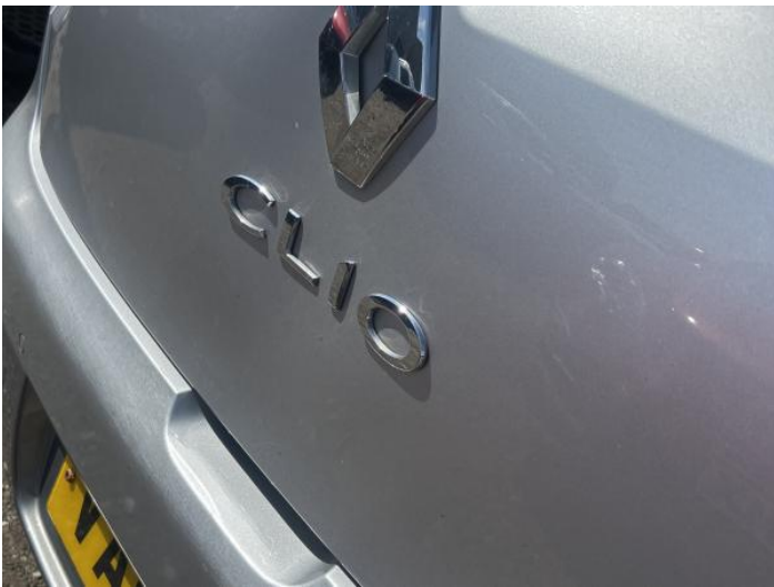
5: Tailgate Dented Over 30mm