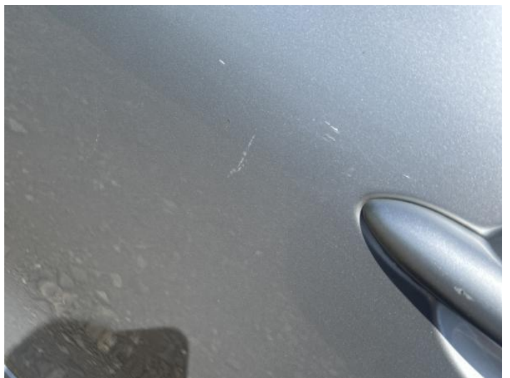
8: Door nsf Scratched UpTo 25mm Thru Paint