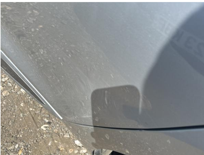
7: Door nsr Dented Over 30mm