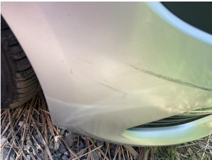
11: Bumper Front Poor Previous Repair Poor Paint