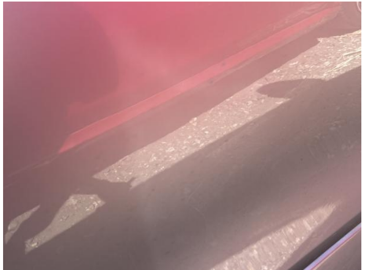
2: Door osf Chipped 1 To 5