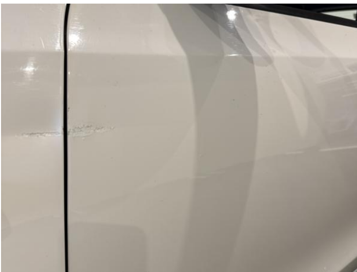
7: Door nsf Dented With Paint Damage