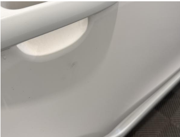
17: Door osr Scratched UpTo 25mm Thru Paint