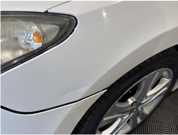
5: Wing nsf Dented With Paint Damage