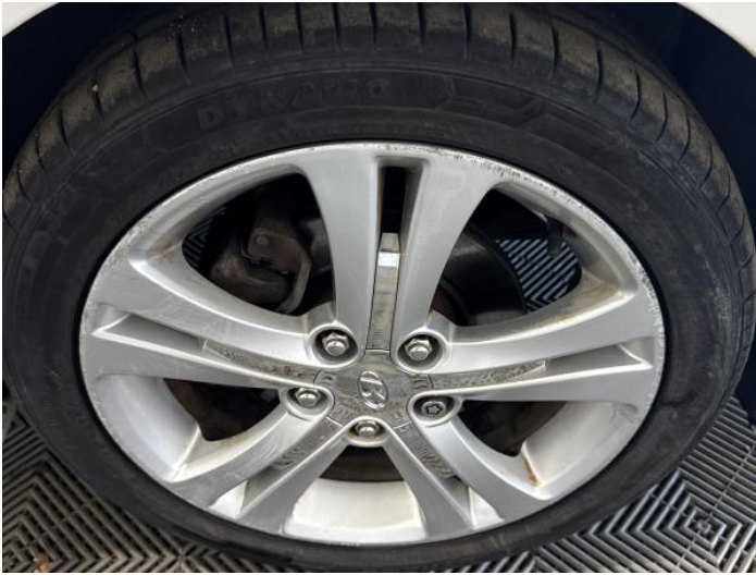
21: Wheel osf Scratched Over 50mm