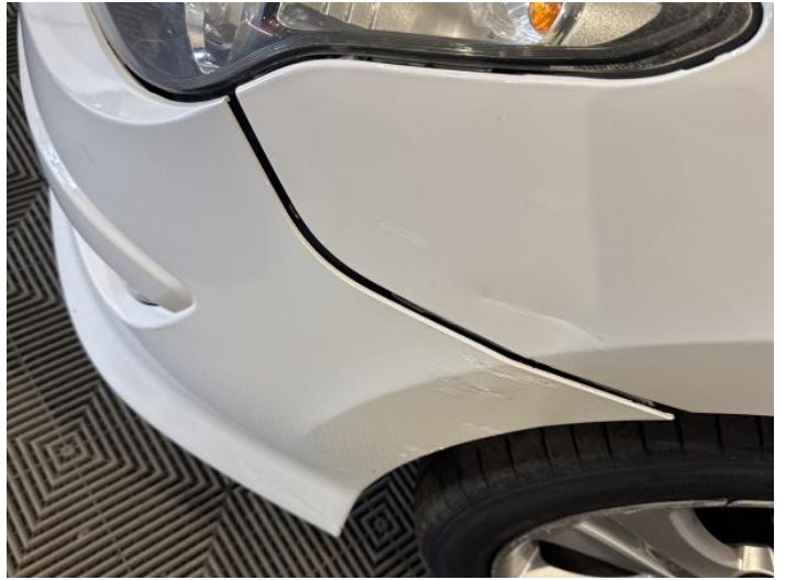
4: Bumper Front Insecure Action Required