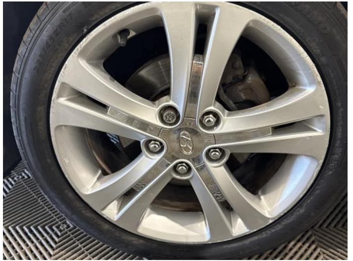
6: Wheel nsf Scratched Over 50mm