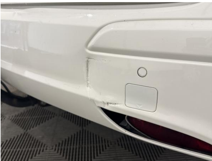
13: Bumper Rear Cracked Over 25mm