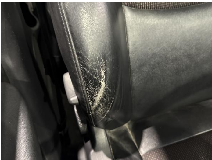
1: Seat Back Cover osf Scuffed Over 25mm