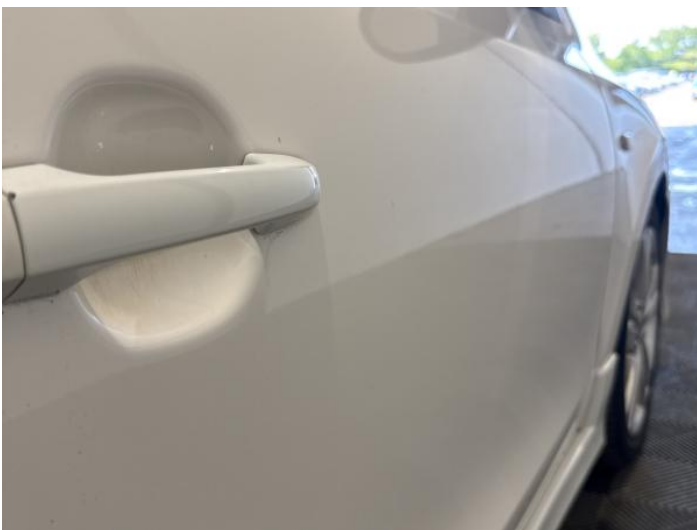
19: Door osf Dented Over 30mm