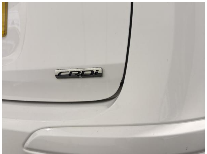
14: Tailgate Scratched UpTo 25mm Thru Paint