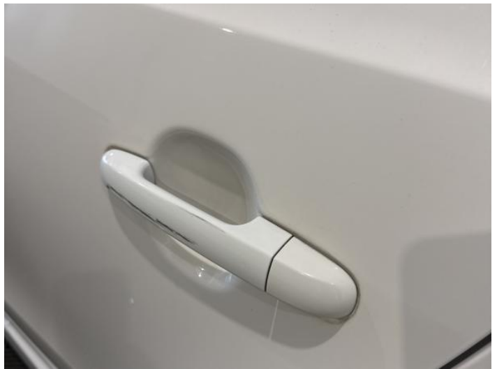
12: Handle Outer nsr Scratched (Painted) Over 25mm Thru Paint