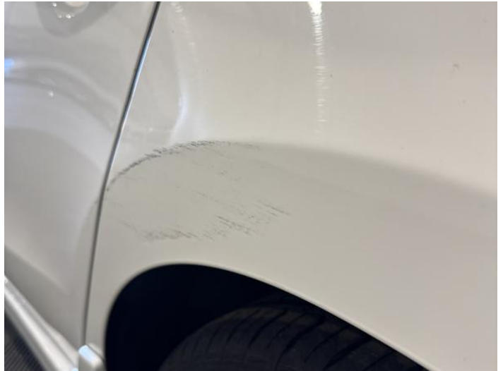
10: Qtr Panel nsr Scratched Over 25mm Thru Paint