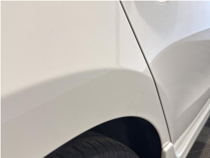
15: Qtr Panel osr Dented 2 Or Less UpTo 10mm