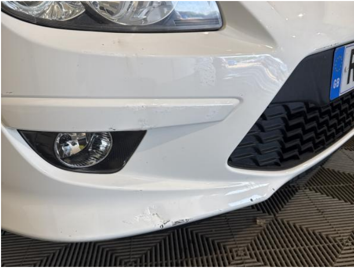
3: Bumper Front Dented With Paint Damage