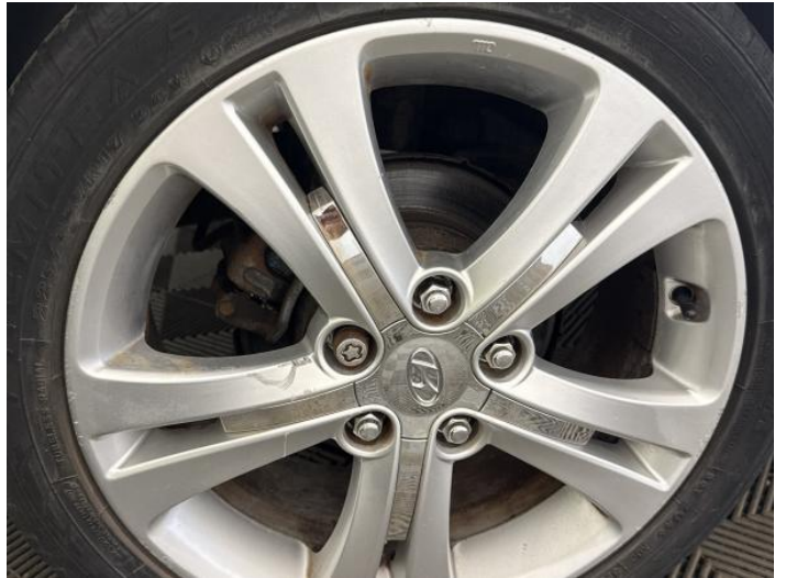
16: Wheel osr Scratched Over 50mm