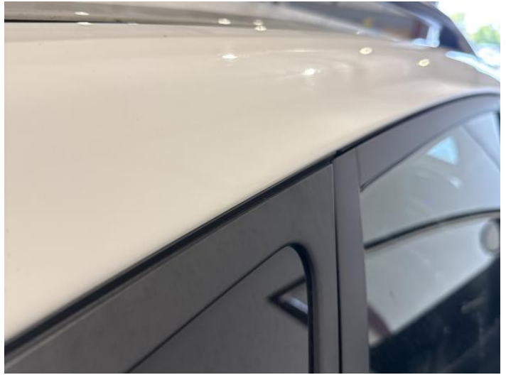
22: C Post os Dented Between 10mm + 30mm