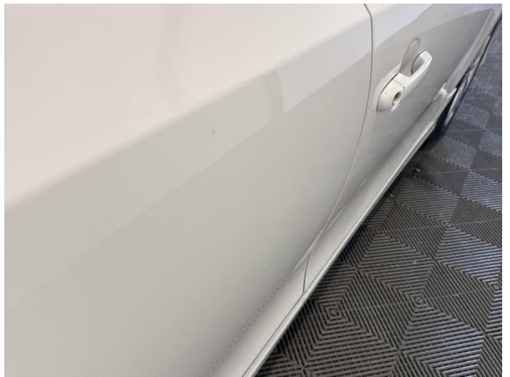
18: Door osr Dented Between 10mm + 30mm