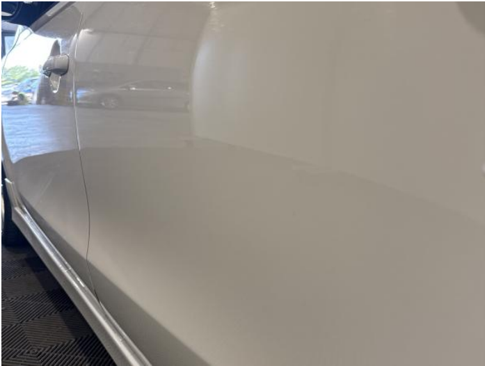
9: Door nsr Dented Between 10mm + 30mm