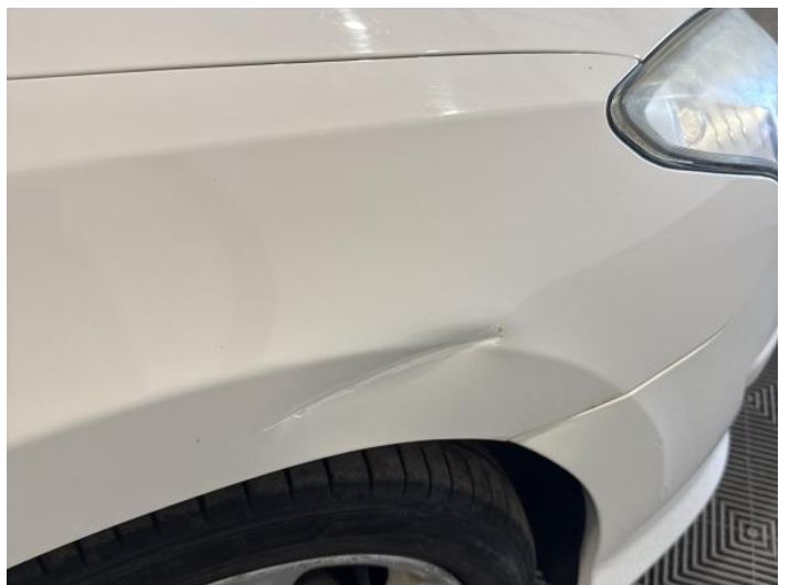
20: Wing osf Dented With Paint Damage