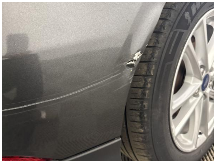
14: Bumper Rear Cracked Over 25mm