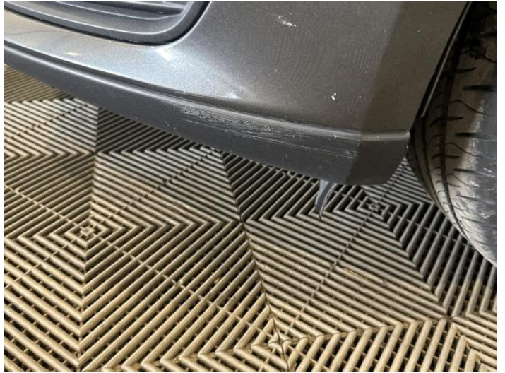
4: Bumper Front Moulding Scuffed (Unpainted) Over 100mm