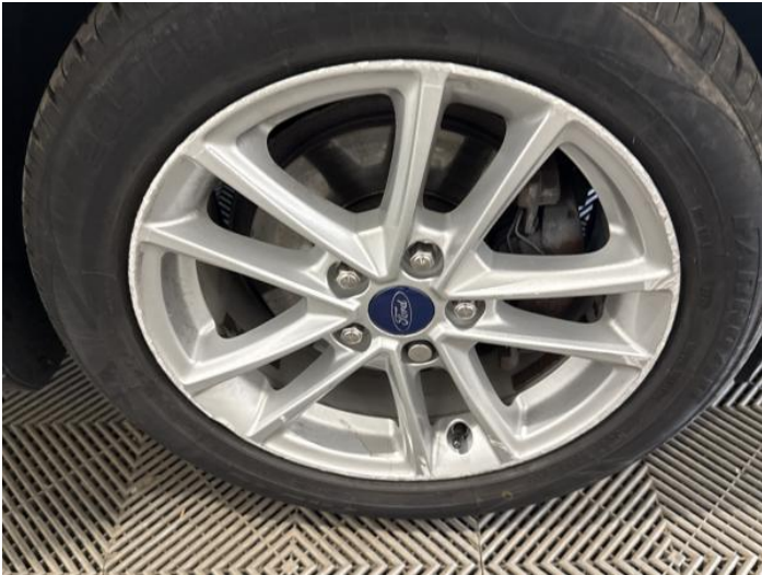
21: Wheel of Scratched Over 50mm