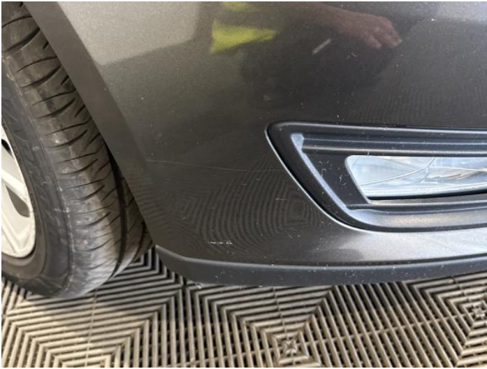
3: Bumper Front Scratched 25 to 100mm Thru Paint