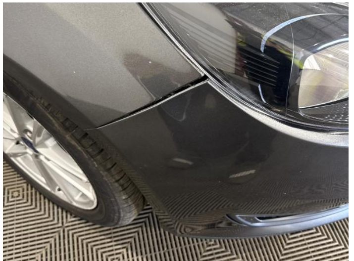
2: Bumper Front Insecure Action Required