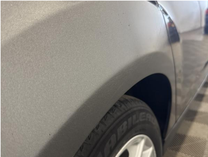
15: Qtr Panel osr Poor Previous Repair Poor Paint