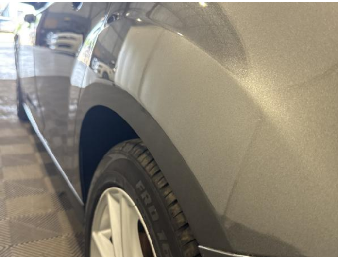
11: Qtr Panel nsr Dented Over 30mm