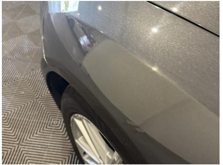
6: Wing nsf Dented Between 10mm + 30mm