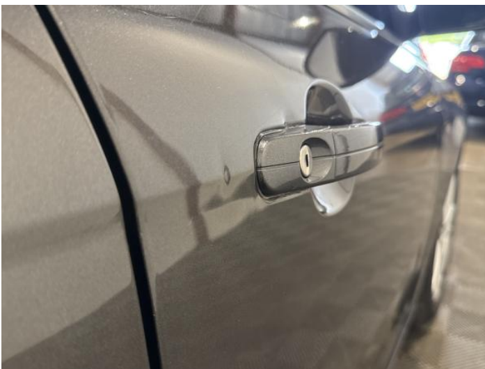
19: Door osf Dented Between 10mm + 30mm