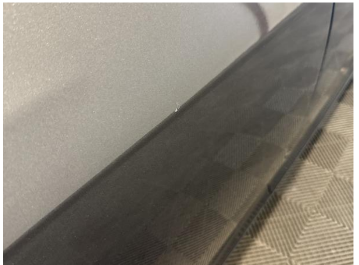
18: Door osr Dented Between 10mm + 30mm