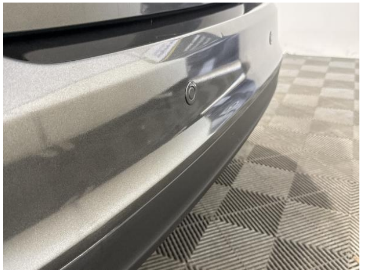
12: Bumper Rear Poor Previous Repair Poor Paint