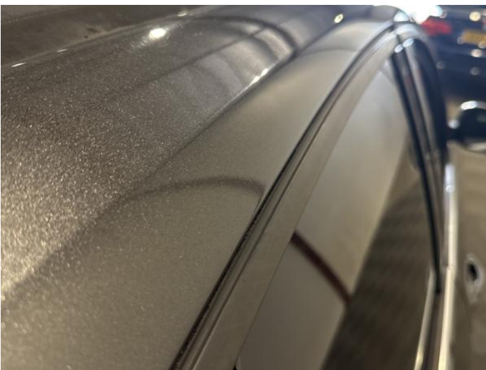
13: B Post os Dented Over 30mm