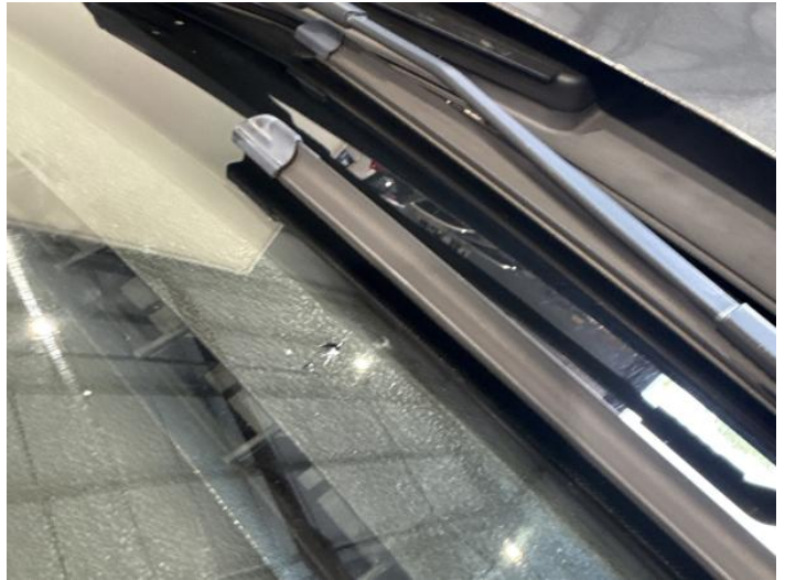
22: Screen Front Cracked Replace