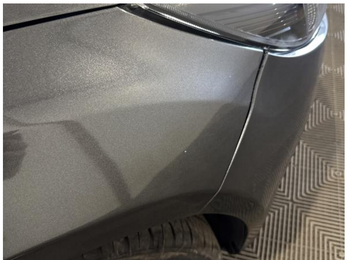
20: Wing osf Chipped 1 To 5