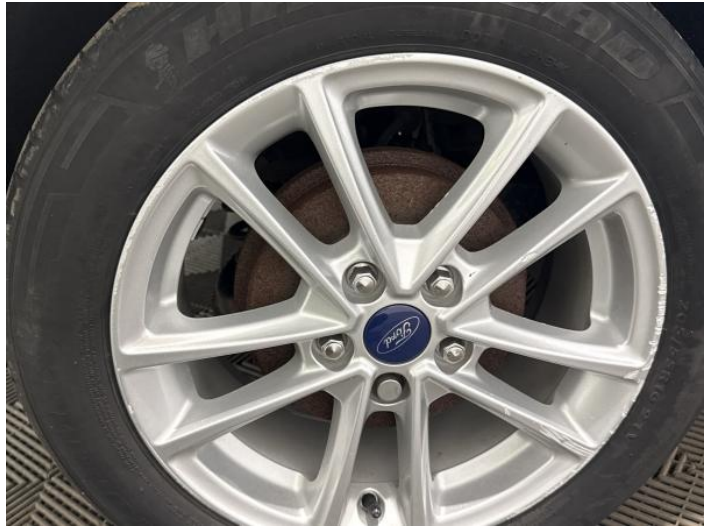
16: Wheel osr Scratched Over 50mm