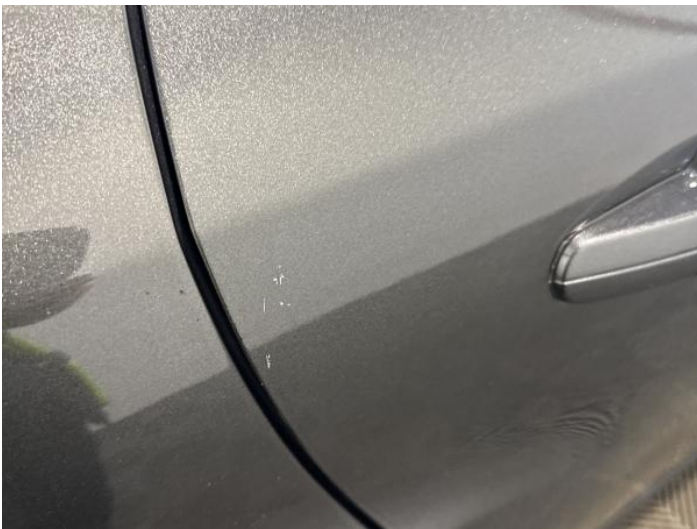
17: Door osr Chipped 1 To 5