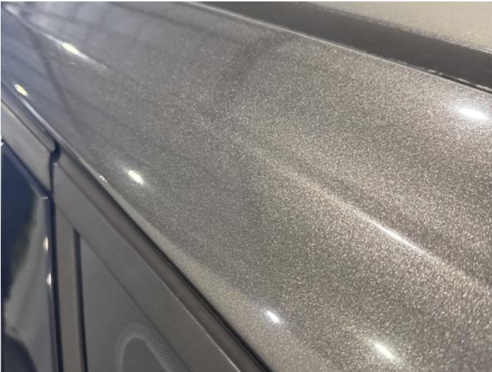
9: C Post ns Dented Between 10mm + 30mm