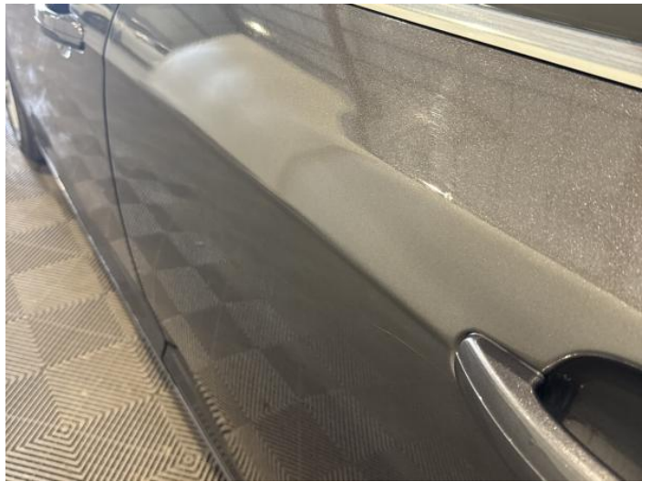
8: Door nsr Poor Previous Repair Rippled Up To 30%