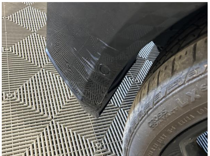
8: Bumper Front Scratched 25 to 100mm Thru Paint