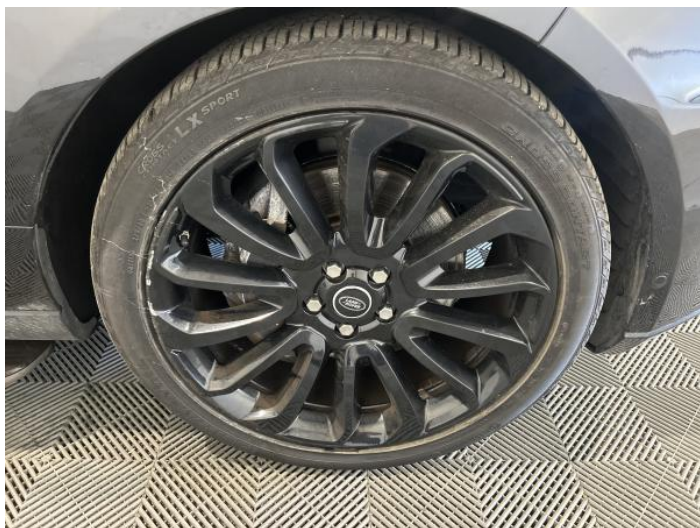
1: Wheel osf Scratched Over 50mm