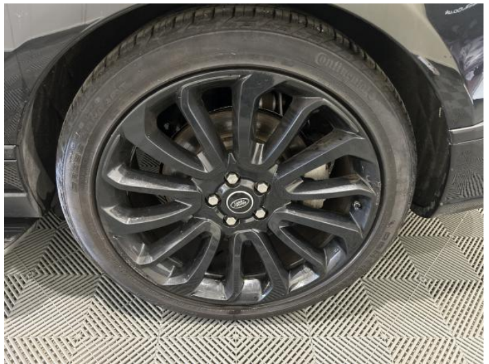
6: Wheel nsr Scratched Over 50mm