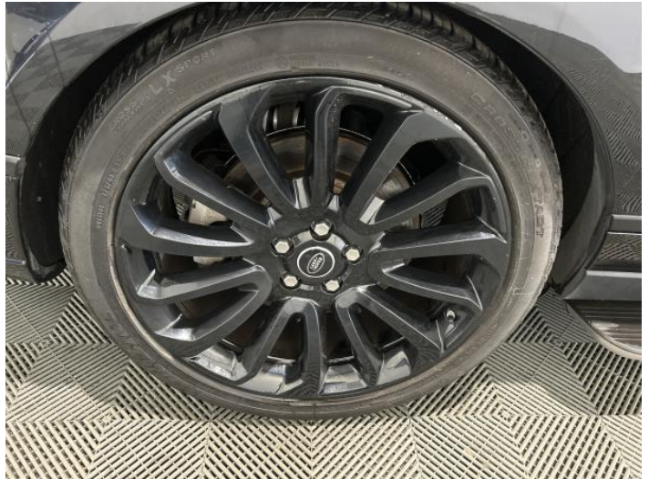
4: Wheel osr Scratched Over 50mm