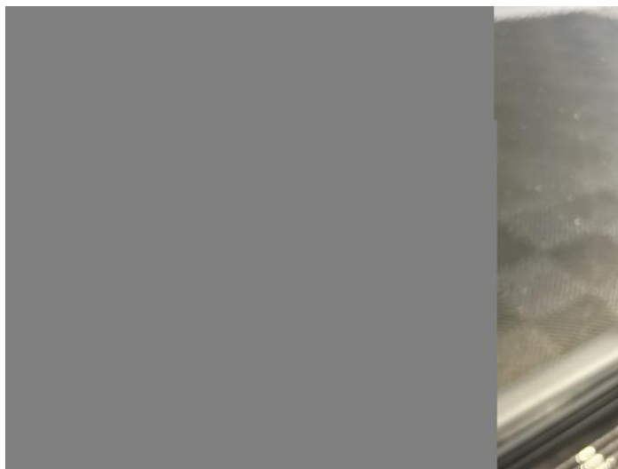
2: Door osf Chipped 1 To 5