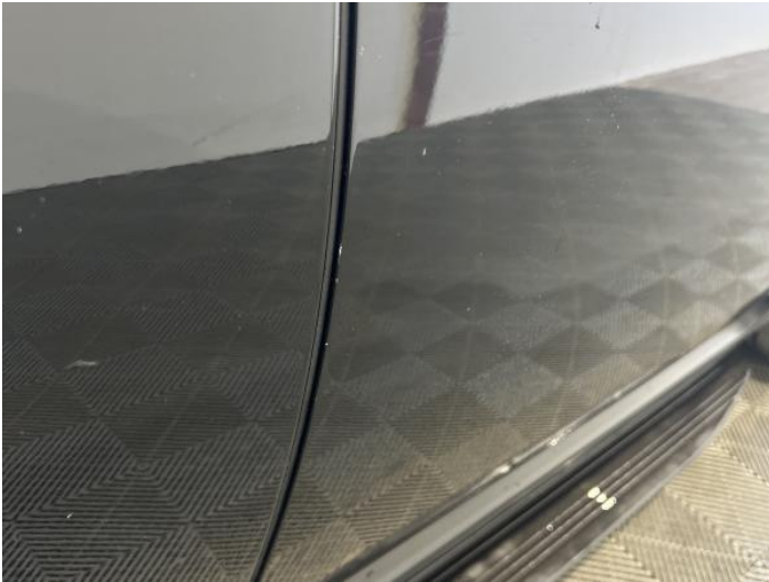
3: Door osf Chipped Edge Chip