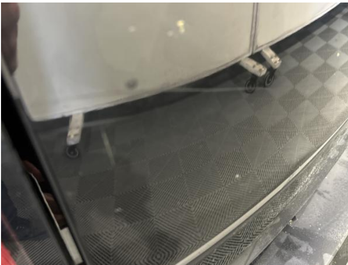
5: Tailgate Scratched Over 25mm Thru Paint