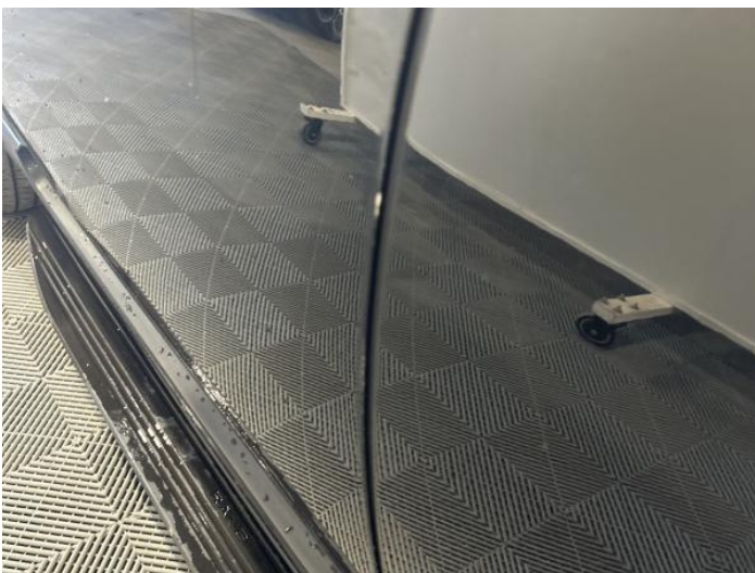
7: Door nsf Chipped Edge Chip