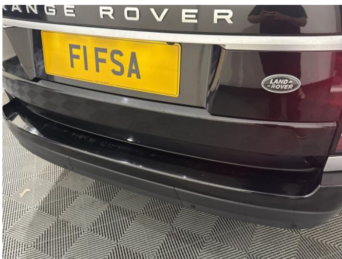
11: Bumper Rear Chipped Multiple Chips