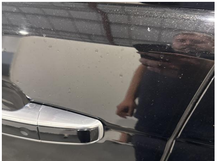
6: Door nsf Chipped 1 To 5