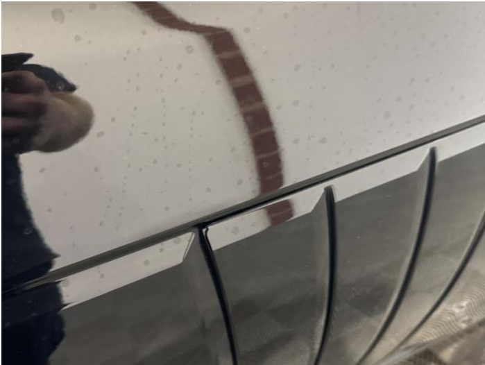
15: Door osf Dented Over 2 UpTo 10mm