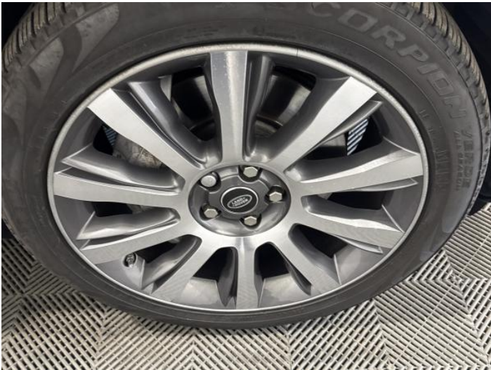
17: Wheel osf Scratched Up To 50mm