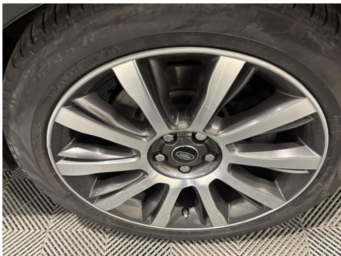
9: Wheel nsr Scratched Up To 50mm