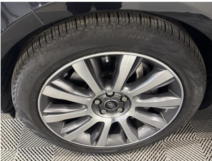
5: Wheel nsf Scratched Up To 50mm