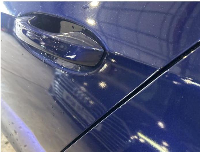
5: Door nsr Poor Previous Repair Poor Paint