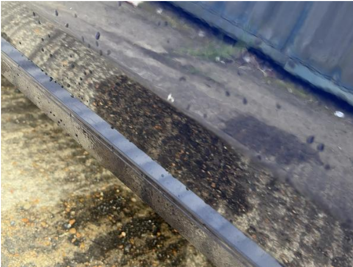
3: Door nsf Chipped 1 To 5