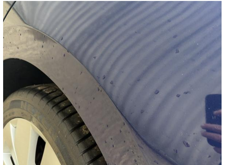
2: Qtr Panel nsr Poor Previous Repair Poor Paint