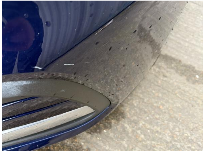
4: Bumper Front Scratched UpTo 25mm Thru Paint