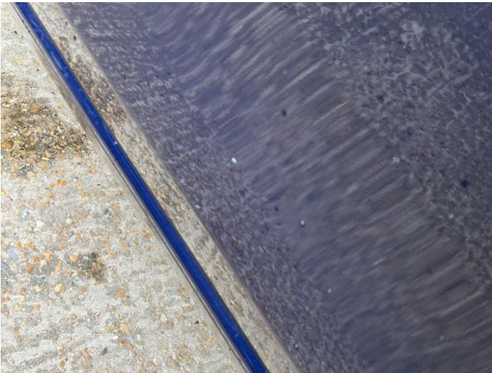
1: Door osf Chipped 1 To 5