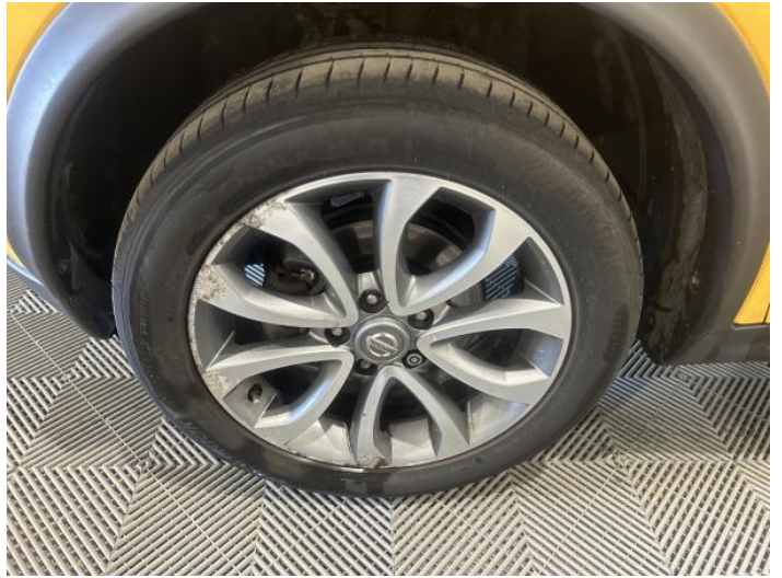
4: Wheel nsf Corroded Light