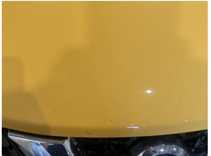
6: Bonnet Chipped Multiple Chips