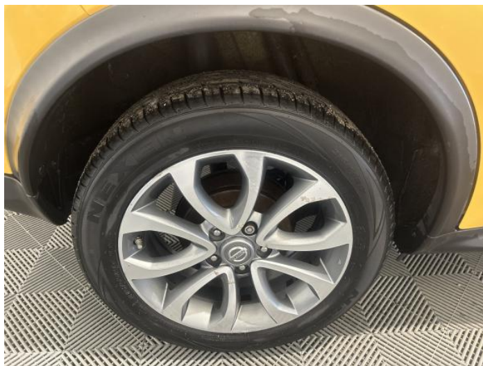
2: Wheel osr Corroded Light