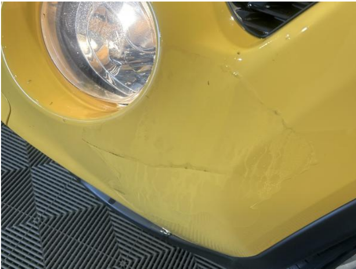
5: Bumper Front Poor Previous Repair Paint Flake