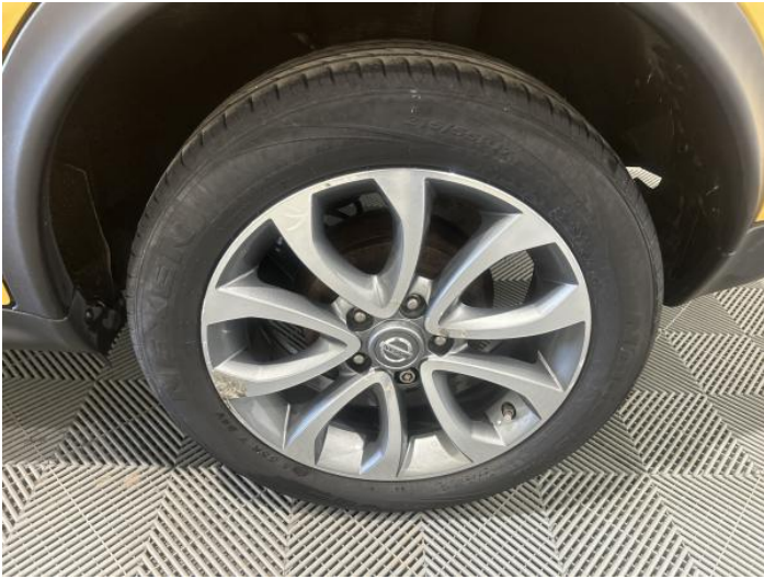
3: Wheel nsr Corroded Light