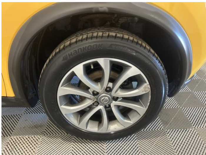
1: Wheel osf Corroded Light