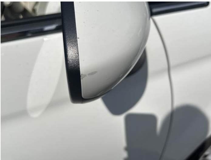
1: Door Mirror Assy of Scratched (Painted) UpTo 25mm Thru Paint