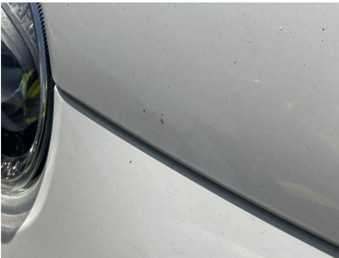
5: Bonnet Chipped 1 To 5