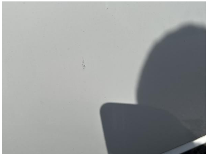
2: Door of Chipped 1 To 5