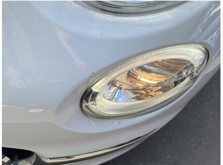
4: Bumper Front Chipped Multiple Chips