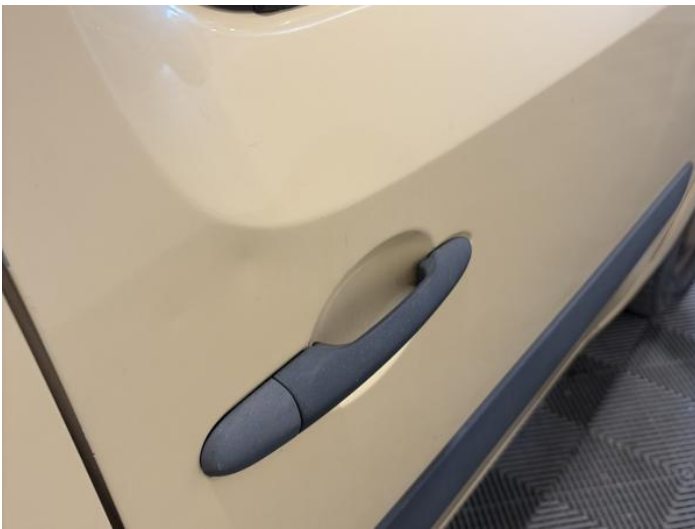
17: Door osf Dented Over 30mm