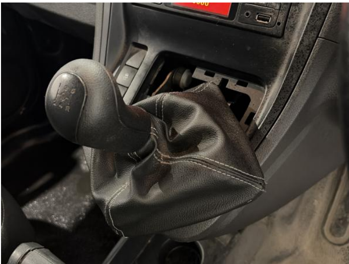
1: Switches And Controls Broken Replace