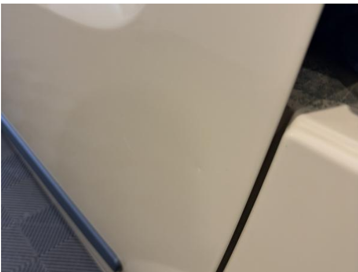
7: Door nsr Dented Between 10mm + 30mm