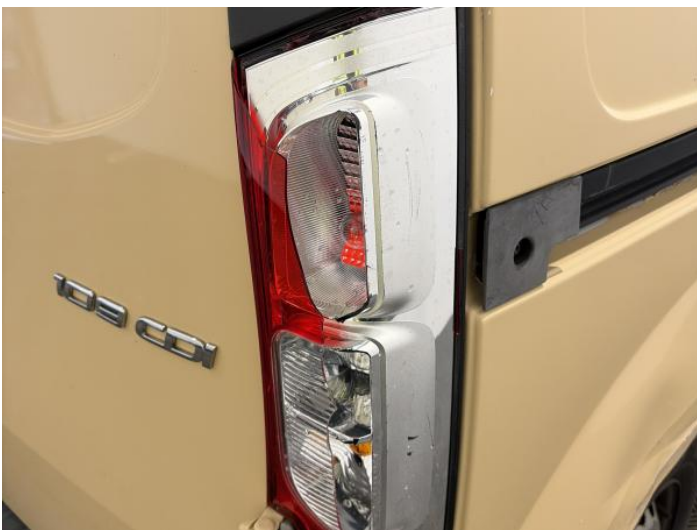
13: Lamp osr Broken Replace