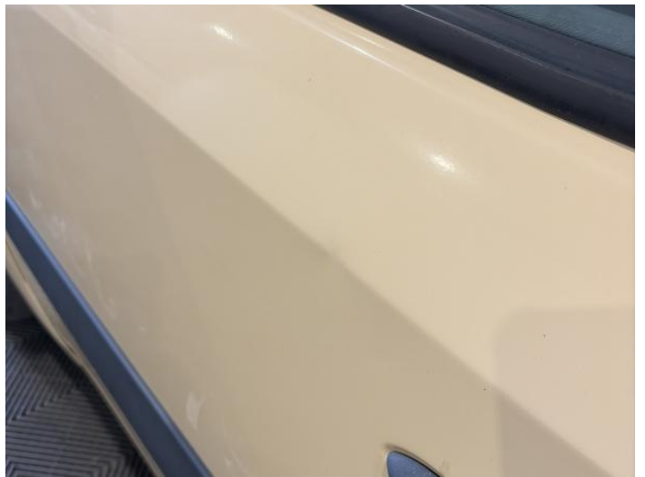
6: Door nsf Dented Between 10mm + 30mm