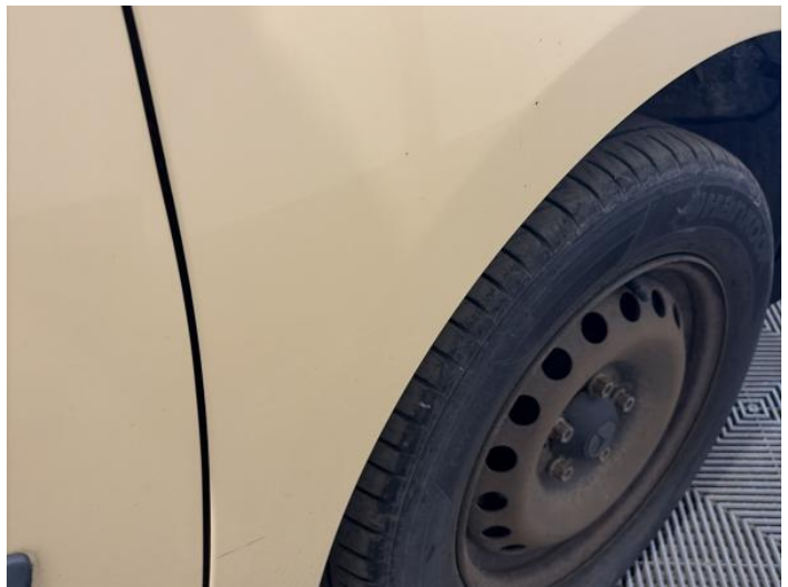
18: Wing osf Scratched Over 25mm Thru Paint