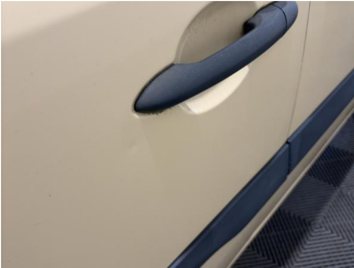
15: Door osr Dented Between 10mm + 30mm