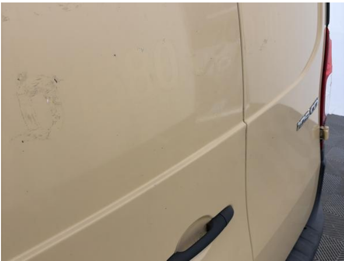
11: Tailgate Dented With Paint Damage