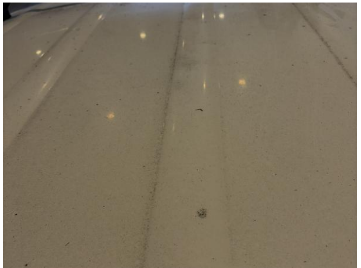
12: Roof Dented With Paint Damage