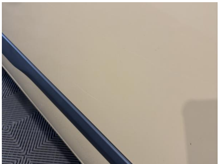
8: Door nsr Scratched Over 25mm Thru Paint