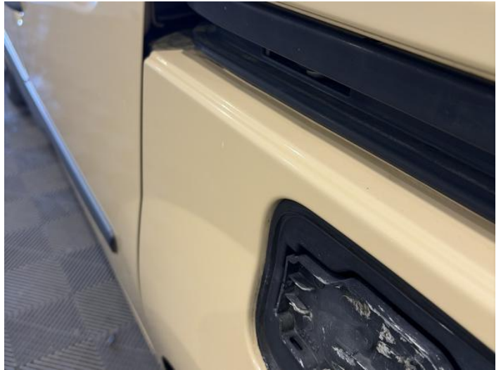
10: Qtr Panel nsr Dented Between 10mm + 30mm