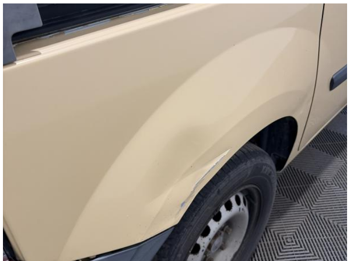
14: Qtr Panel osr Dented With Paint Damage