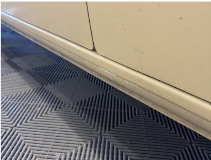
5: Sill ns Scratched Over 25mm Thru Paint