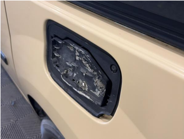
9: Fuel Flap Missing Replace