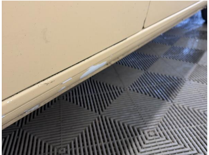
16: Sill os Scratched Over 25mm Thru Paint