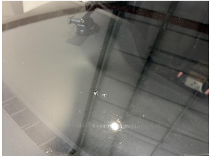
4: Screen Front Chipped Over 10mm