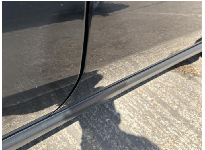
4: Door osf Chipped Edge Chip