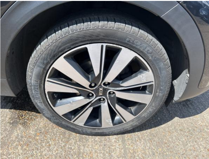
1: Wheel osf Corroded Light