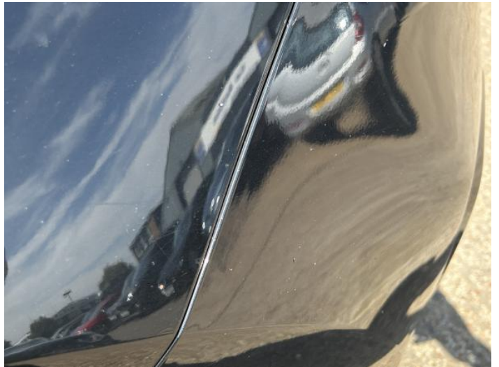
2: Wing osf Chipped 1 To 5