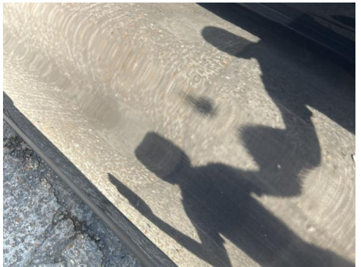
12: Door nsr Dented 2 Or Less UpTo 10mm