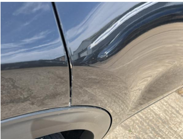
7: Door osr Chipped Edge Chip