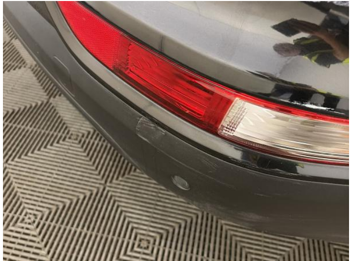
22: Bumper Rear Moulding Scuffed (Unpainted) Over 100mm