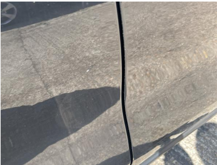
5: Door osr Chipped 1 To 5