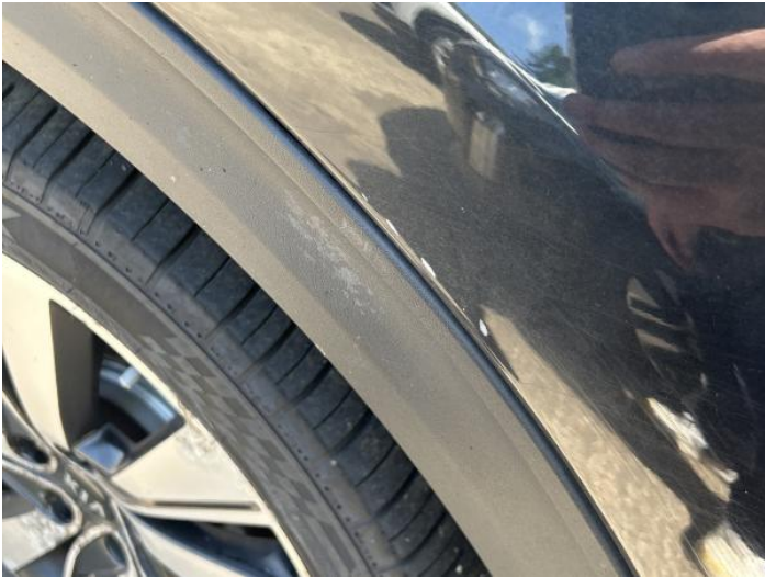
15: Wing nsf Chipped 1 To 5