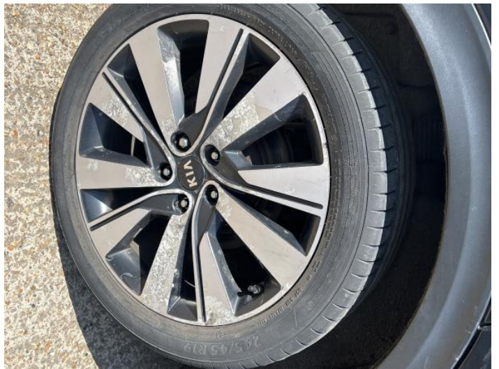
6: Wheel osr Corroded Light