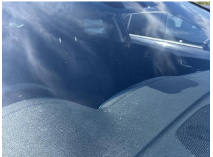
18: Screen Front Chipped UpTo 10mm