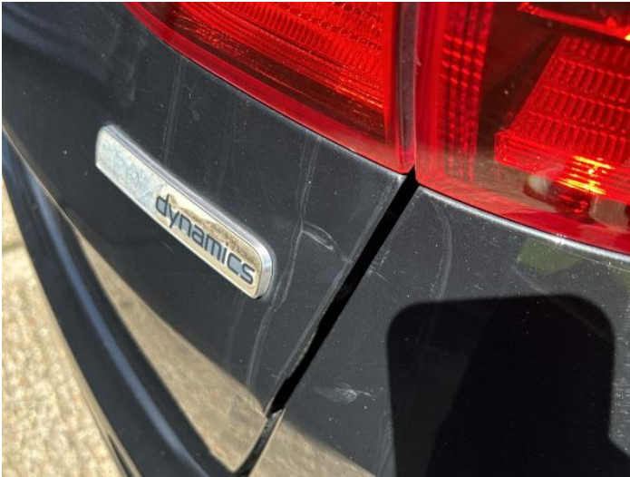
21: Tailgate Dented Over 30mm