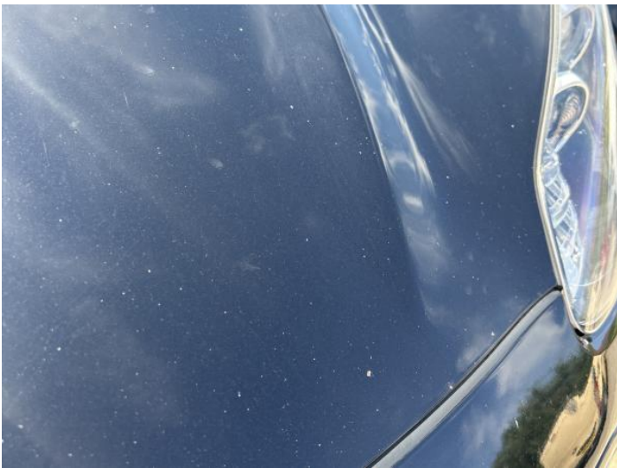
17: Bonnet Chipped Multiple Chips