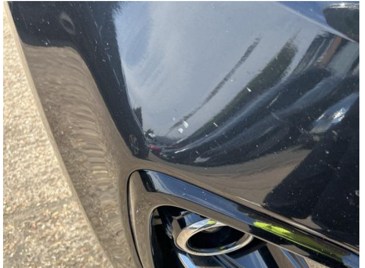
16: Bumper Front Chipped Multiple Chips