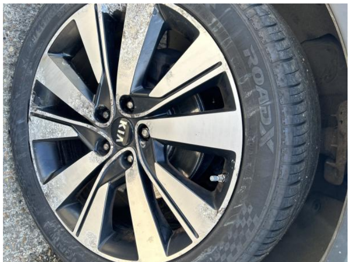
14: Wheel nsf Corroded Light