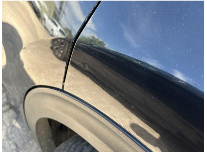
10: Qtr Panel nsr Dented 2 Or Less UpTo 10mm