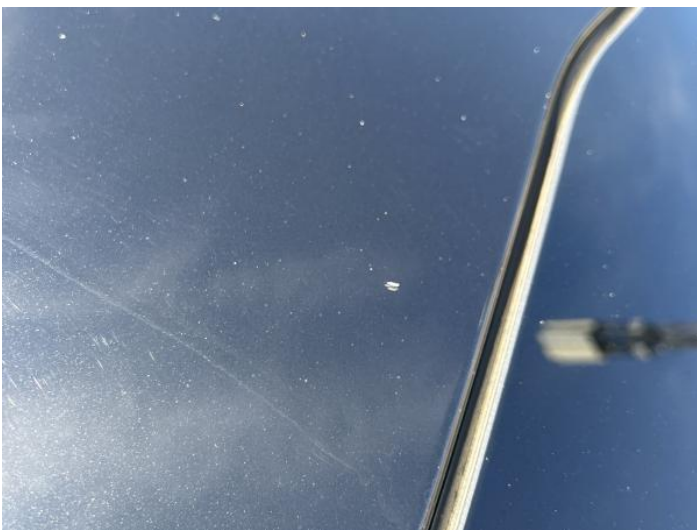
19: Roof Chipped 1 To 5