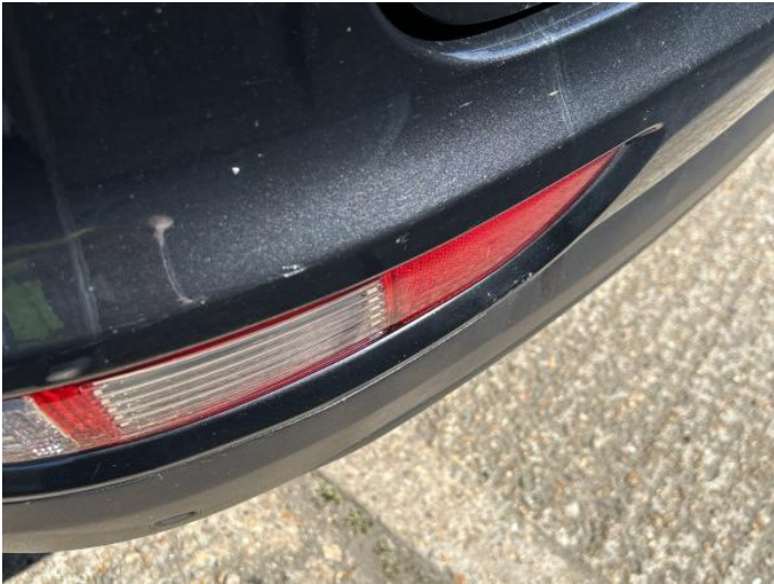
9: Bumper Rear Chipped 1 To 5