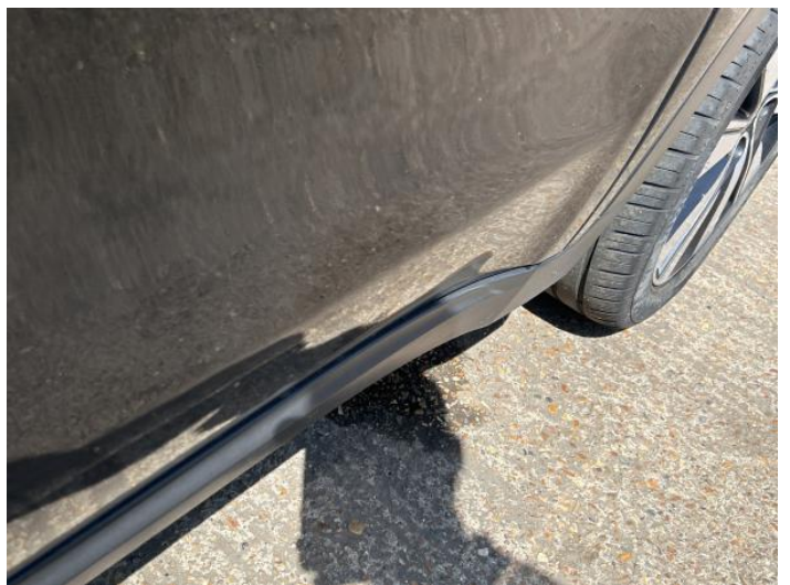
20: Door osf Dented Between 10mm + 30mm