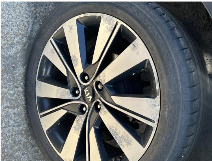
11: Wheel nsr Corroded Light