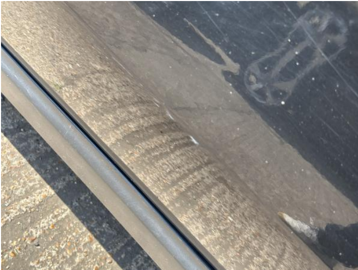
3: Door osf Chipped 1 To 5