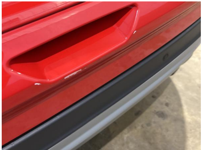
2: Tailgate Scratched Over 25mm Thru Paint