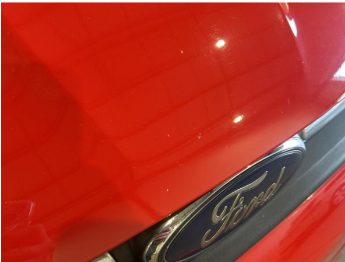
5: Bonnet Chipped 1 To 5