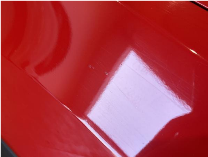
3: Wing nsf Chipped 1 To 5