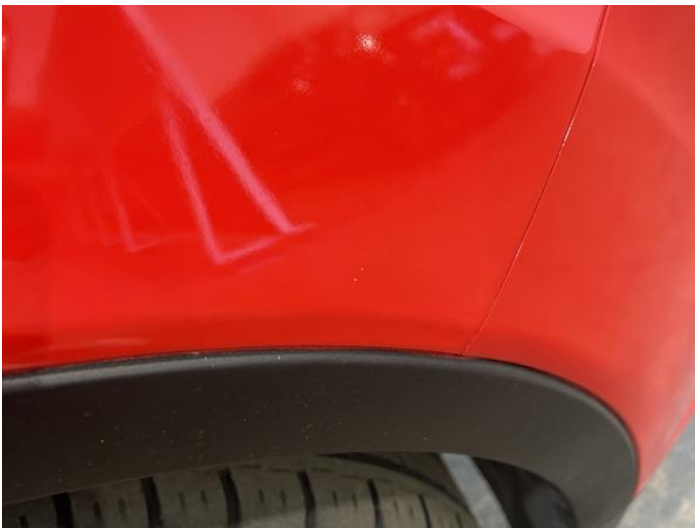
1: Wing of Chipped 1 To 5