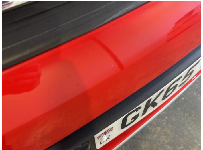
4: Bumper Front Chipped Multiple Chips