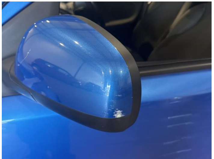
18: Door Mirror Assy nsf Scratched (Painted) UpTo 25mm Thru Paint