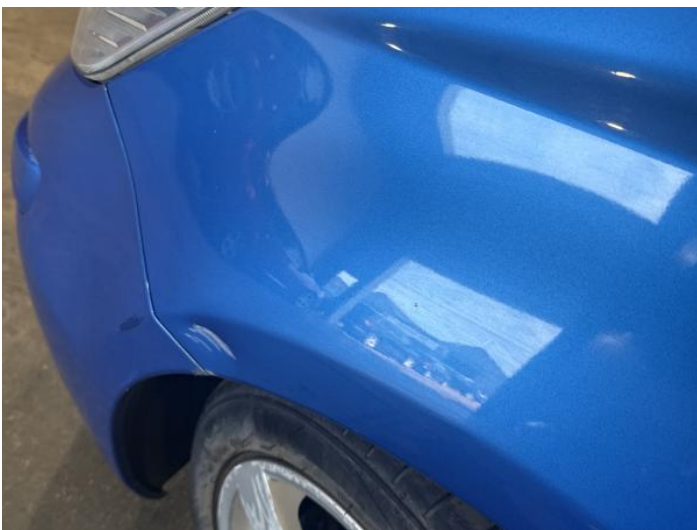
19: Wing nsf Dented With Paint Damage