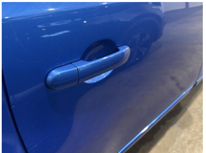
8: Door osr Scratched Rusted