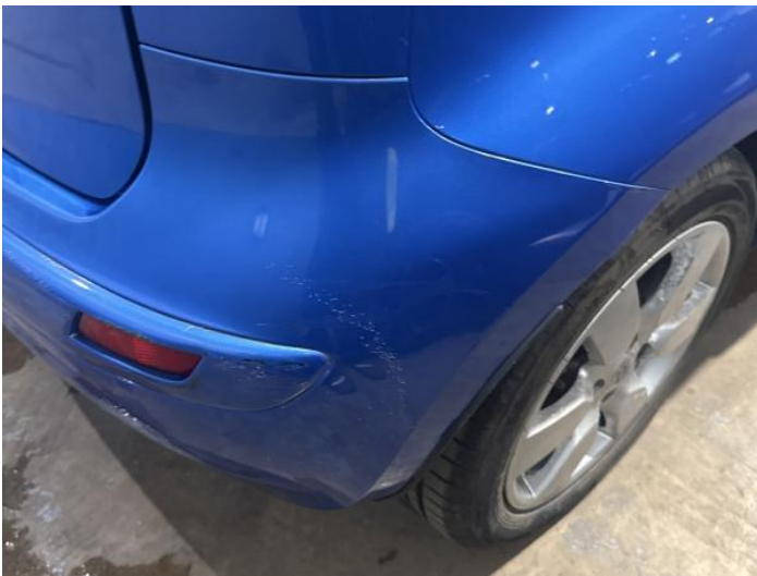
11: Bumper Rear Scratched Over 100mm Thru Paint