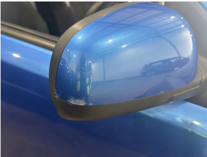
5: Door Mirror Assy osf Scratched (Painted) UpTo 25mm Thru Paint