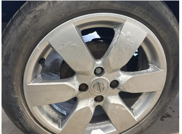
10: Wheel osr Scratched Over 50mm