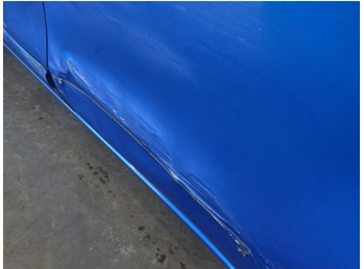
16: Door Moulding nsr Broken Replace