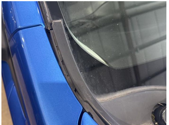
6: Other N/A N/A