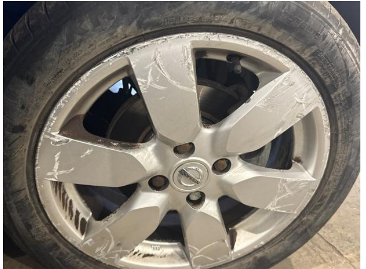
4: Wheel osf Scratched Over 50mm