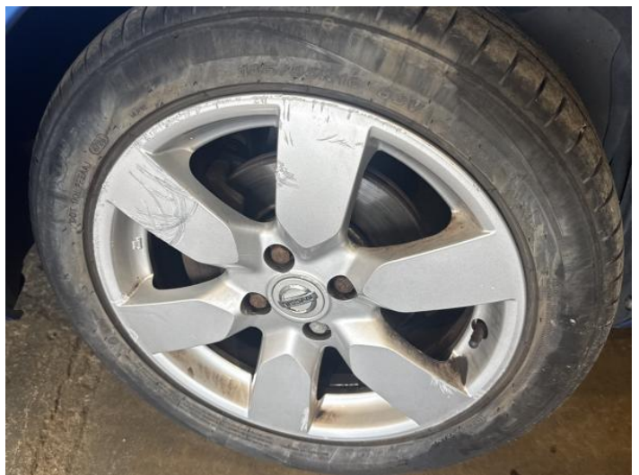
20: Wheel osf Scratched Over 50mm