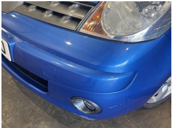
2: Bumper Front Poor Previous Repair Paint Flake