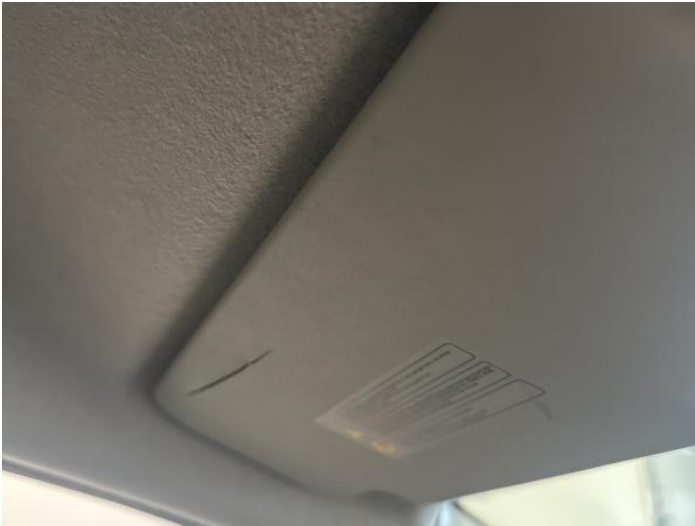
21: Sunvisor ns Torn Over 10mm