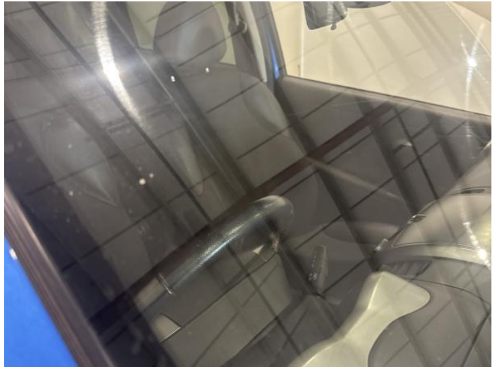
22: Screen Front Chipped Over 10mm