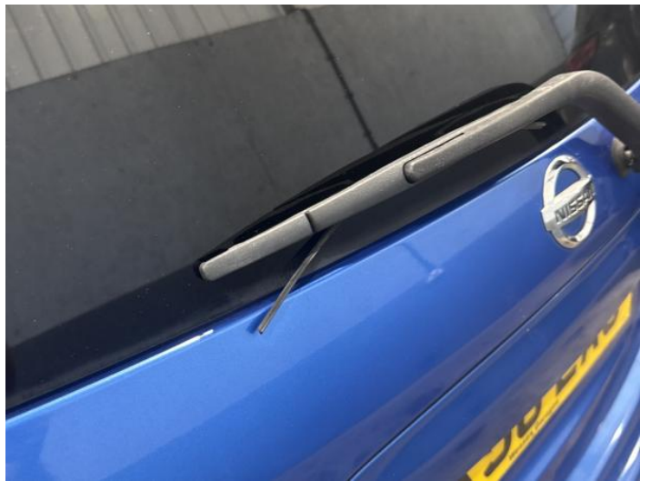
12: Wiper Rear Broken Replace