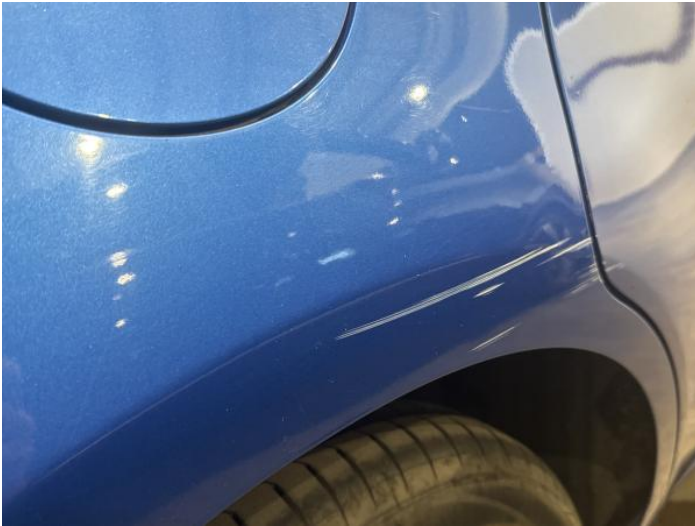
9: Qtr Panel osr Dented With Paint Damage