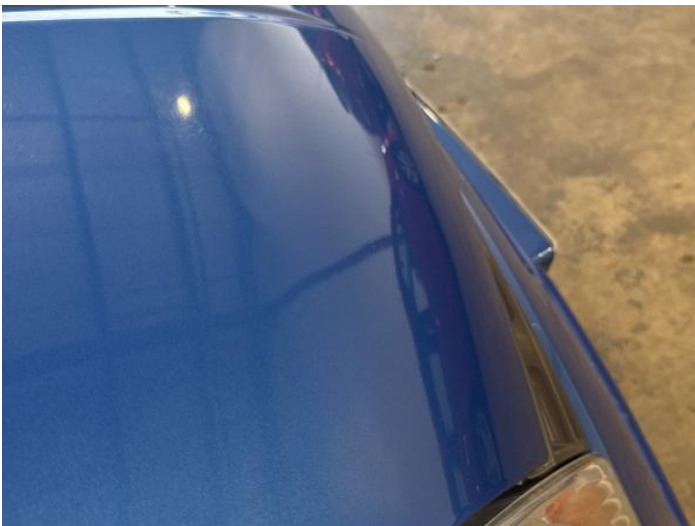
1: Bonnet Dented Over 30mm