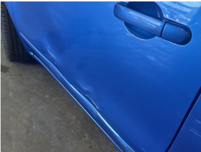
17: Door nsf Dented With Paint Damage