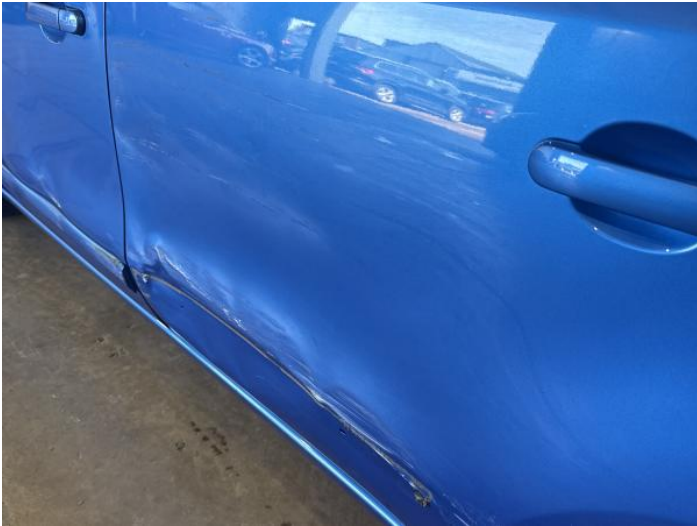
15: Door nsr Dented Over 30% Of Panel