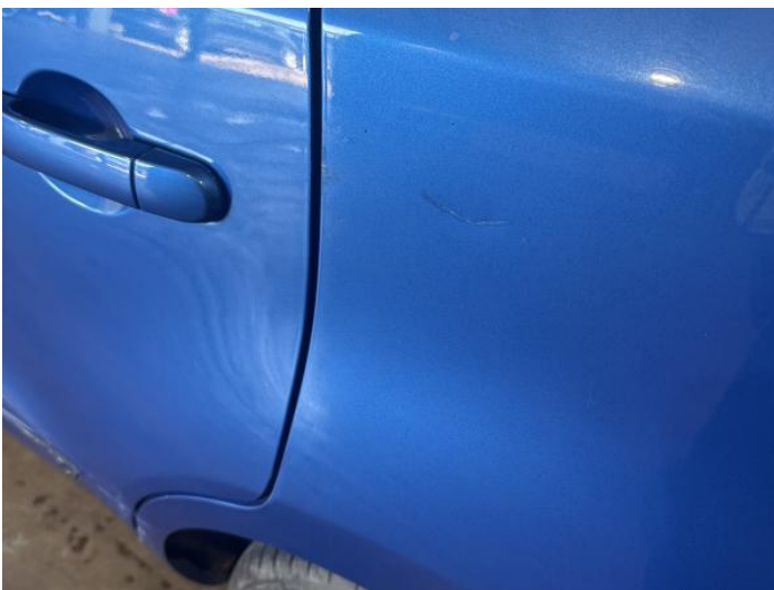
13: Qtr Panel nsr Dented With Paint Damage