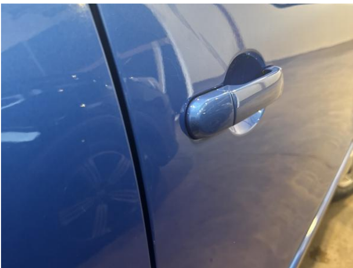
7: Door osf Scratched UpTo 25mm Thru Paint