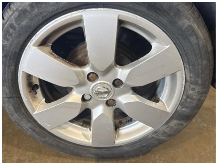
14: Wheel nsr Scratched Over 50mm