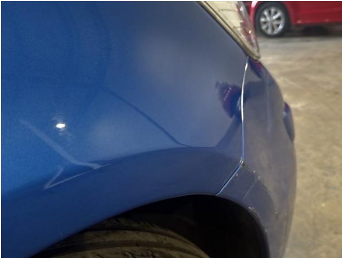
3: Wing osf Scratched Over 25mm Thru Paint