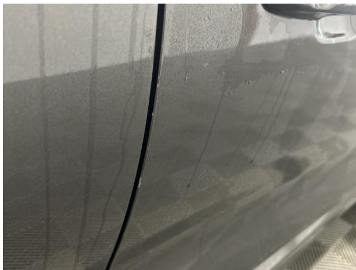
2: Door osf Chipped Edge Chip