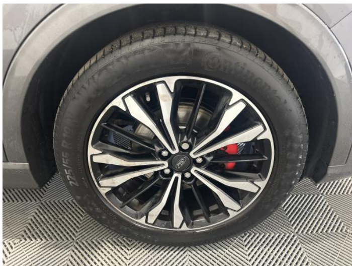
1: Wheel osf Corroded Light