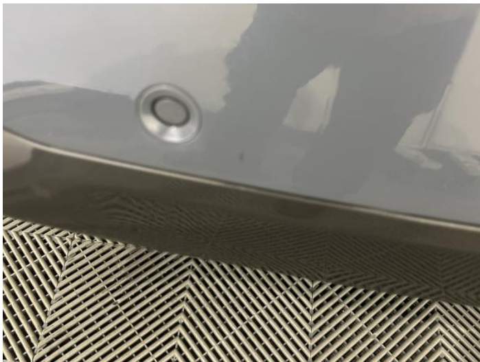
3: Bumper Rear Chipped 1 To 5