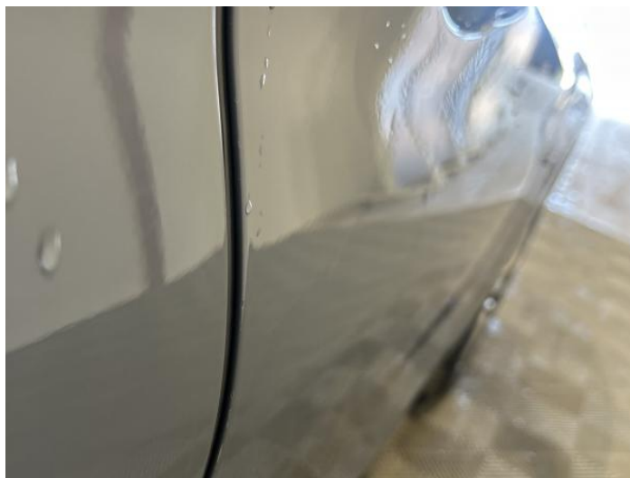
2: Door osf Dented 2 Or Less UpTo 10mm