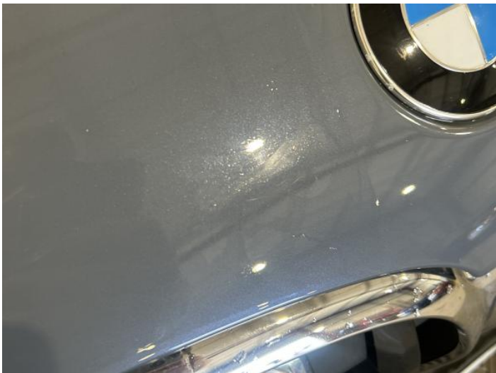
4: Bonnet Chipped 1 To 5