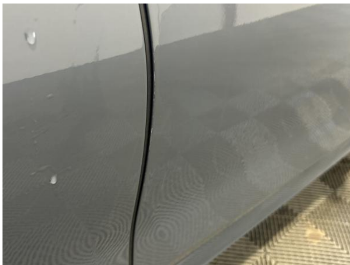
1: Door osf Chipped Edge Chip