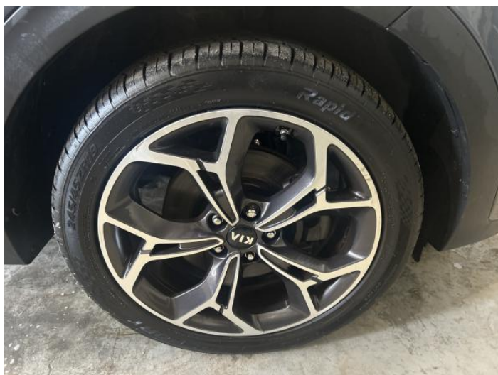
1: Wheel osf Scratched Up To 50mm