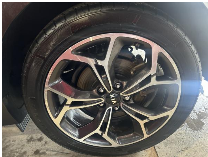
4: Wheel nsr Scratched Over 50mm