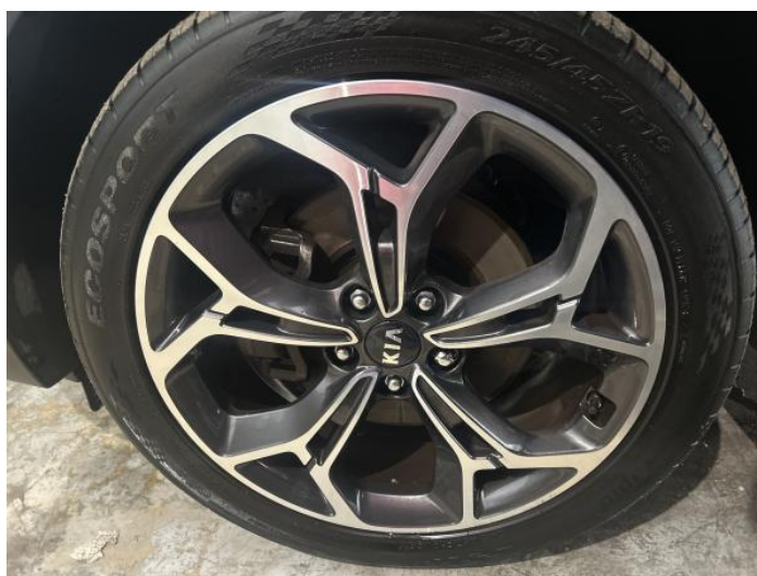
6: Wheel nsf Scratched Up To 50mm