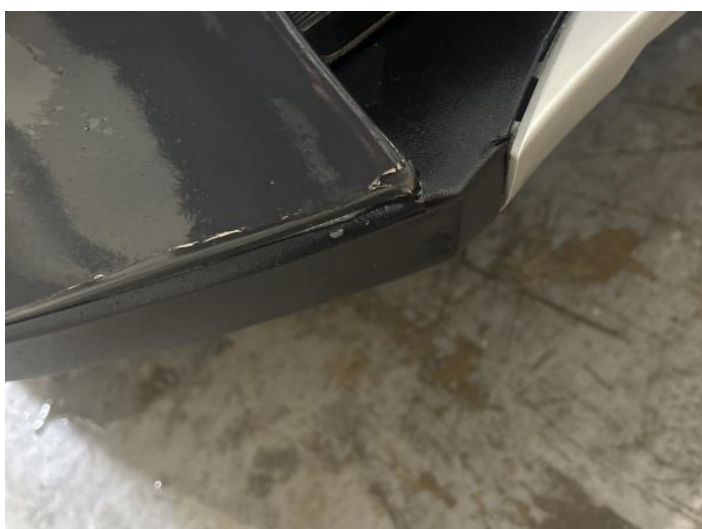
7: Bumper Front Cracked UpTo 25mm