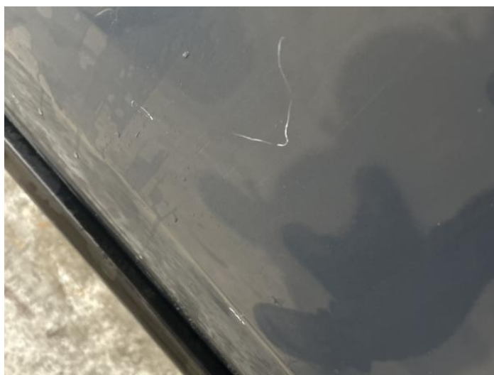
2: Door osf Scratched Over 25mm Thru Paint