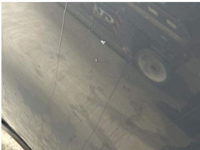
3: Door osr Chipped 1 To 5