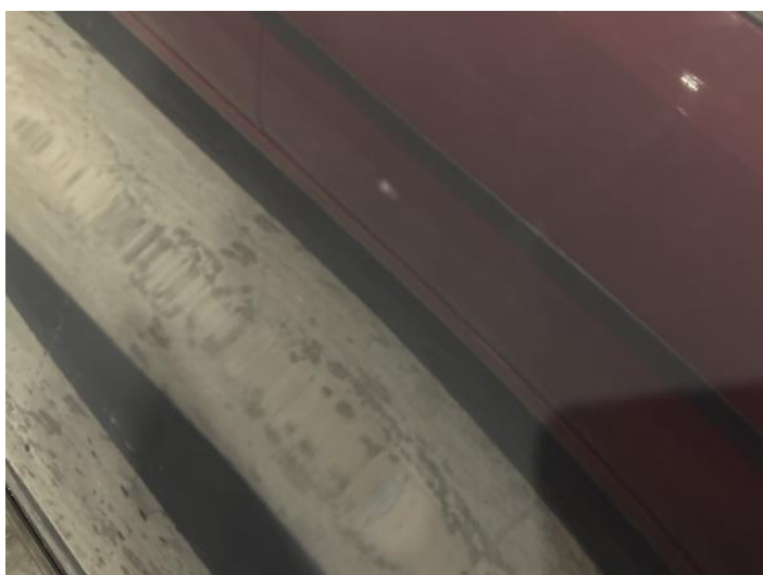
5: Door nsr Chipped 1 To 5