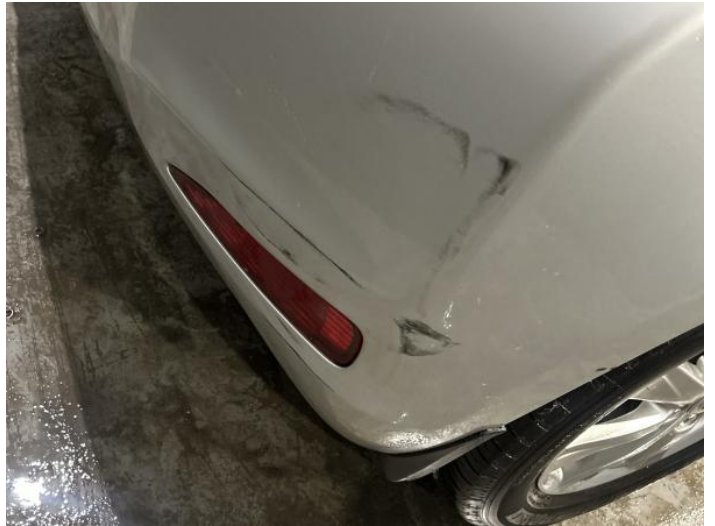
4: Bumper Rear Scratched 25 to 100mm Thru Paint