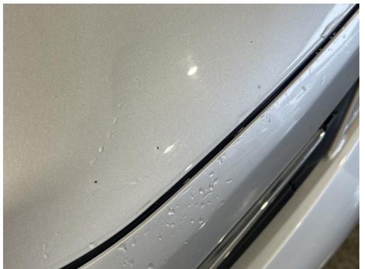
8: Bonnet Chipped 1 To 5