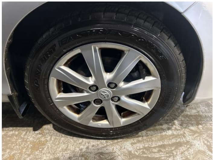
2: Wheel osf Scratched Over 50mm