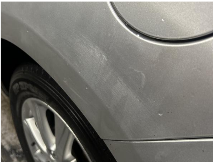
5: Qtr Panel nsr Poor Previous Repair Poor Paint