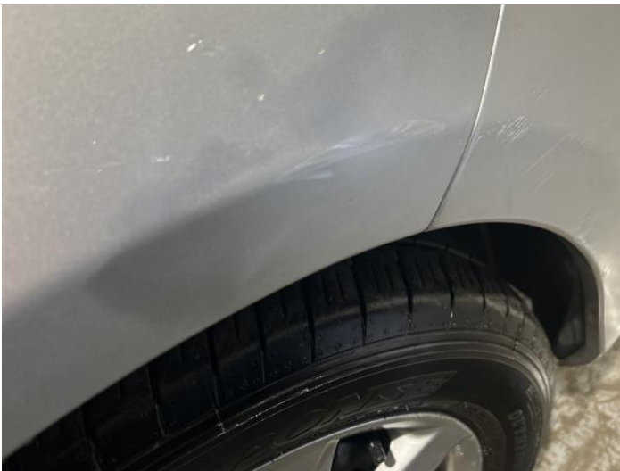
1: Wing osf Poor Previous Repair Poor Paint