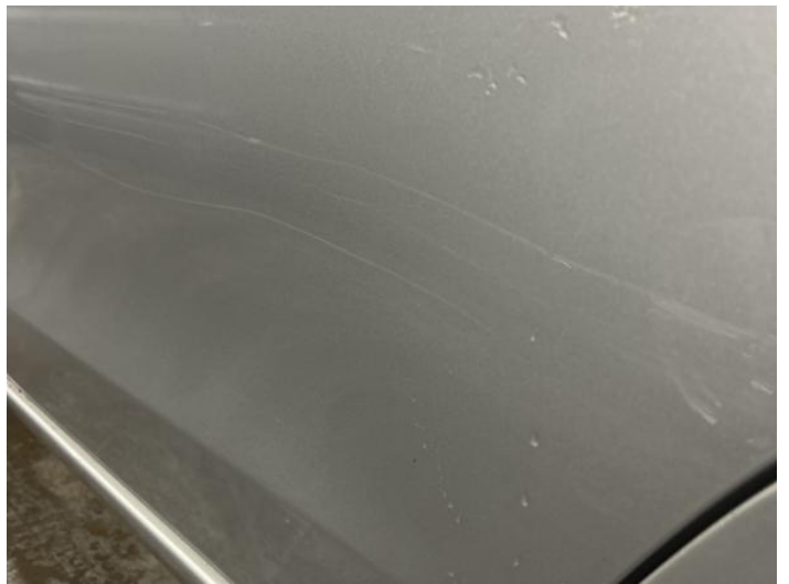
6: Door nsr Scratched Over 25mm Not Thru Paint