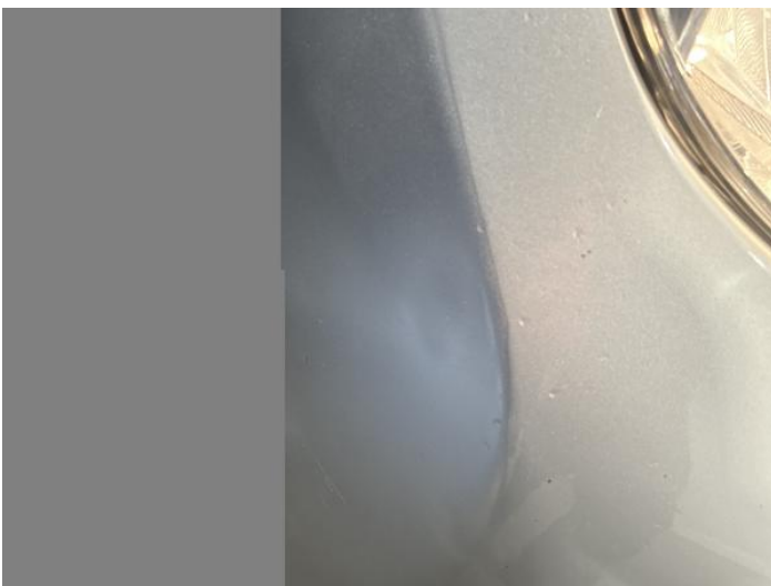
7: Bumper Front Poor Previous Repair Poor Paint