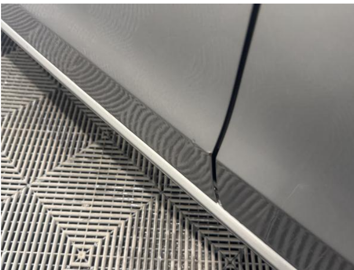
7: Door nsf Chipped Edge Chip