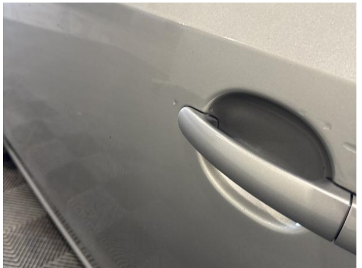
6: Door nsf Dented Over 2 UpTo 10mm