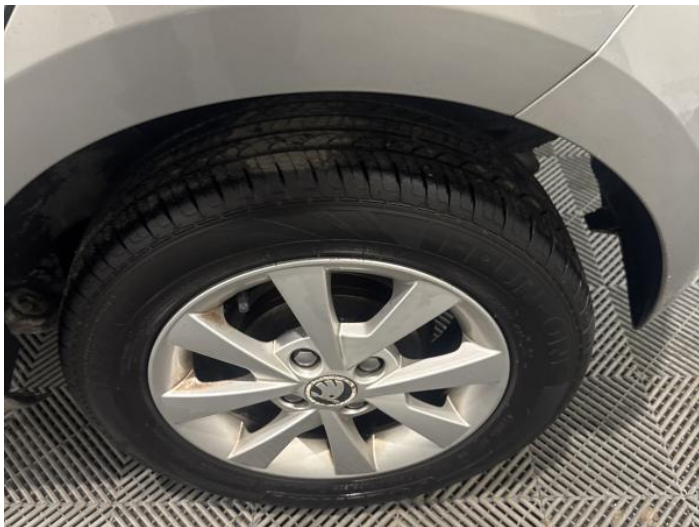
9: Wheel nsr Scratched Up To 50mm