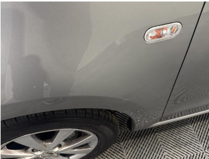
5: Wing nsf Dented Over 2 UpTo 10mm