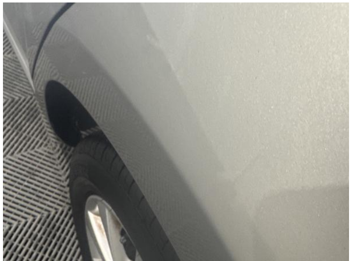
10: Qtr Panel nsr Dented 2 Or Less UpTo 10mm