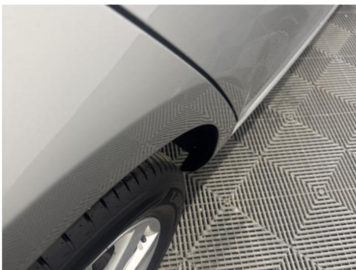
13: Qtr Panel osr Dented 2 Or Less UpTo 10mm