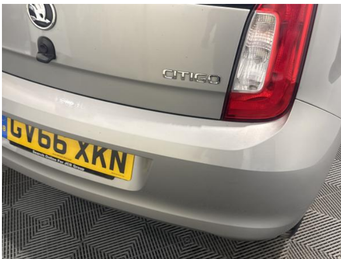
11: Bumper Rear Chipped Multiple Chips